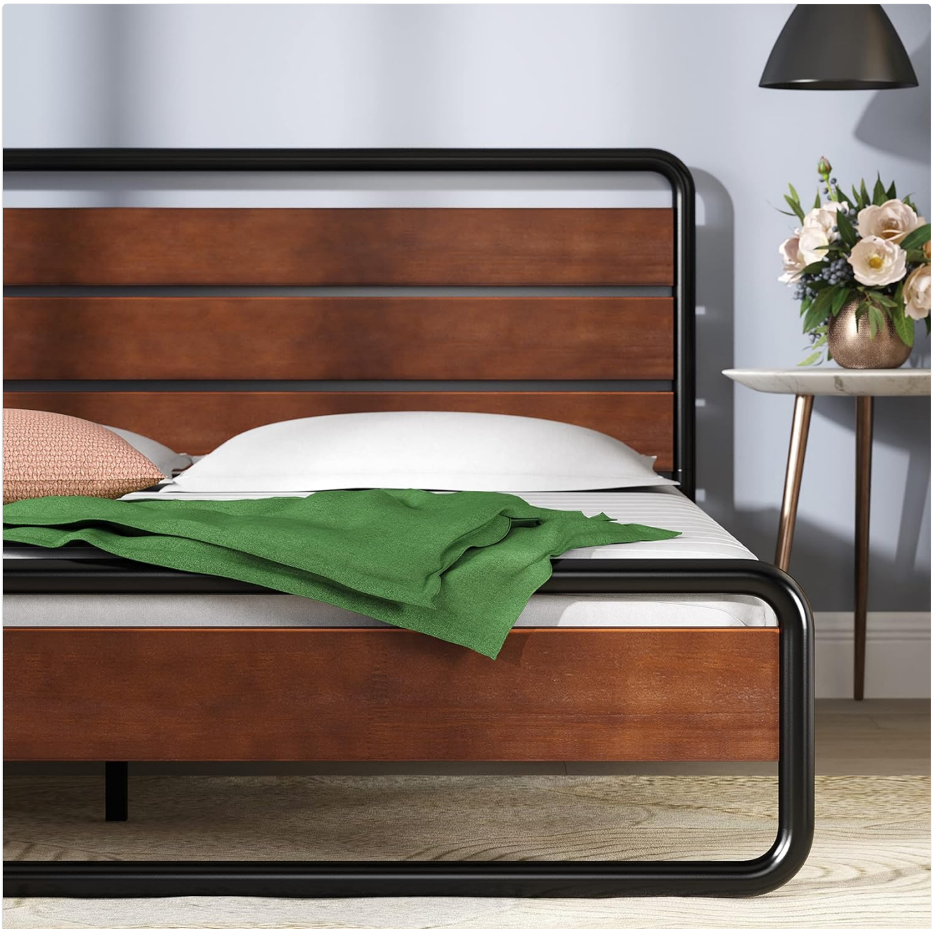
Image: A fully assembled Zinus Therese Queen size platform bed with a mattress and bedding, showcasing its functional design.