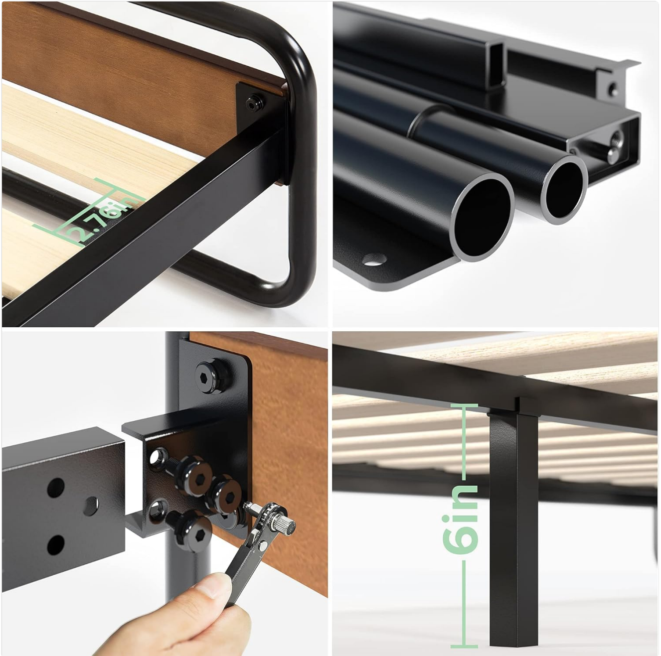
Image: Detailed view of bed frame assembly, illustrating how bolts connect the frame components and showing the support leg structure.