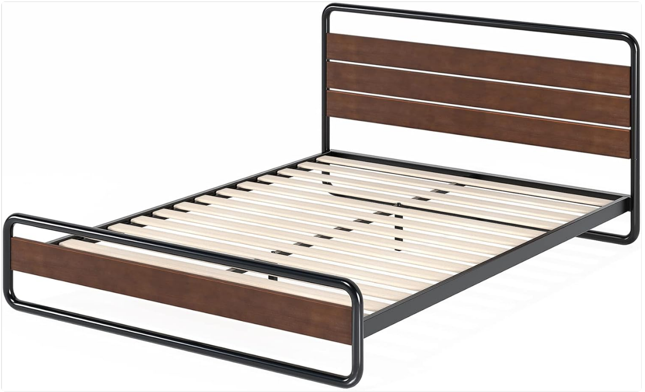
Image: The Zinus Therese bed frame without a mattress, clearly displaying the wood slat support system designed for mattress stability.