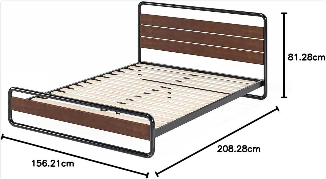
Image: Diagram illustrating the dimensions (length 208.28 cm, width 156.21 cm, height 81.28 cm) of the Zinus Therese Queen bed frame.