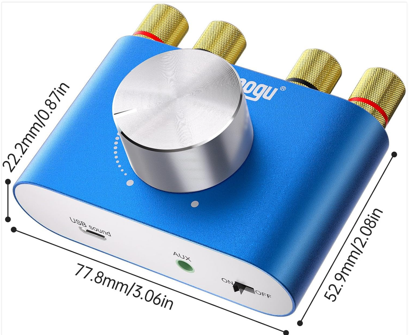
Image: A visual representation of the Facmogu F900S amplifier's dimensions, indicating its compact size.