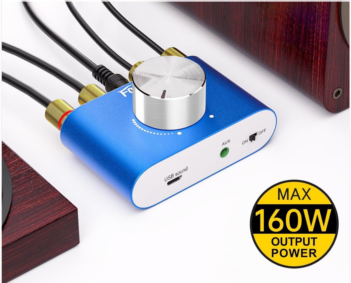
Image: The Facmogu F900S amplifier connected to a pair of speakers, illustrating a typical setup for audio playback.