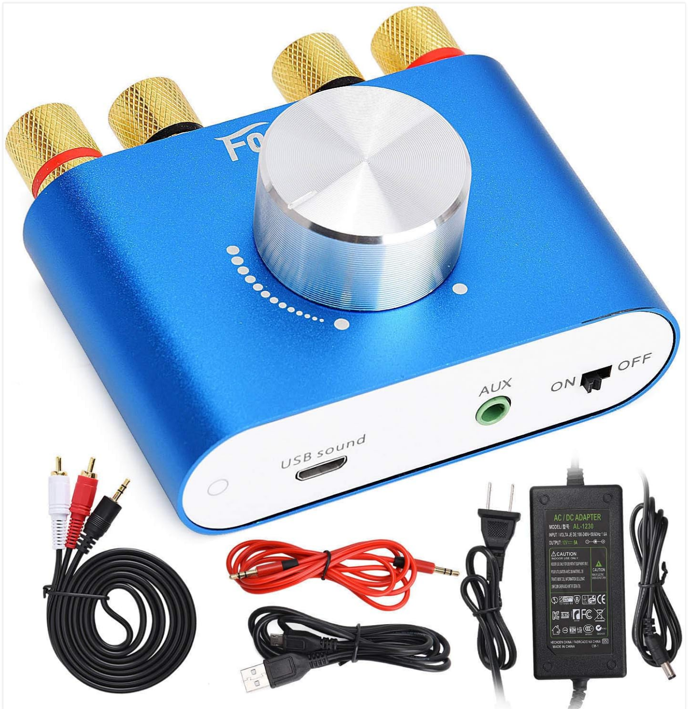
Image: The Facmogu F900S amplifier shown with its complete set of included accessories, including the power adapter, USB cable, 3.5mm AUX cable, and RCA to 3.5mm AUX cable.