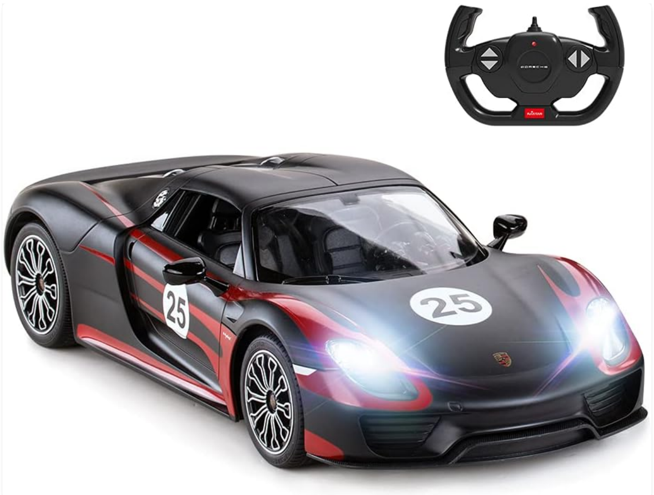
Figure 1.1: The Rastar 1:14 Porsche 918 Spyder RC Car and its remote controller.

Key features include working LED headlights and taillights, a 4-wheel independent suspension system, shock absorption, and a differential mechanism for smooth operation. The car boasts a high-gloss paint job and silver rims with rubber grip tires, enhancing its authentic appearance and performance.