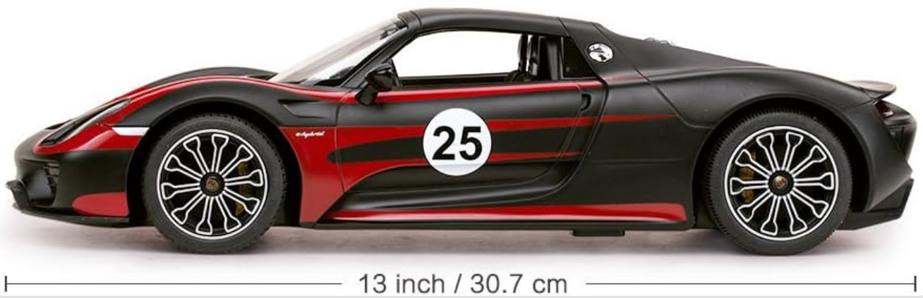
Figure 7.1: Dimensions of the RC Porsche 918 Spyder.