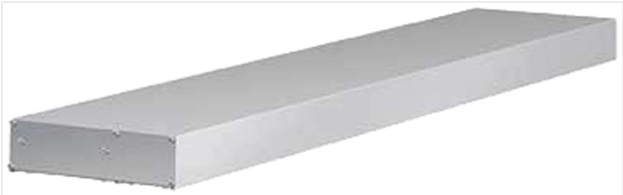
Figure 1: Hatco GRAHL-36-120-TQS Glo-Ray Infrared Foodwarmer. This image shows the overall appearance of the 36-inch strip heat lamp, highlighting its compact and elongated design.

The Hatco GRAHL-36-120-TQS Glo-Ray Infrared Foodwarmer is a 36-inch wide, high-wattage strip-type heat lamp designed for commercial food holding applications. It features a tubular metal heater rod with integrated lights, a single heater rod housing, a built-in toggle switch, and conduit for electrical connection. Constructed from durable aluminum, this unit is engineered to maintain food at optimal serving temperatures while providing illumination.