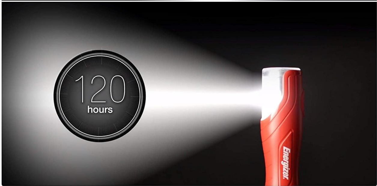
Image: Visual representation of the flashlight's impressive runtime: up to 60 hours in flashlight mode and 120 hours in lantern mode.