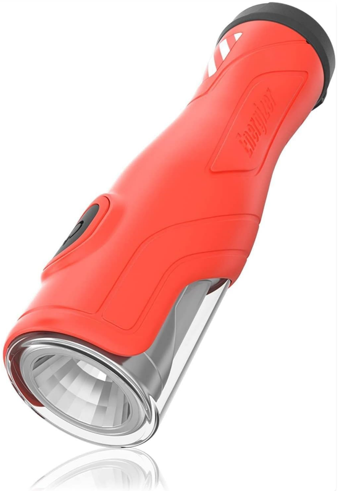
Image: The Energizer WeatherReady Floating Handheld LED Light, showcasing its compact and robust design.