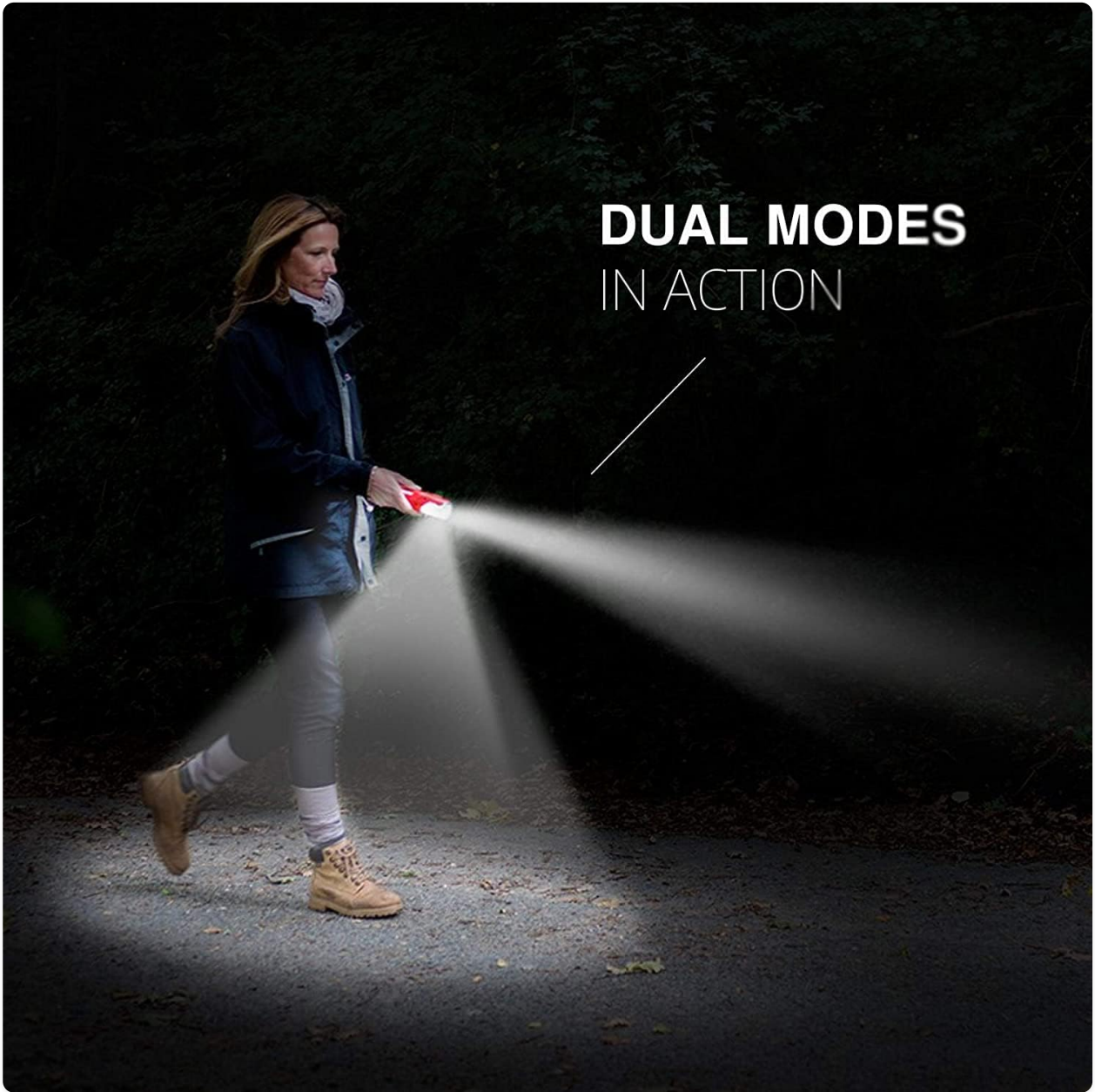
Image: A person demonstrating the dual mode, showing both the forward beam and downward area light in use.