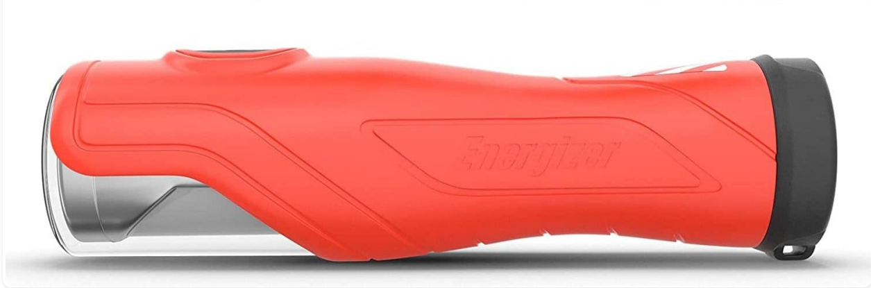
Image: The flashlight resting on a wet surface, illustrating its water-resistant design.