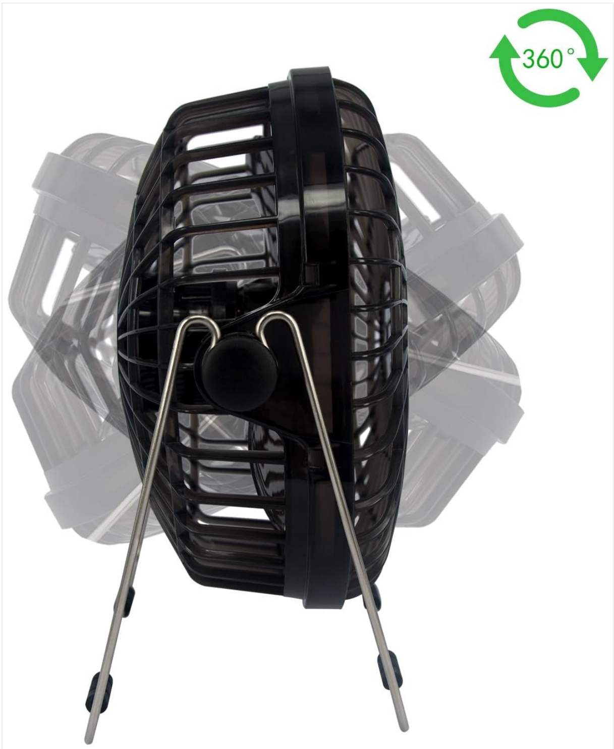
Figure 3: The Helect H1055 USB Fan showing its ability to rotate 360 degrees for optimal airflow positioning.