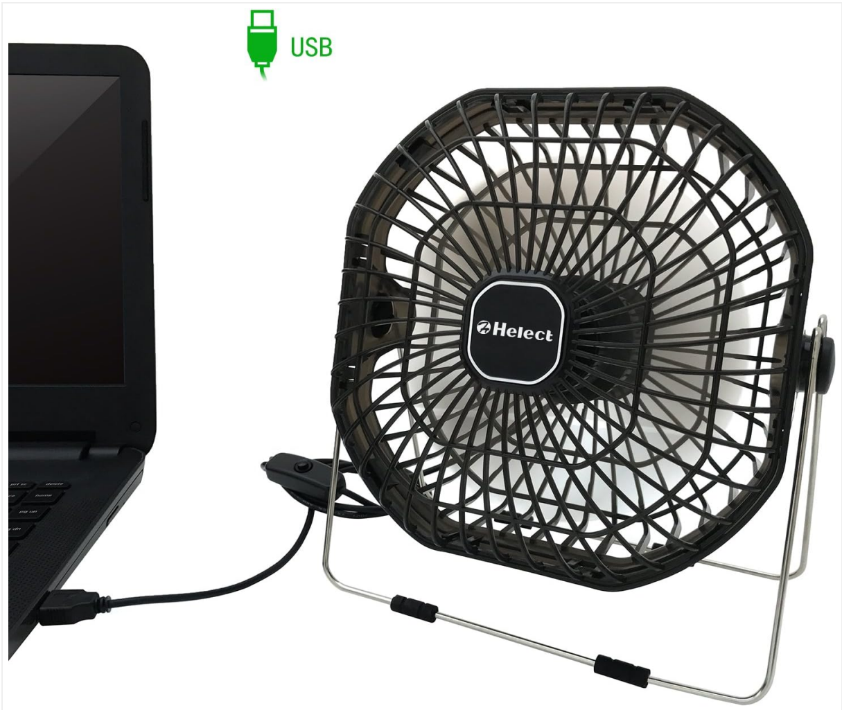
Figure 2: The Helect H1055 USB Fan connected to a laptop via its USB cable for power.