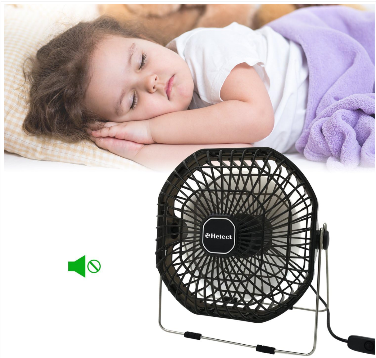
Figure 4: The Helect H1055 USB Fan operating with minimal noise, suitable for quiet environments.