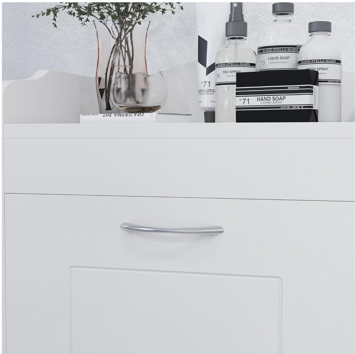
Image: Detailed view of the metal handle on the tilt-out door.