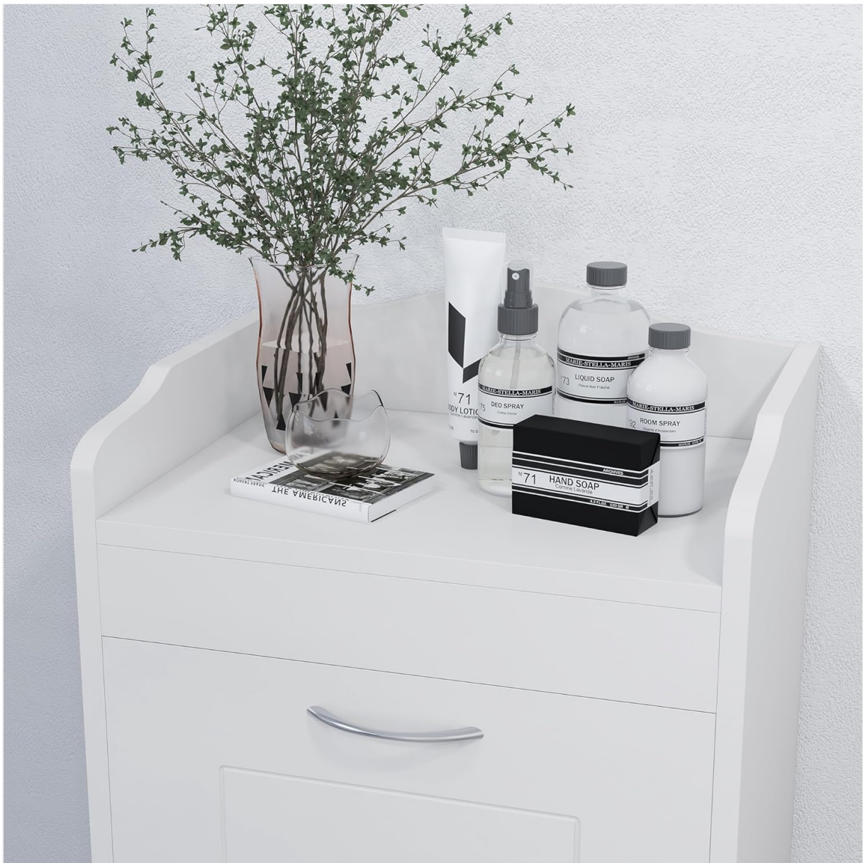
Image: The top surface of the hamper, featuring a decorative curved edge, used for additional storage.