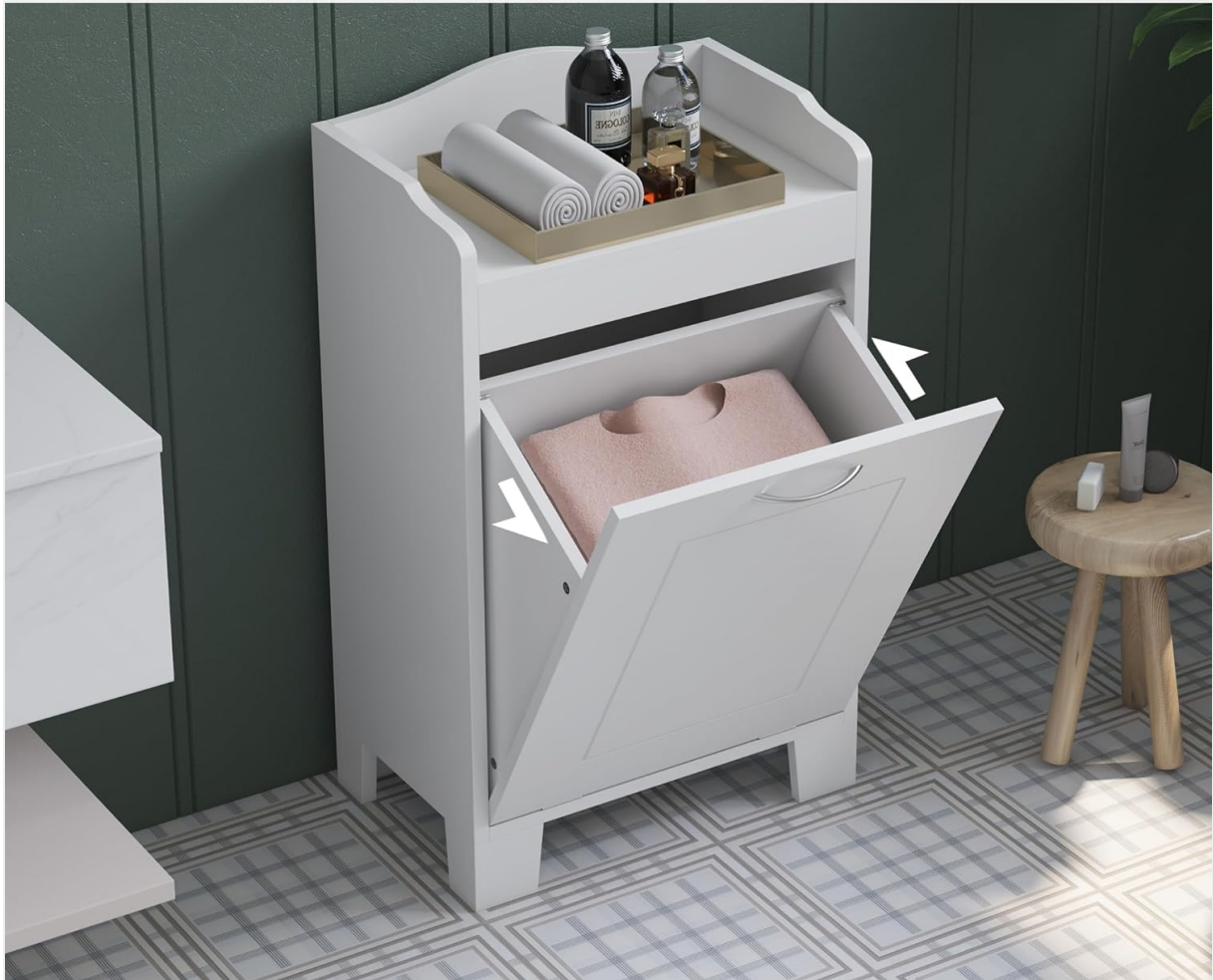
Image: The tilt-out door is open, revealing the removable fabric hamper, ready for use.