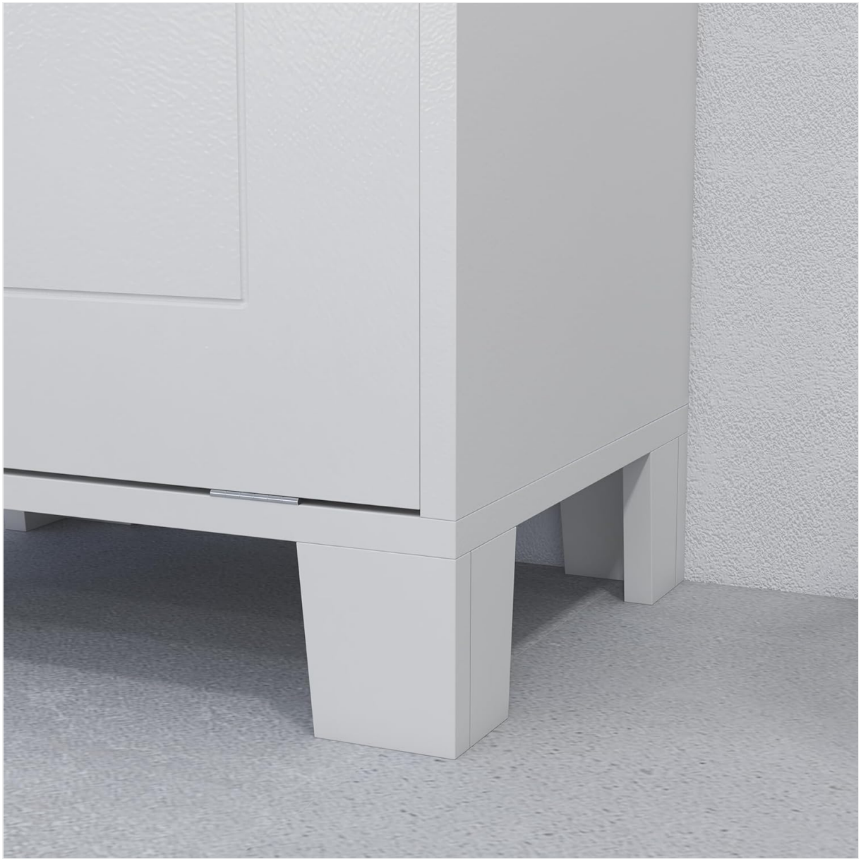
Image: Close-up view of the sturdy legs, providing elevation for the hamper.