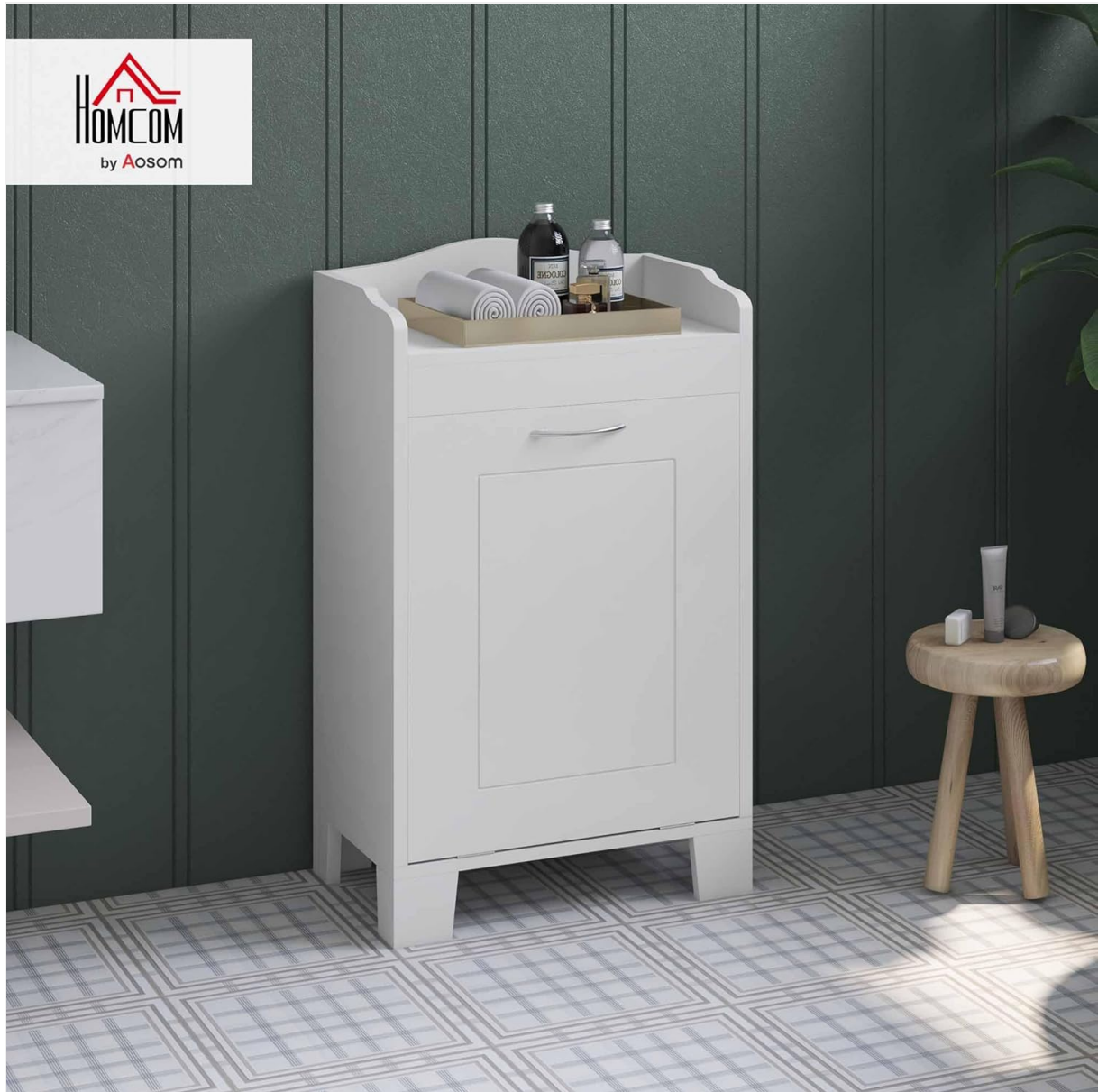
Image: Front view of the assembled HOMCOM 31" Tilt Out Laundry Hamper.

Unpack all components and lay them out on a clean, soft surface (e.g., a blanket or cardboard) to prevent scratches. Identify each part using the provided parts list (if included in your physical manual).