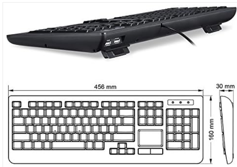
Image: The side of the keyboard displaying the two built-in USB 2.0 ports for connecting peripherals.