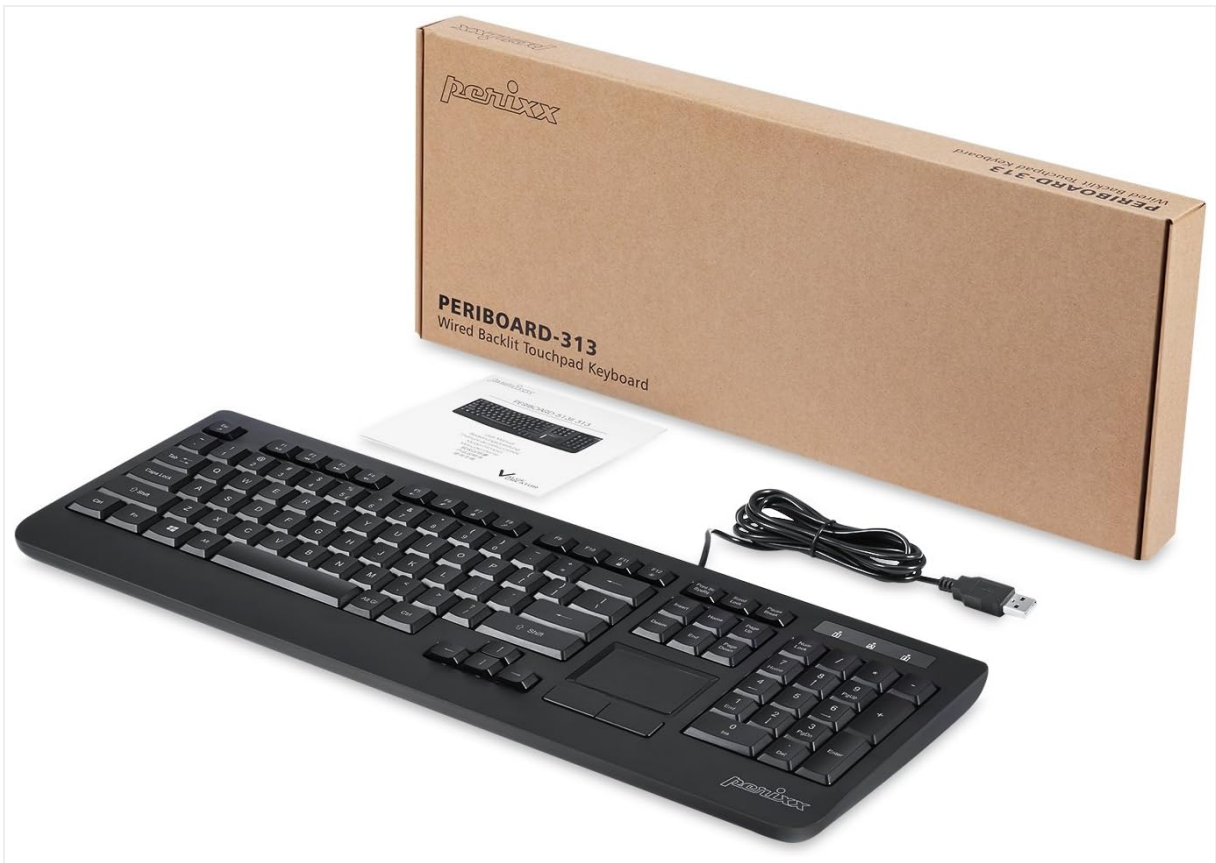
Image: The Perixx PERIBOARD-313 keyboard, its USB cable, and the user manual shown next to the product packaging.