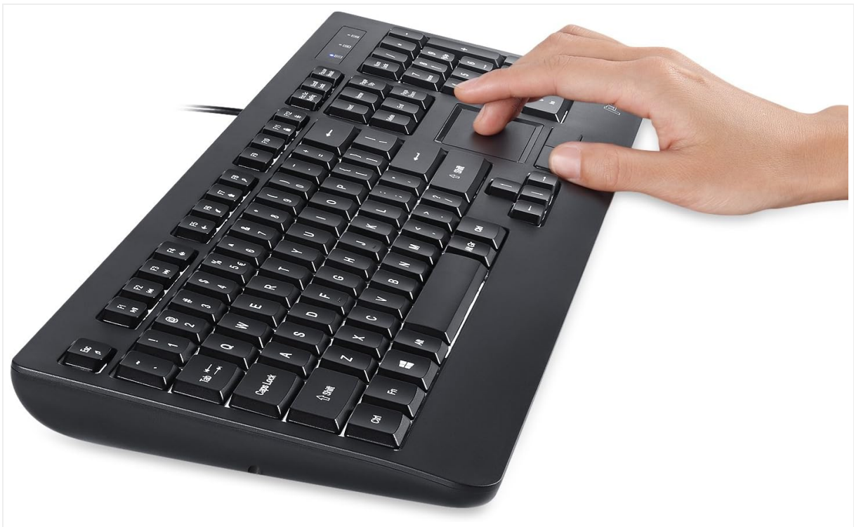
Image: A user's hand interacting with the touchpad for cursor control.