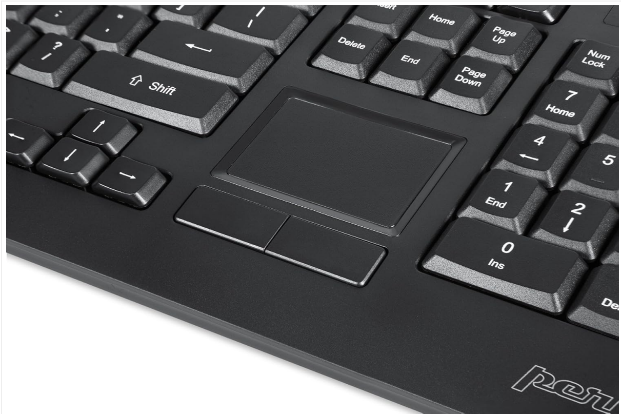
Image: A close-up of the integrated touchpad, highlighting its surface and the two dedicated click buttons.