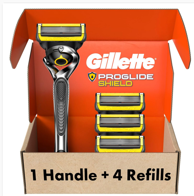
Image: The Gillette ProGlide Shield razor handle and four blade refills packaged in a box, highlighting the product