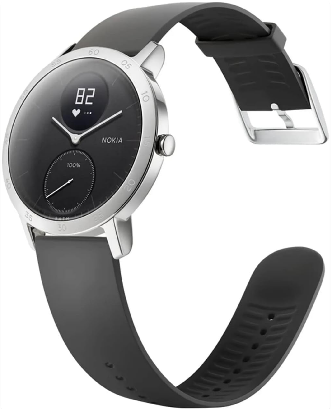
Figure 1: Withings Steel HR Hybrid Smartwatch