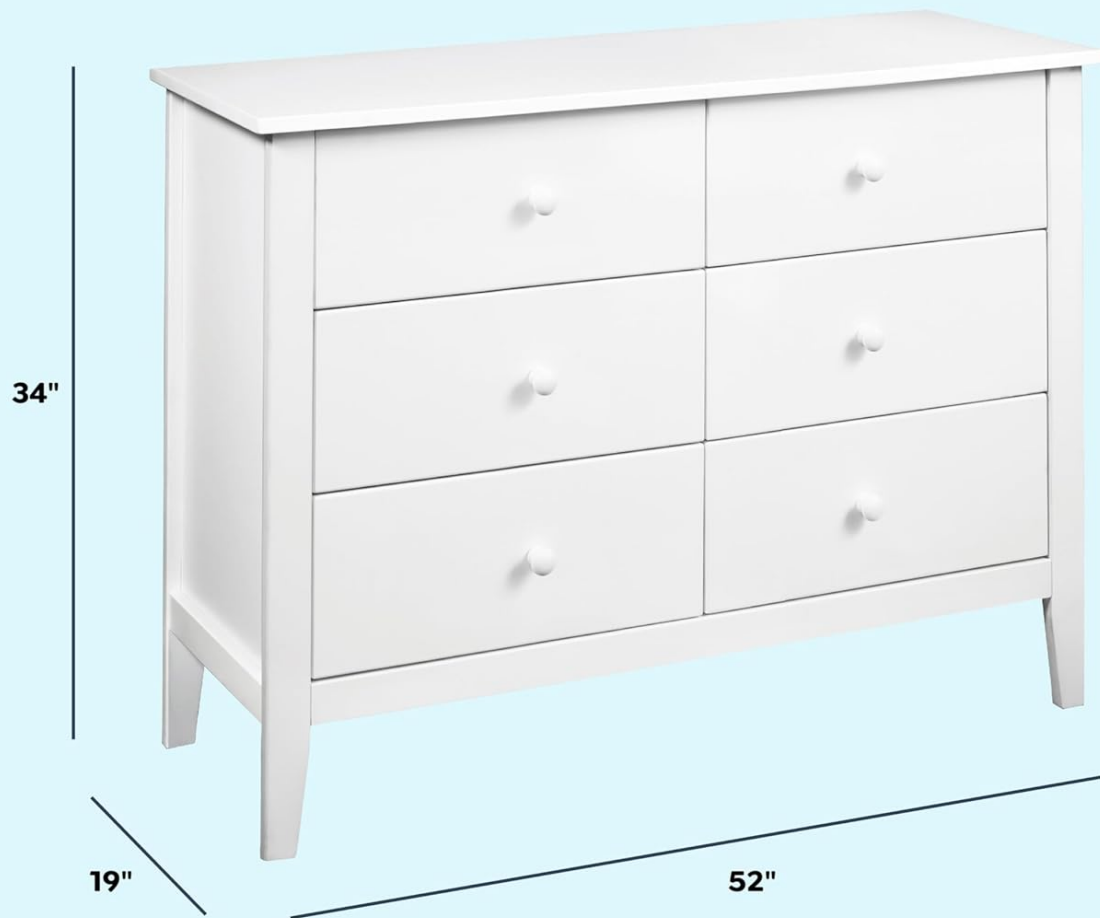
Figure 2: Side view illustrating the dresser dimensions (19"D x 52"W x 34"H).