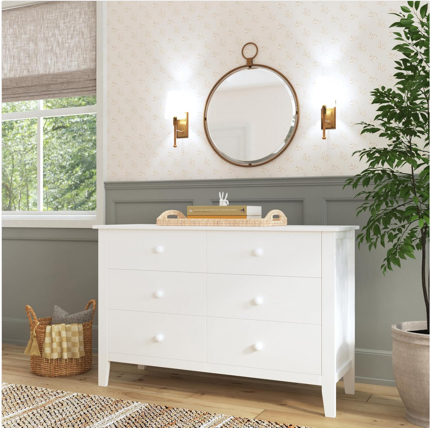
Figure 1: Front view of the assembled Morgan 6-Drawer Dresser.