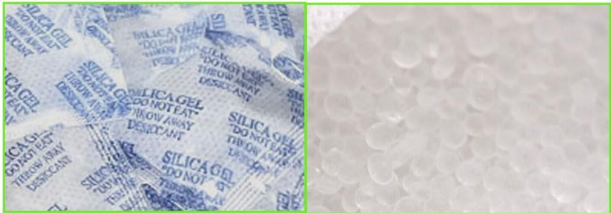
Image 3.1: Detailed view of the packet material and the transparent silica gel beads, highlighting their quality and composition.