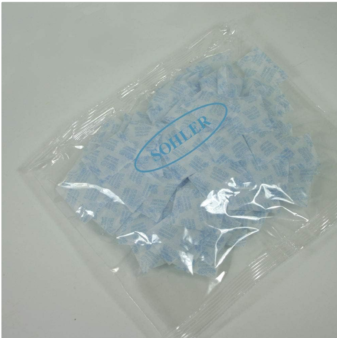
Image 3.2: Sohler silica gel packets packaged in a clear bag, displaying the brand logo.