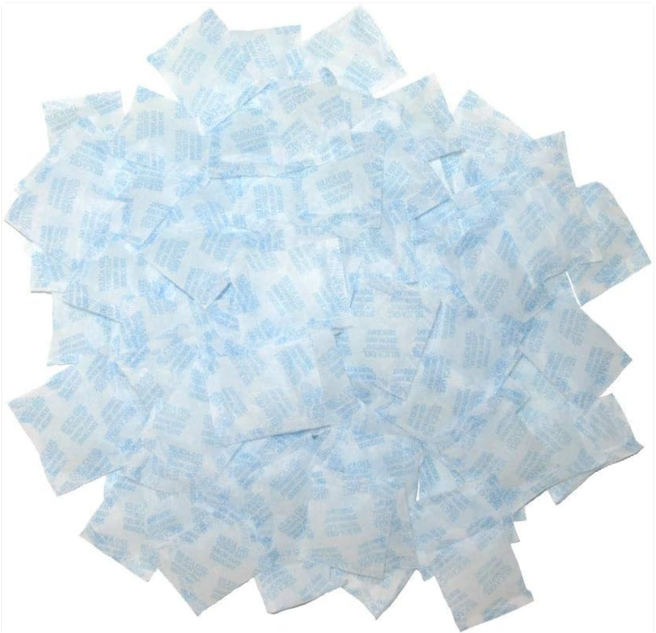
Image 1.2: Sohler Premium Silica Gel Desiccant Packs. Each packet is small, white, and contains blue text indicating "SILICA GEL DO NOT EAT THROW AWAY DESICCANT".