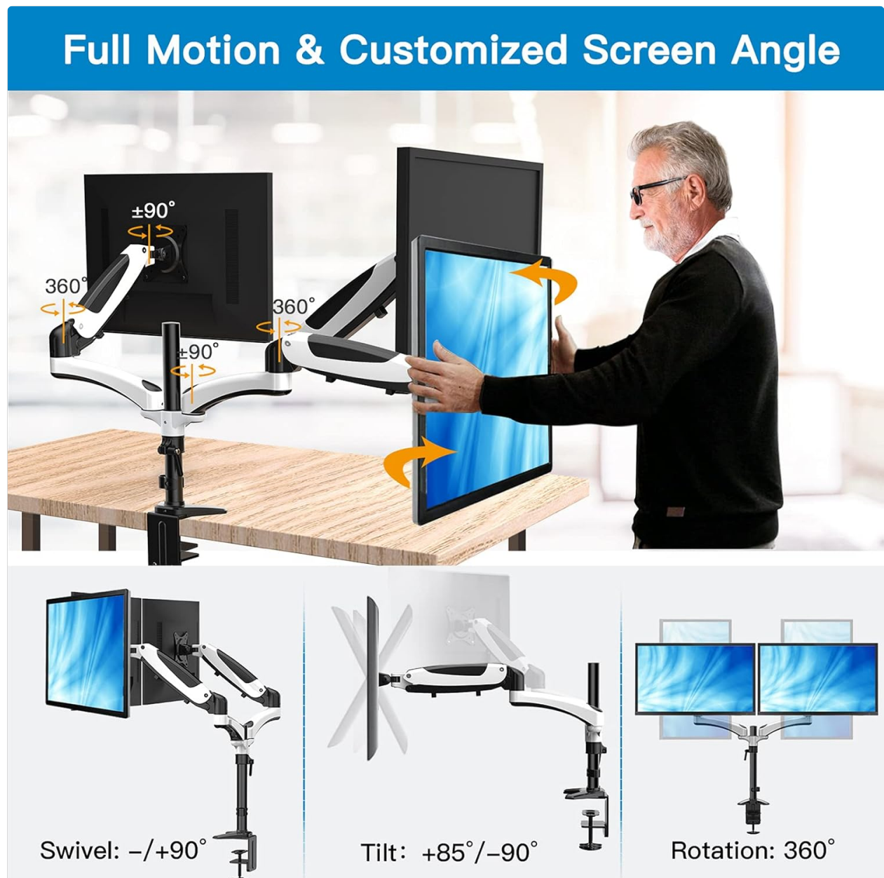
Image Description: This image illustrates the full motion capabilities of the monitor stand, including diagrams for 360^{\circ} swivel, +85^{\circ}/-90^{\circ} tilt, and 360^{\circ} rotation, allowing users to customize their screen angle for optimal viewing.

Each monitor can be tilted ( +85^{\circ}/-90^{\circ} ), swiveled ( \pm 90^{\circ} ), and rotated ( 360^{\circ} ) to achieve the perfect viewing angle. Simply grasp the edges of the monitor and adjust as needed. The 360^{\circ} rotation allows for easy switching between landscape and portrait modes.