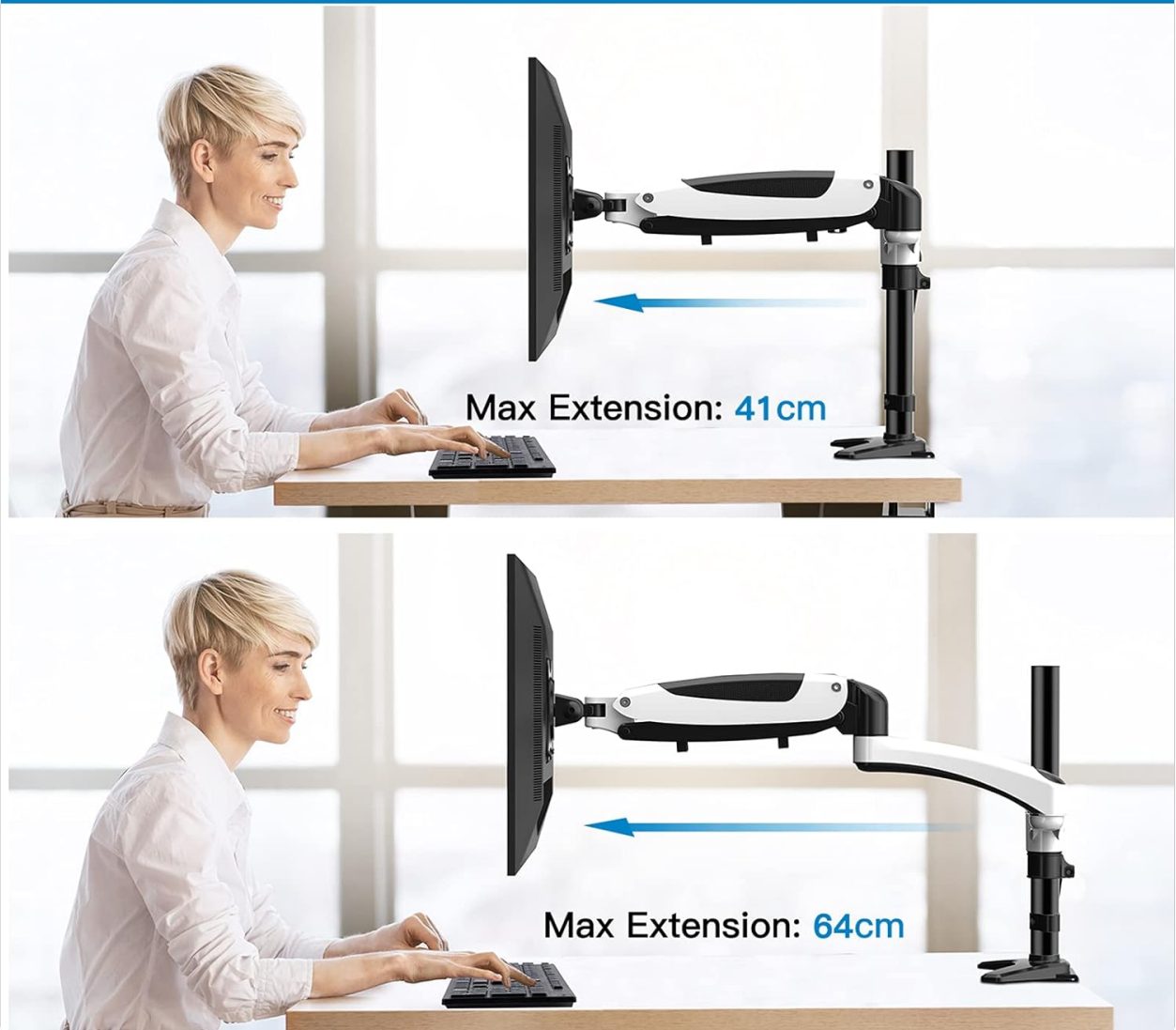
Image Description: This image demonstrates the flexible arm installation, showing two different configurations: one with a maximum extension of 41cm and another with a maximum extension of 64cm, suitable for various desktop setups.

Utilize the integrated cable management clips along the arms and pole to route and conceal monitor cables, maintaining a tidy and organized workspace.