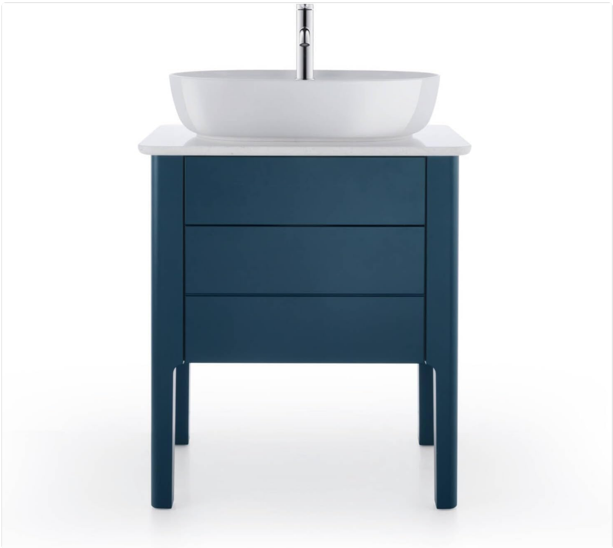
Image 4.2: Example of the Duravit Luv Washbowl installed on a vanity, demonstrating a finished setup.