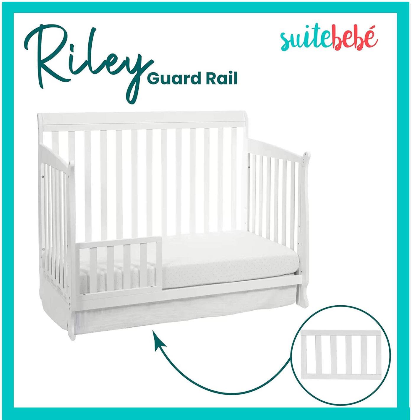
Image 2: The Riley Toddler Guard Rail shown installed on a Suite Bebe Riley 4-in-1 Convertible Crib in its toddler bed configuration. This illustrates how the guard rail integrates with the crib frame.