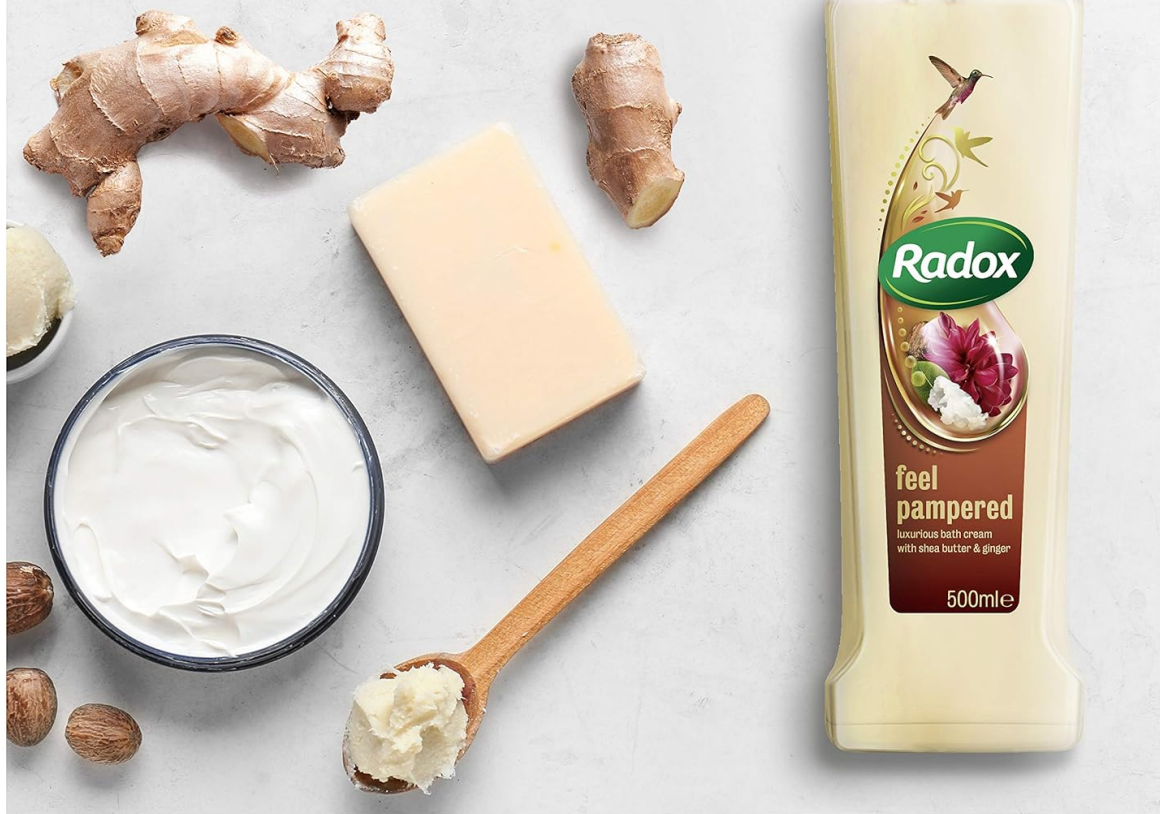
Image: The Radox Feel Pampered Bath Soak bottle alongside natural shea butter and ginger, highlighting key ingredients.