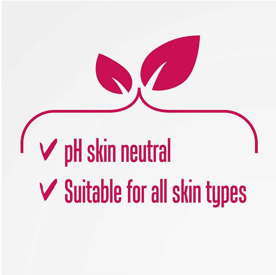
Image: A graphic highlighting the product's pH skin neutral property and suitability for all skin types.