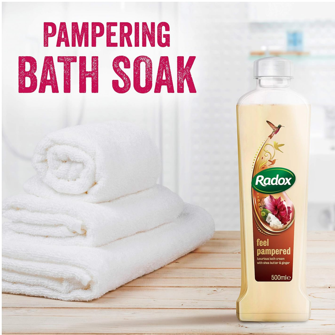
Image: Radox Feel Pampered Bath Soak bottle, highlighting its pampering qualities, positioned next to soft white towels.