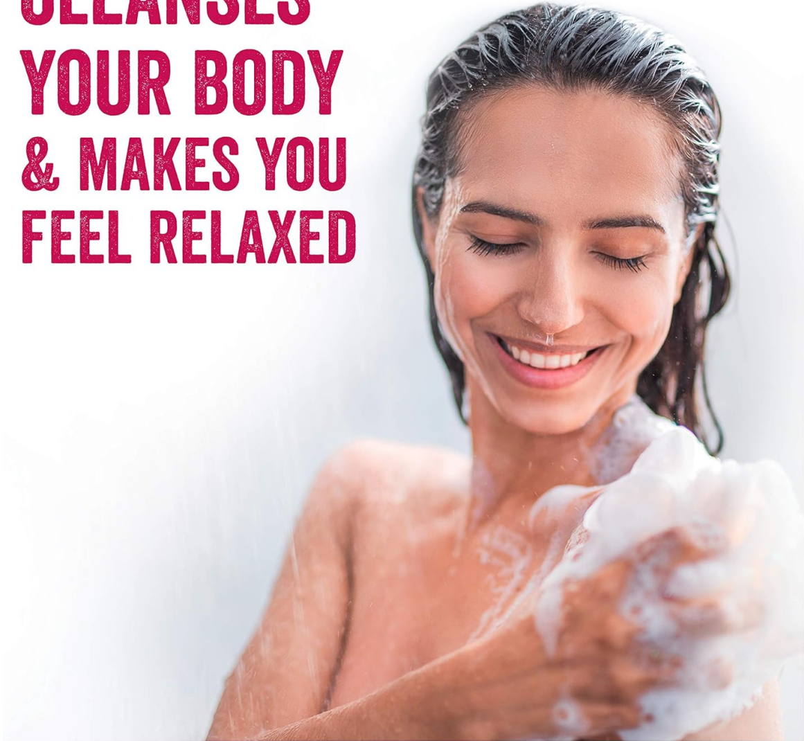
Image: A woman enjoying a bath or shower, illustrating the product's ability to cleanse and relax.

CLEANSSES YOUR BODY & MAKES YOU FEEL RELAXED