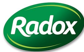
Image: A graphic emphasizing the product's 100% nature-inspired fragrance, featuring the Radox logo.