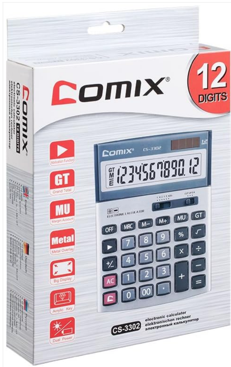
Figure 3.6: Retail packaging of the Comix CS-3302 Calculator, highlighting key features like 12 digits, dual power, and acrylic keys.