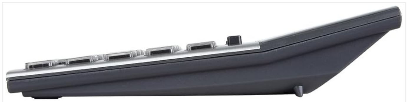
Figure 3.5: Side profile of the Comix CS-3302 Calculator, showing its slim design.