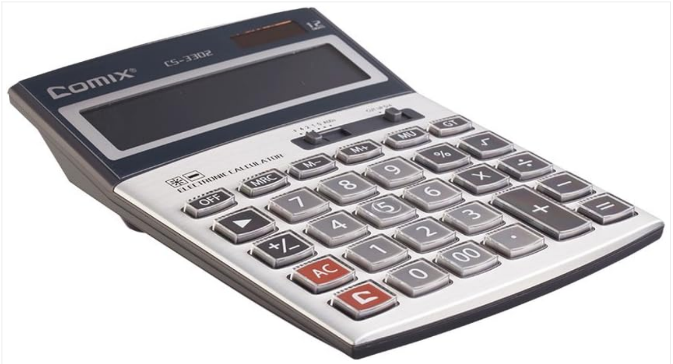
Figure 3.4: Angled view of the Comix CS-3302 Calculator, highlighting its sleek profile and key layout.