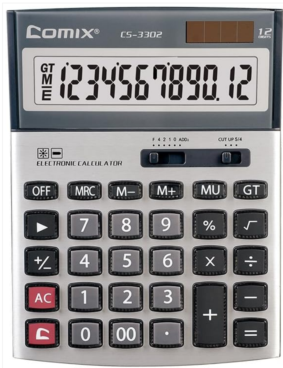
Figure 3.1: Front view of the Comix CS-3302 Desktop Calculator, showing the large LCD display and full keypad.