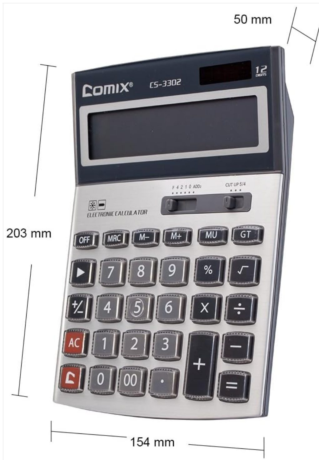
Figure 3.3: Dimensions of the Comix CS-3302 Calculator, showing its compact and ergonomic design.