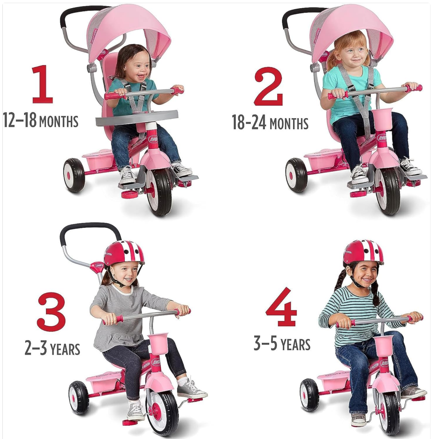
Image: Visual representation of the four stages of the Radio Flyer 4-in-1 Stroll 'N Trike, illustrating its adaptability.