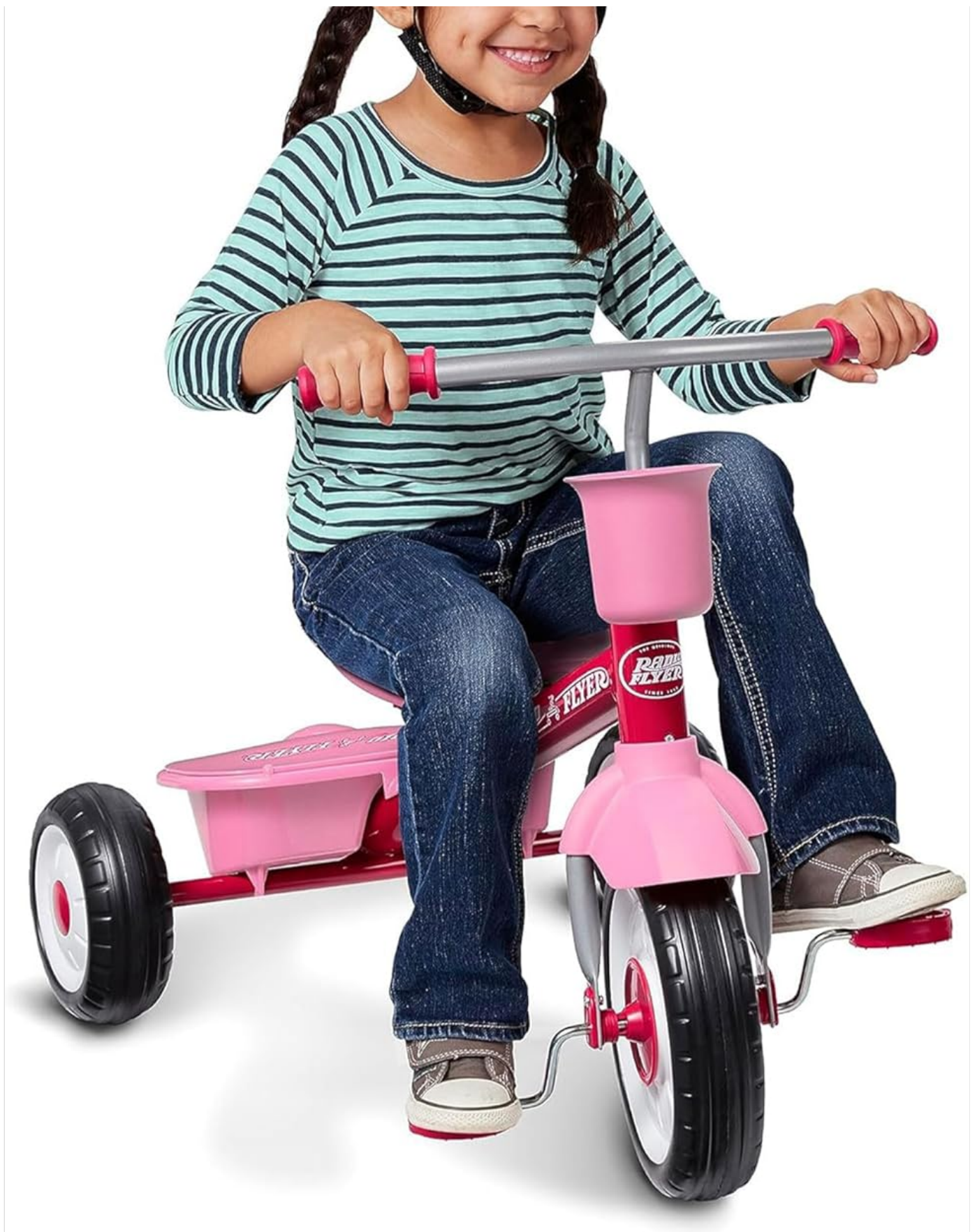
Image: A child confidently riding the trike in its classic tricycle configuration.