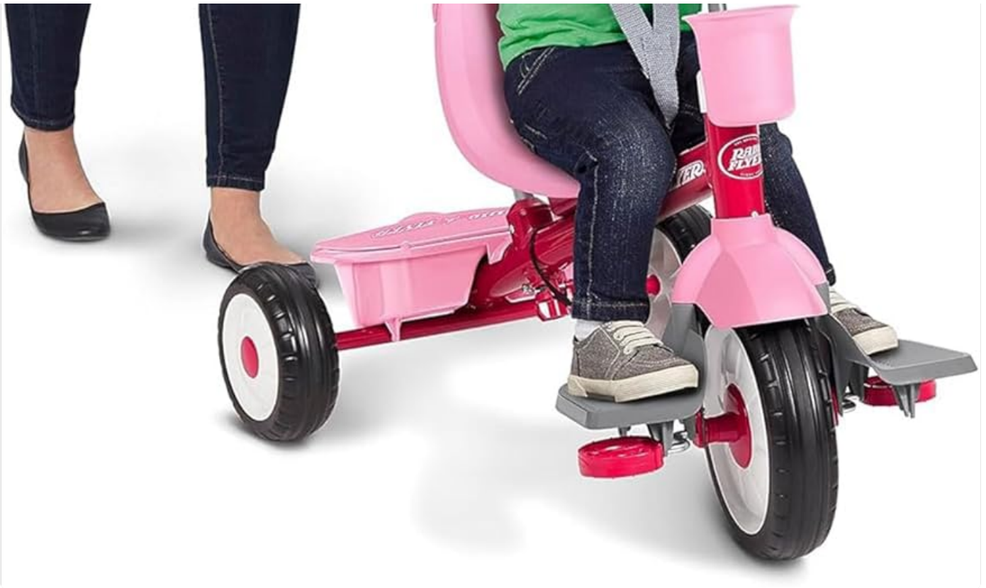
Image: A toddler in the steering trike mode, with the parent push handle engaged.