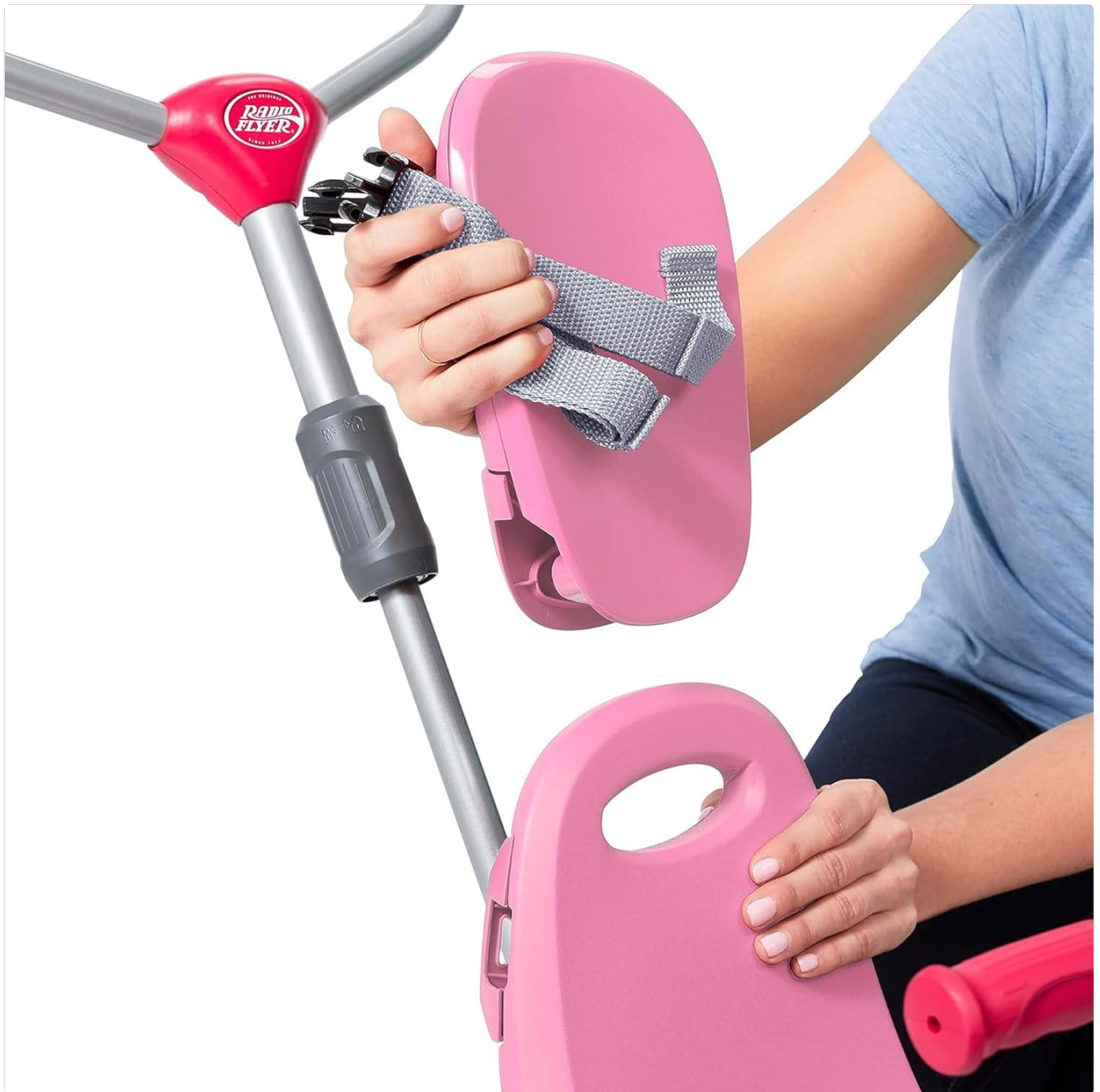
Image: Demonstration of removing the footrest for transitioning modes.