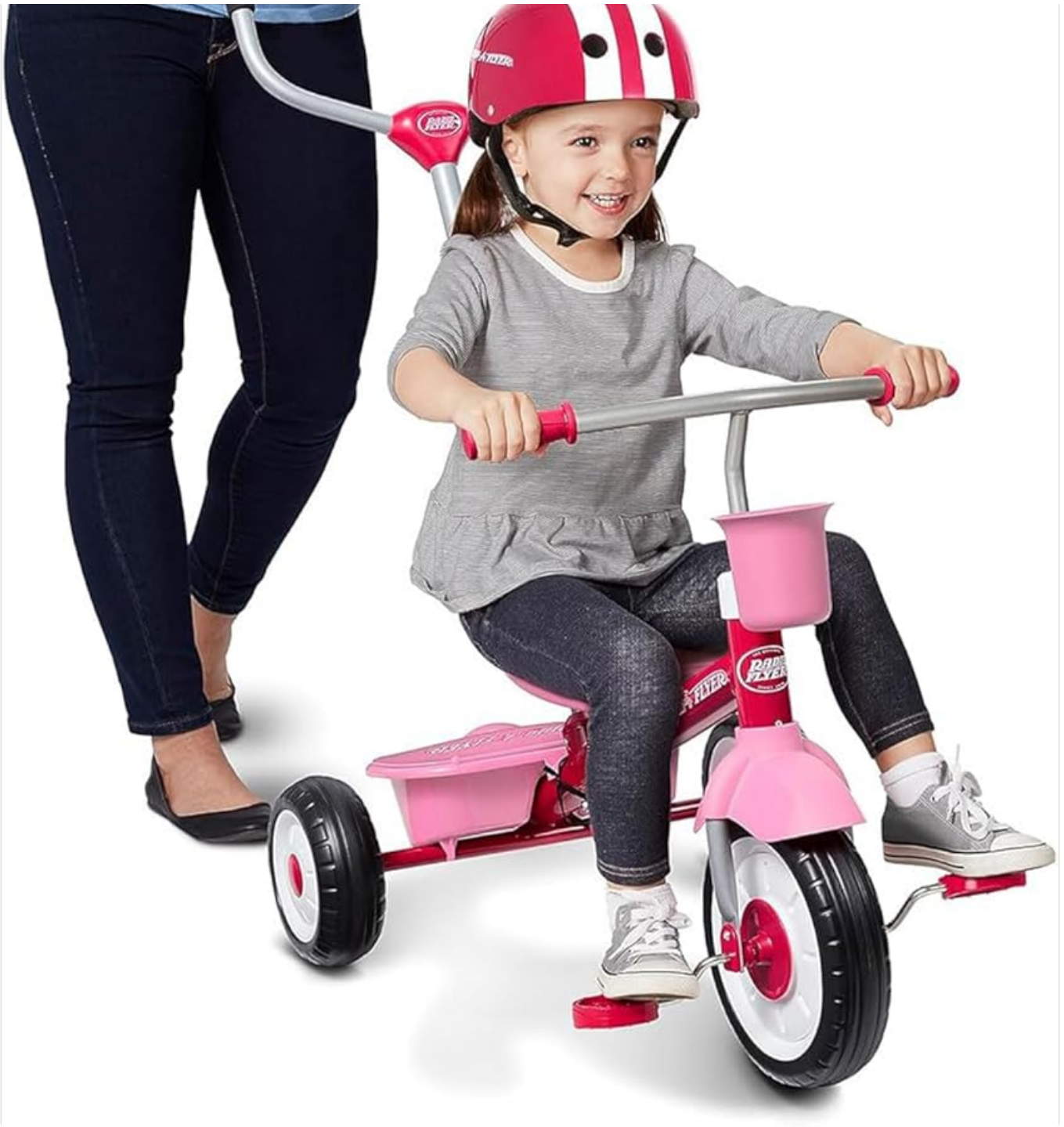
Image: A child learning to ride the trike, with the parent providing support via the push handle.