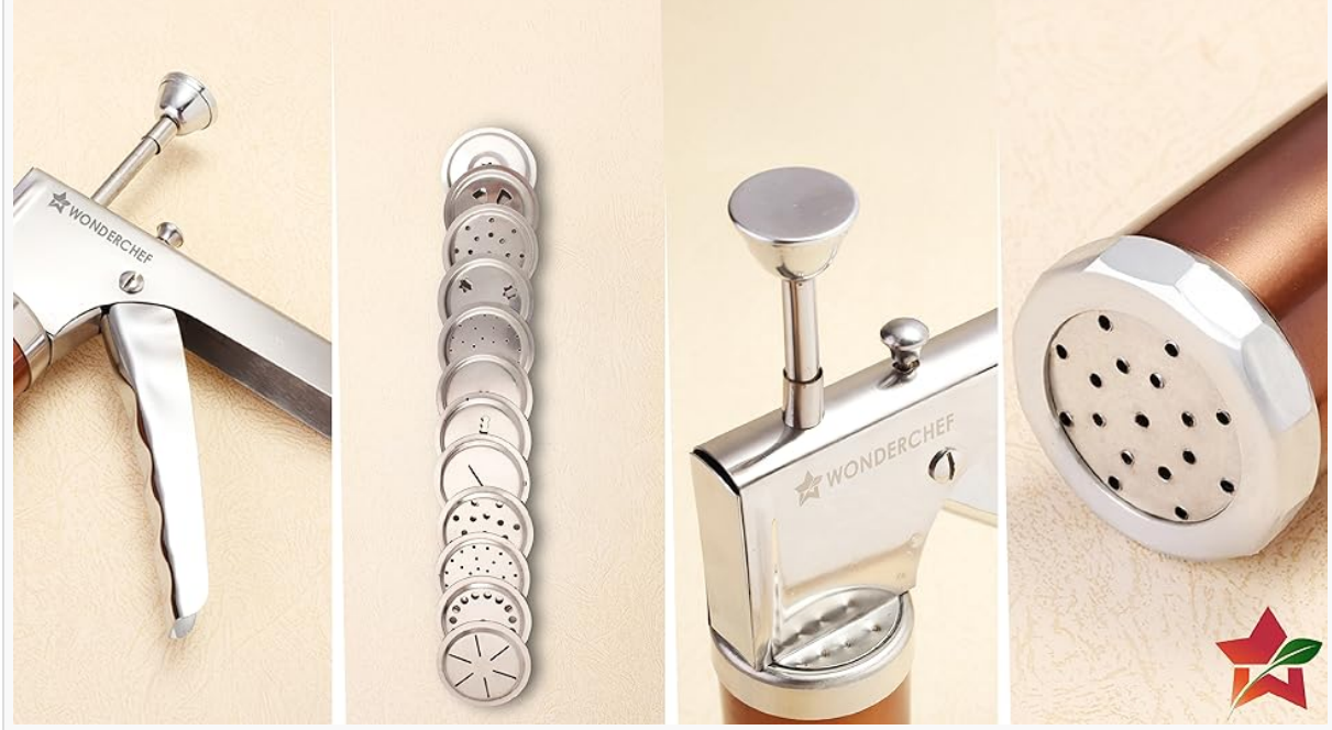
Figure 2: The 12 varied shaped jalis included for different types of snacks.