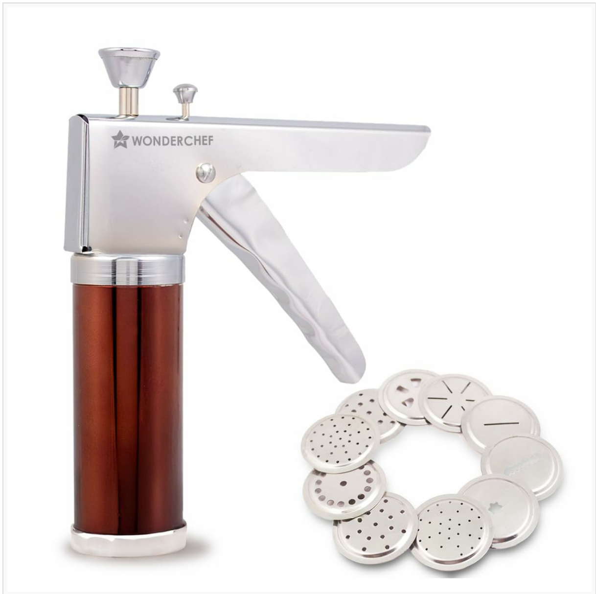
Figure 1: Wonderchef Snacks Maker with its components.