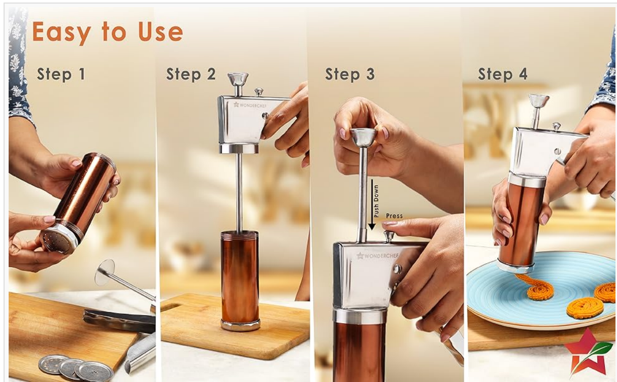
Figure 4: The snack maker in action, creating various shapes.

Your browser does not support the video tag. Please update your browser to view this content.