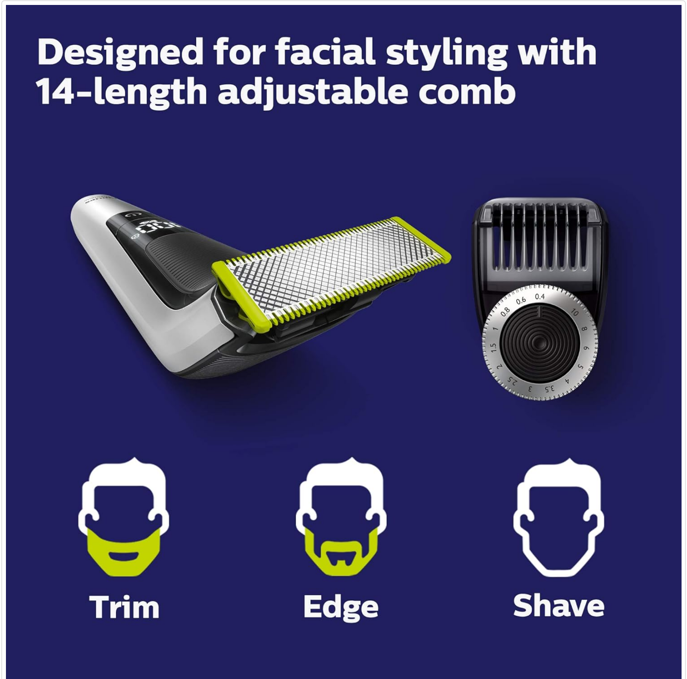
Figure 5: The OneBlade Pro's versatility for trimming, edging, and shaving.

The OneBlade Pro is designed for trimming, edging, and shaving. It can be used wet or dry, with or without foam, and even in the shower.