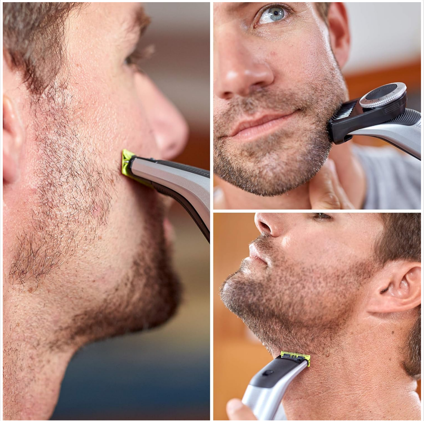
Figure 6: Demonstrating the trimming function with the adjustable comb.