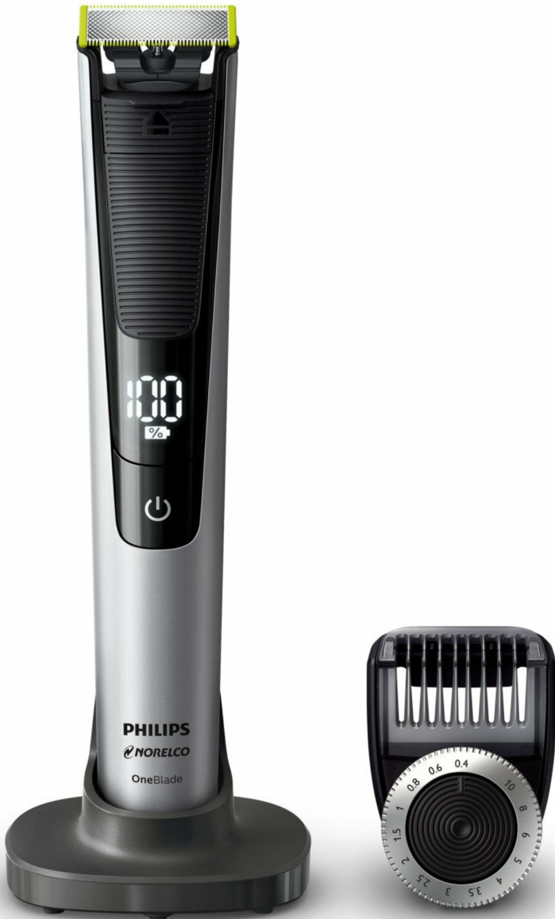
Figure 1: Philips Norelco OneBlade Pro QP6520/70 device, charging stand, and adjustable comb.