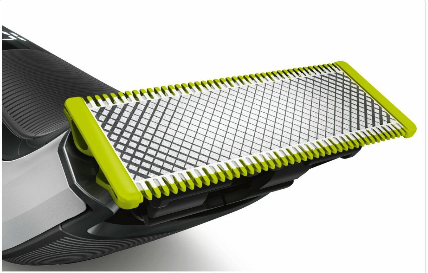
Figure 2: Close-up view of the OneBlade blade, highlighting the fast-moving cutter and glide coating with rounded tips for skin protection.