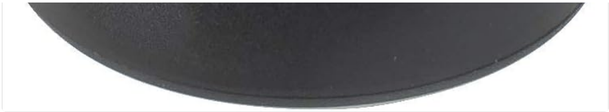
Image: The Alligator A670 mobile phone securely placed in its desktop charging station, ready for use.