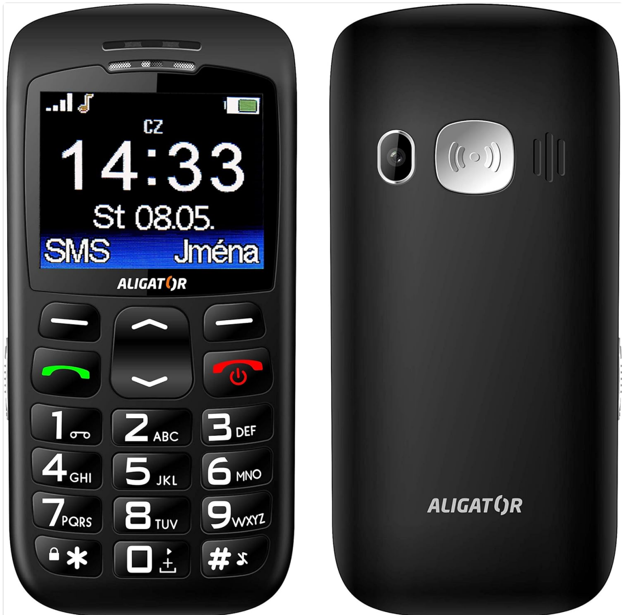
Image: Front and back views of the Aligator A670, showing the large keypad and the prominent SOS button on the rear.