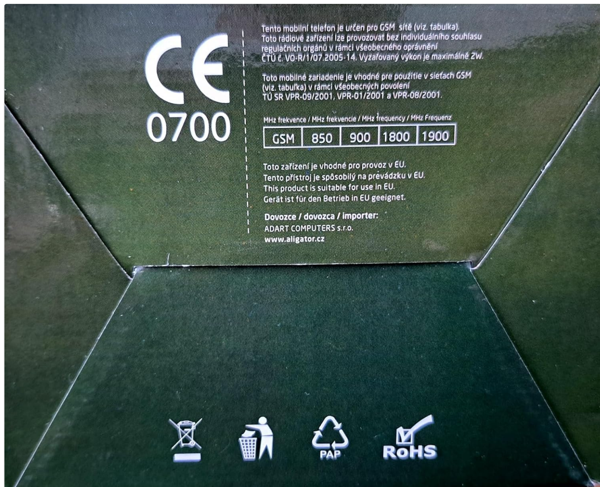
Image: The product packaging displaying regulatory markings (CE 0700) and supported GSM frequencies (850, 900, 1800, 1900 MHz).