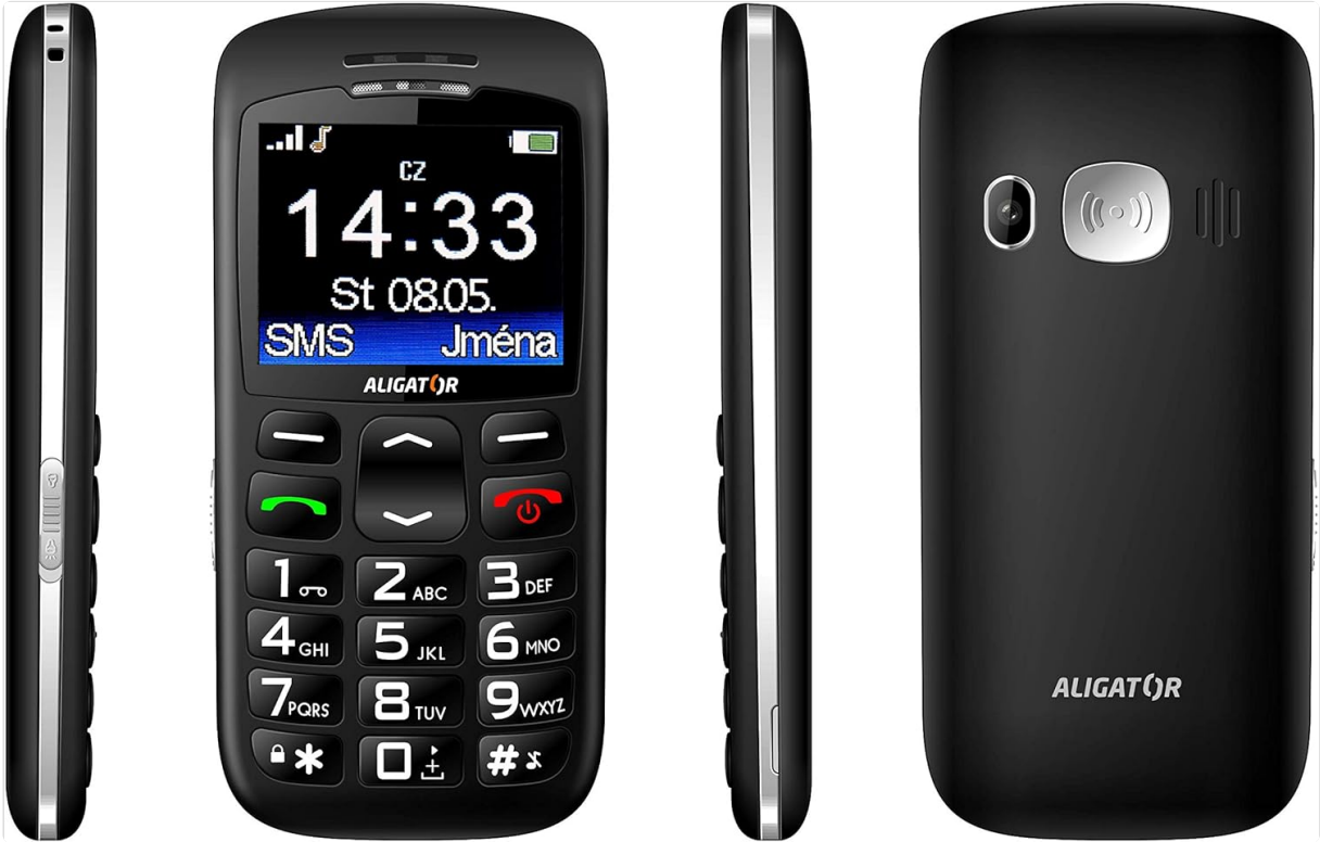
Image: Multiple views of the Aligator A670, illustrating its compact design and key features from different angles.