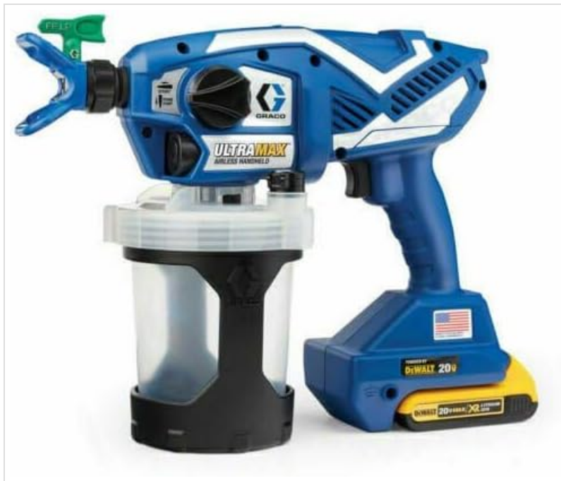
Figure 3.3: A DEWALT 20V-Max Compact Lithium Ion Battery, which powers the Graco Ultra Max sprayer.