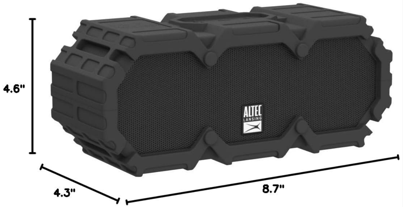
Figure 5: Detailed dimensions of the Altec Lansing LifeJacket speaker, illustrating its length, width, and height.