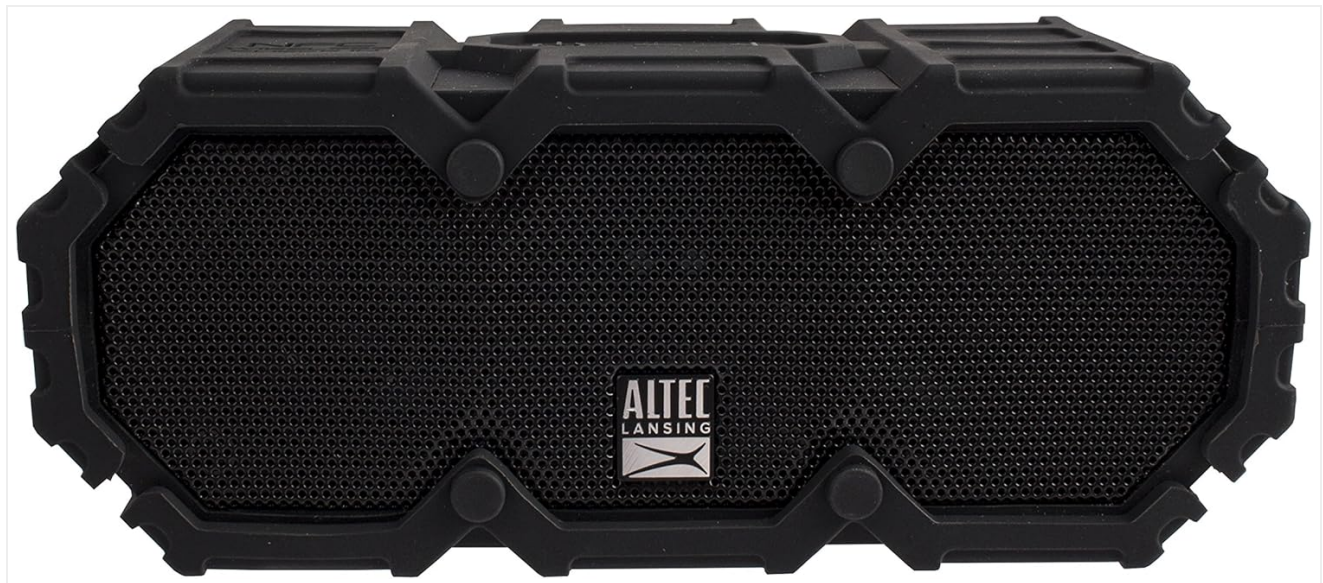
Figure 1: Front view of the Altec Lansing LifeJacket Bluetooth Speaker. The speaker features a rugged black exterior with a mesh grille, showcasing the Altec Lansing logo prominently.

The Altec Lansing LifeJacket Bluetooth Speaker is a robust and portable audio device, engineered for outdoor and active use. Key features include: