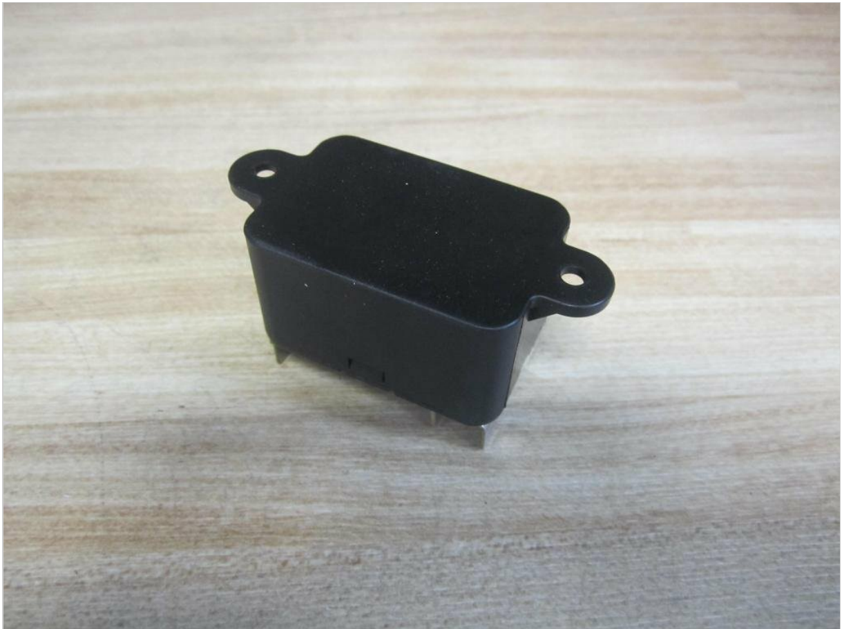
Figure 3: This image shows a side profile of the White-Rodgers RBM-184 Relay. It illustrates the compact black housing and the integrated mounting tabs, designed for secure installation.