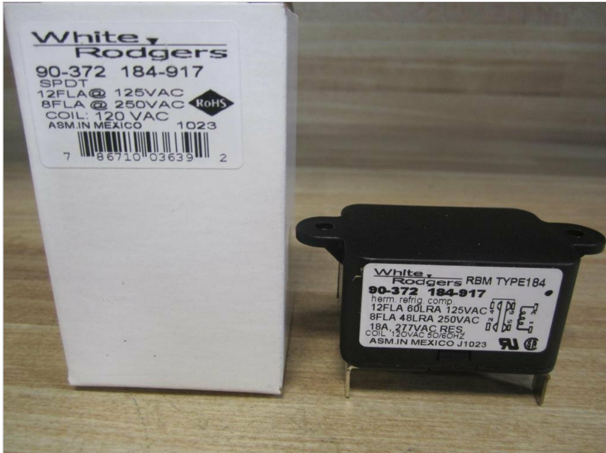
Figure 1: White-Rodgers RBM-184 Relay with its original packaging. The box displays model numbers 90-372 and 184-917, and UPC 0786710036392. The relay itself shows specifications such as 'COIL: 120 VAC' and contact ratings.