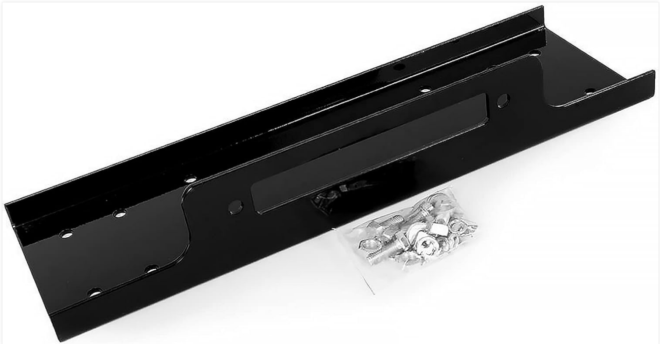
Figure 1: The WINCHMAX Compact Winch Mounting Plate, showcasing its robust black powder-coated finish and pre-drilled holes for winch and fairlead attachment.