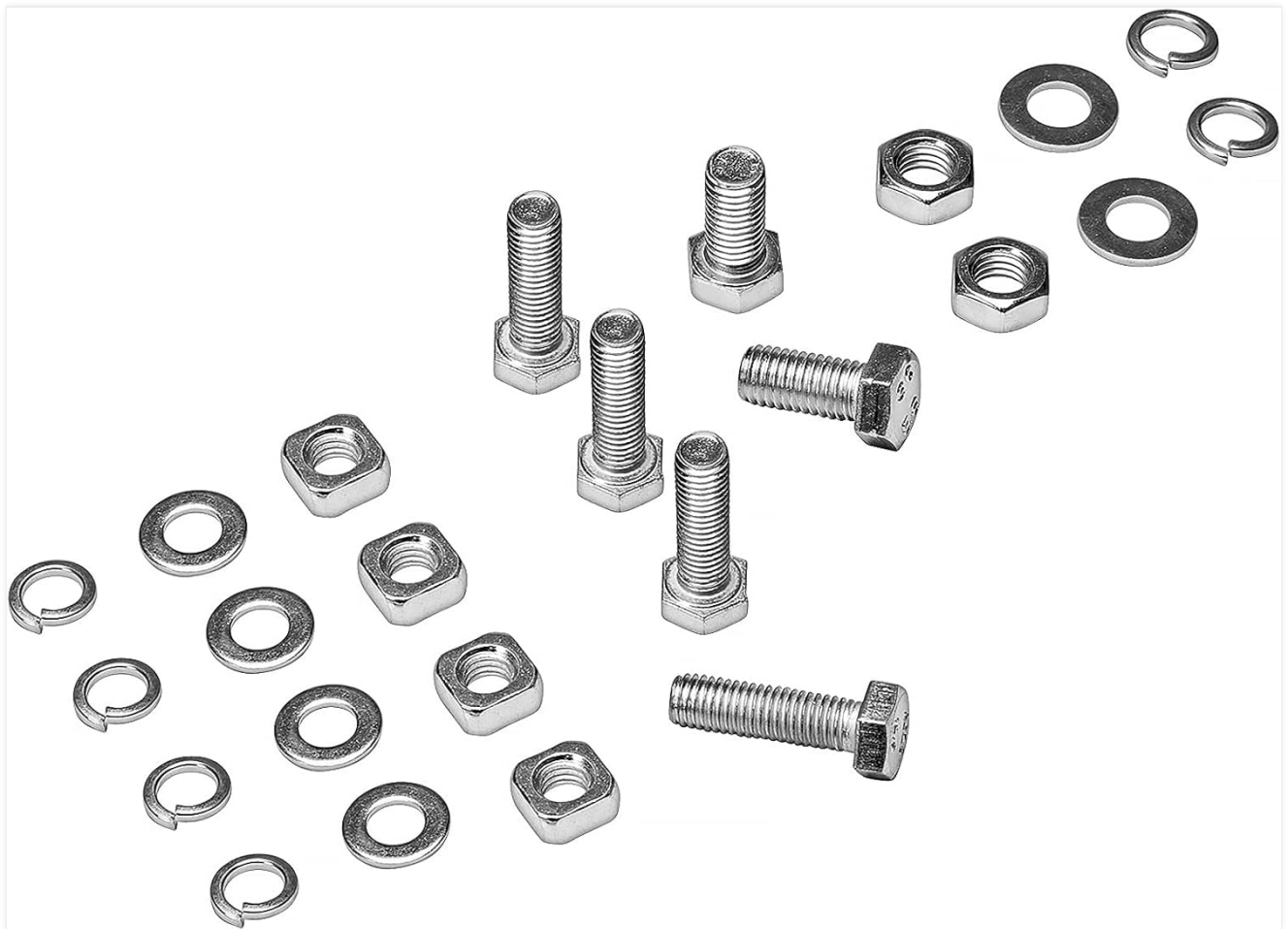
Figure 2: Included mounting hardware, consisting of various bolts, nuts, and washers necessary for securing the winch and fairlead to the plate.