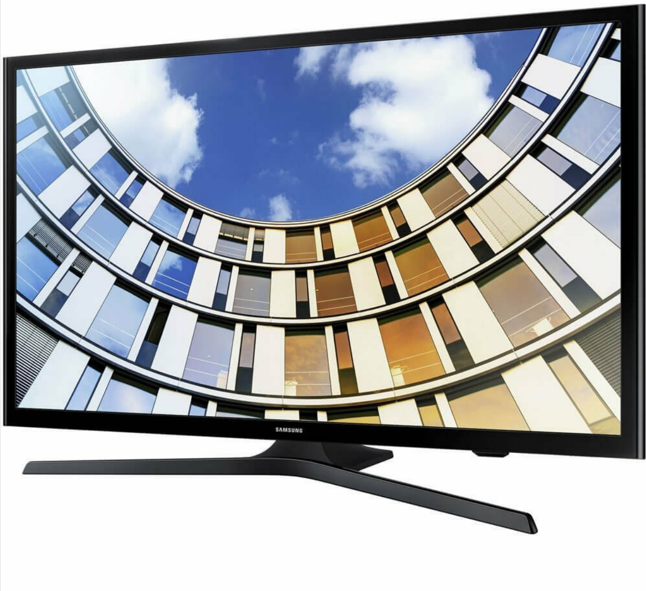
Figure 2.1: The Samsung UN50M5300A 50-Inch Smart LED TV with its stand.