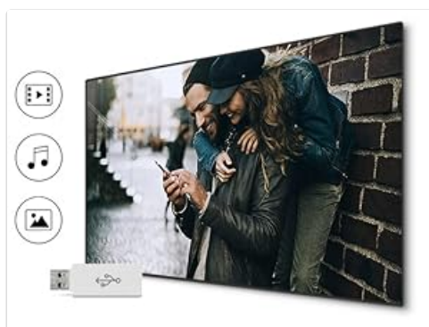
Figure 3.4: ConnectShare Movie allows media playback from a USB device.

Utilize the ConnectShare Movie feature by plugging a USB drive into the TV's USB port. This allows you to play movies, photos, and music directly from your USB storage device.