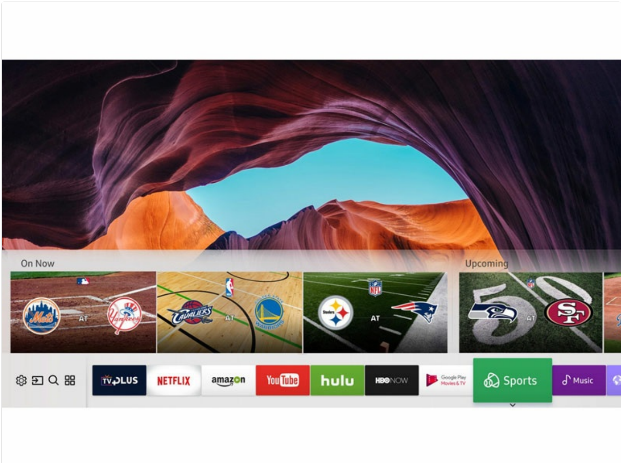
Figure 3.2: The Samsung Smart Hub provides access to various applications.

Access the Smart Hub to find your favorite streaming applications like Netflix, YouTube, Hulu, and Amazon Instant Video. The built-in Wi-Fi allows for seamless streaming and internet browsing.