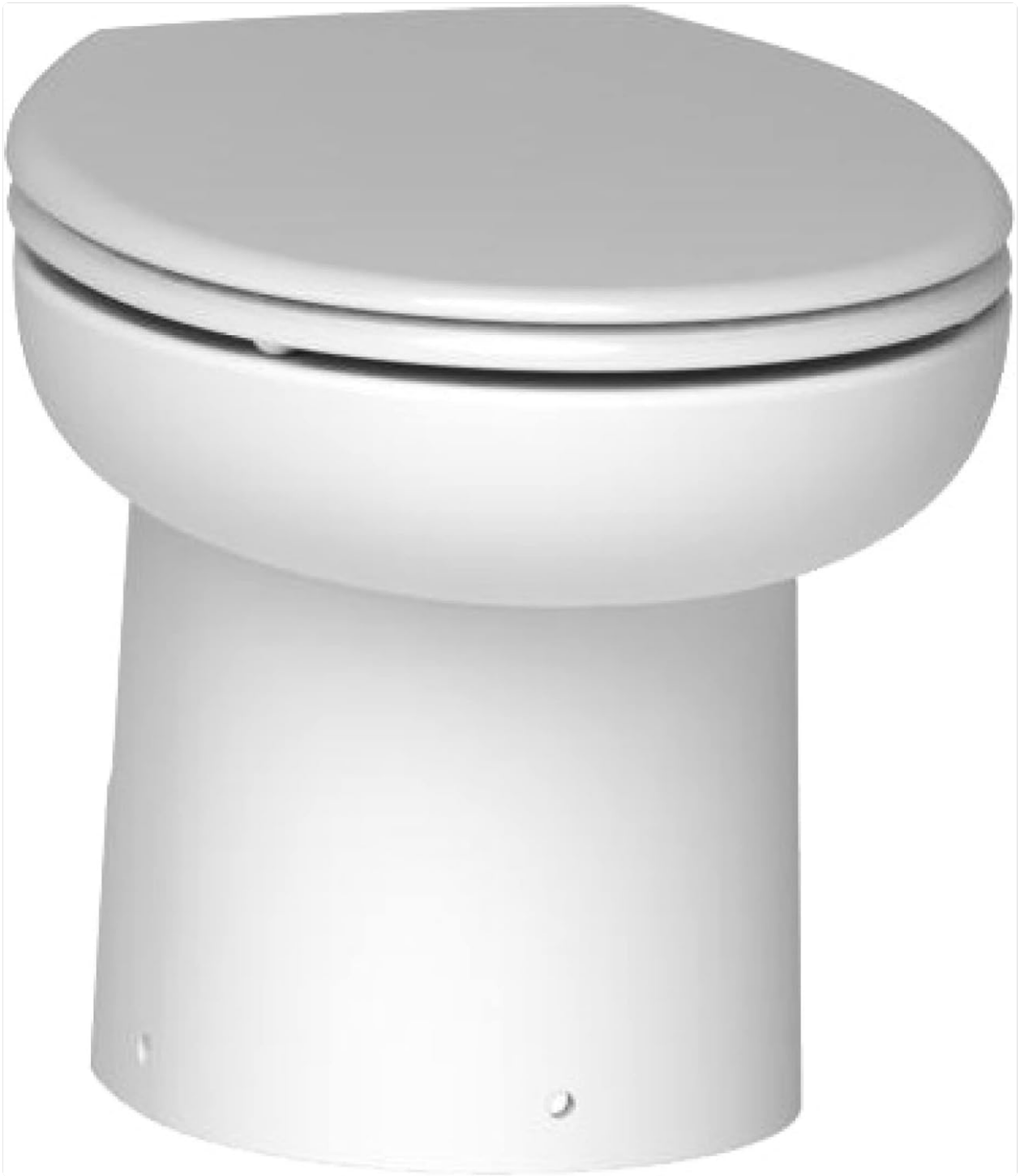
Image 1.1: Front view of the SANIFLO Sanimarin 31 Electric Marine Macerating Toilet.