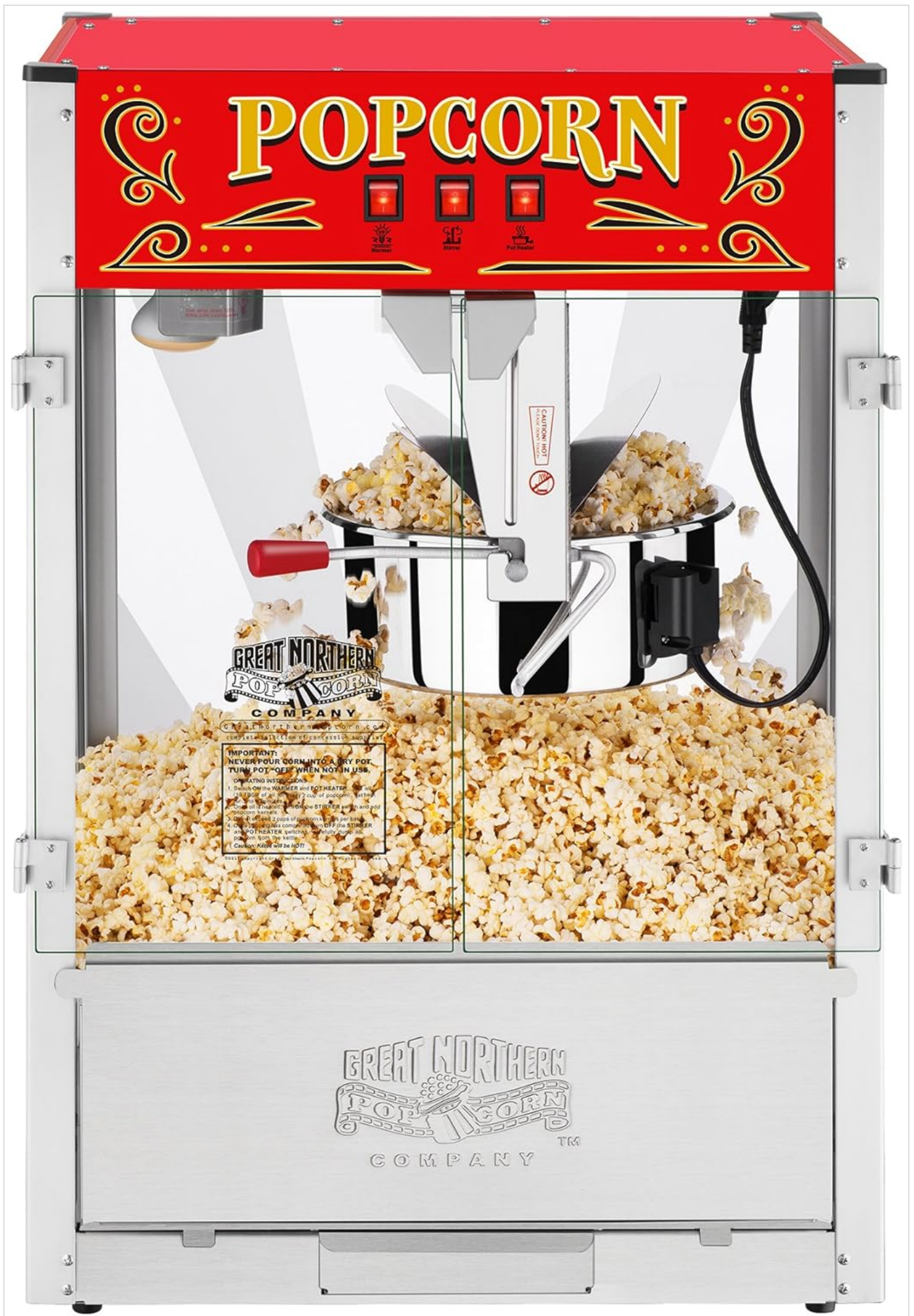
Image: The Great Northern Midway Marvel Popcorn Popper Machine filled with freshly popped popcorn, ready for serving.