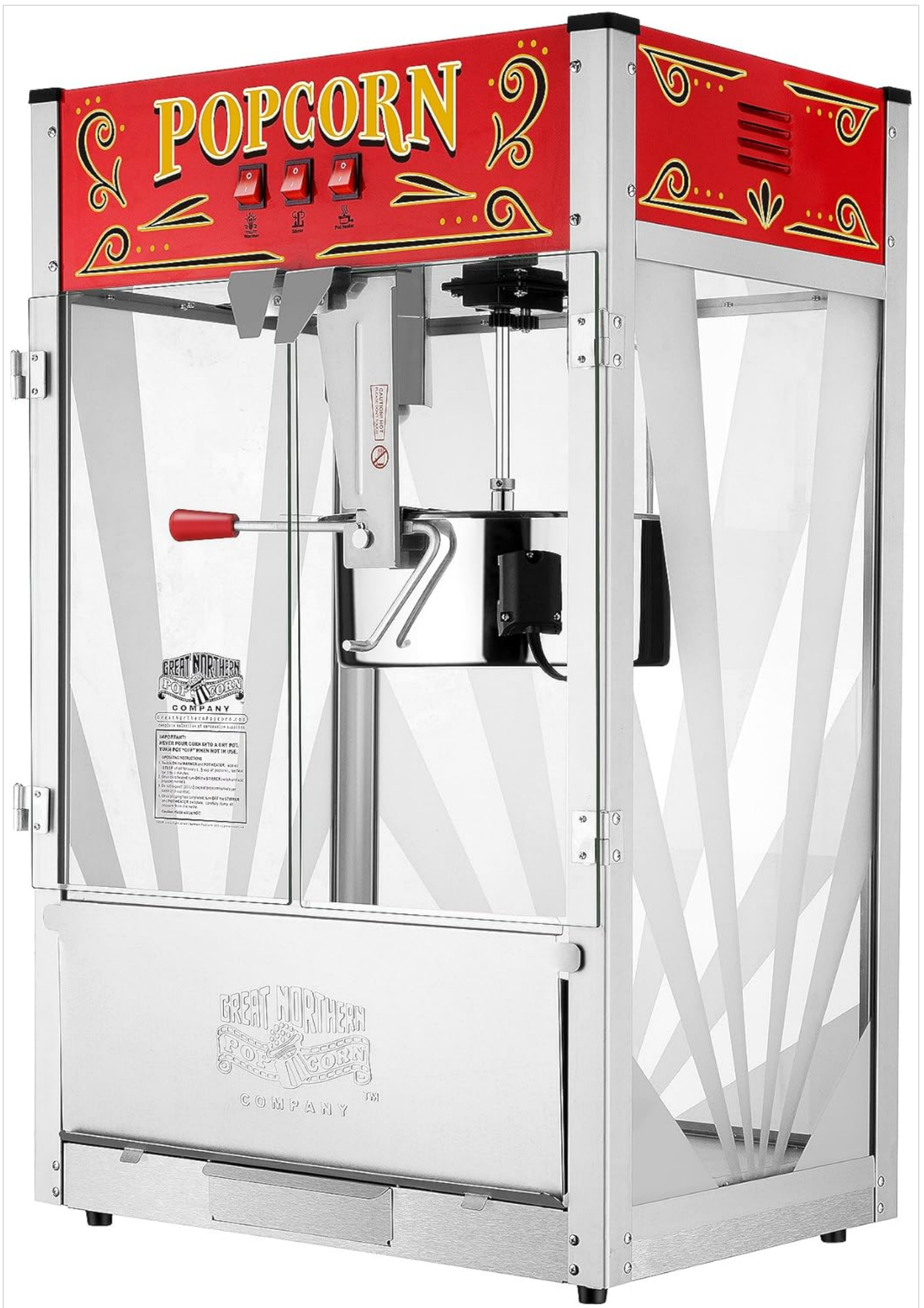
Image: The Great Northern Midway Marvel Commercial Quality Popcorn Popper Machine, showcasing its classic red and silver design.