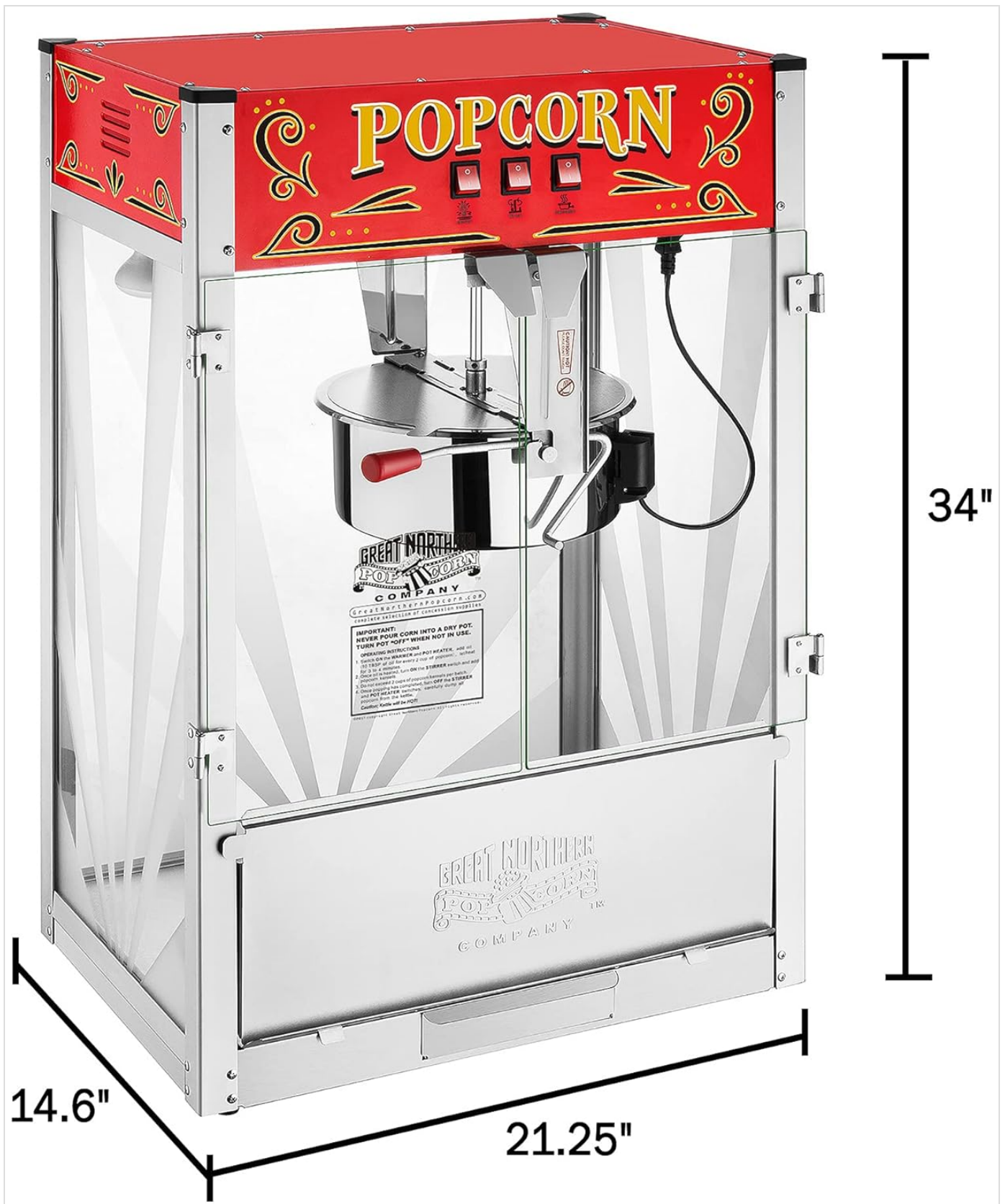
Image: The Great Northern Midway Marvel Popcorn Popper Machine with dimensions labeled, showing its height of 34 inches, width of 14.6 inches, and length of 21.25 inches.