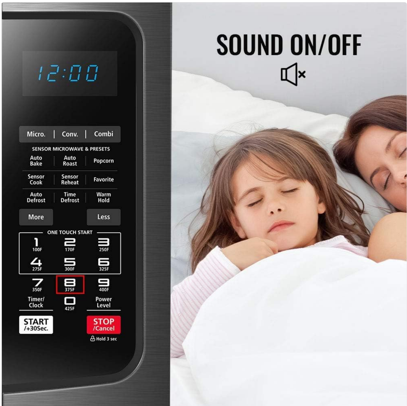
Close-up of the control panel, highlighting the mute function.