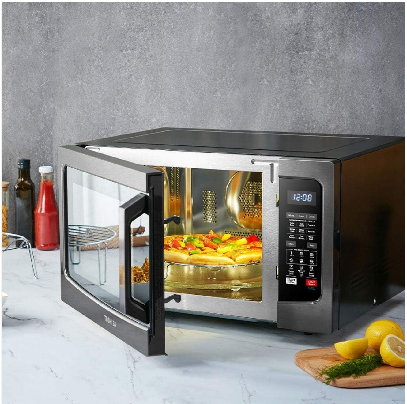
Interior view highlighting the convection function with food on a rack.