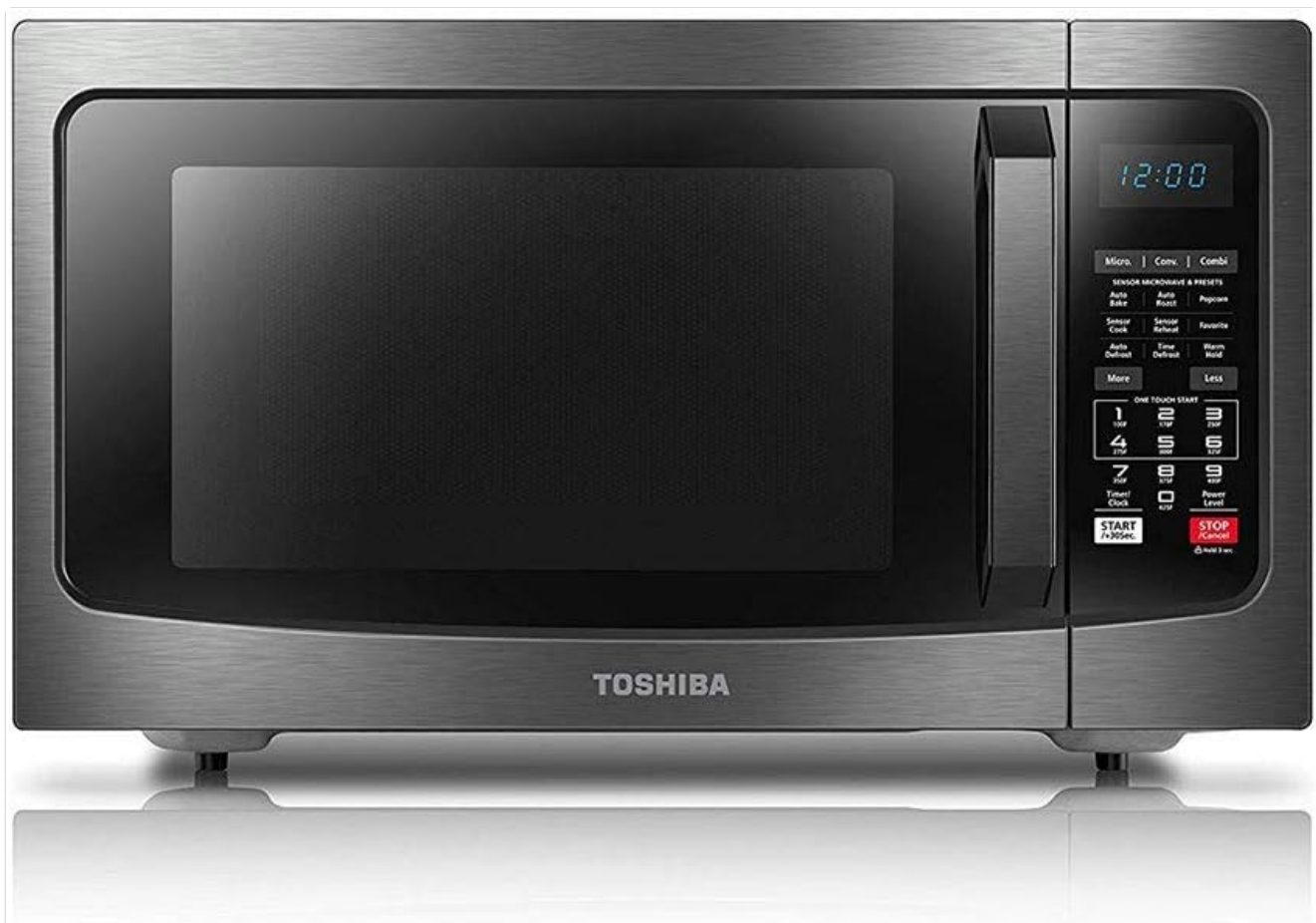
Front view of the Toshiba EC042A5C-BS Microwave Oven in black stainless steel.