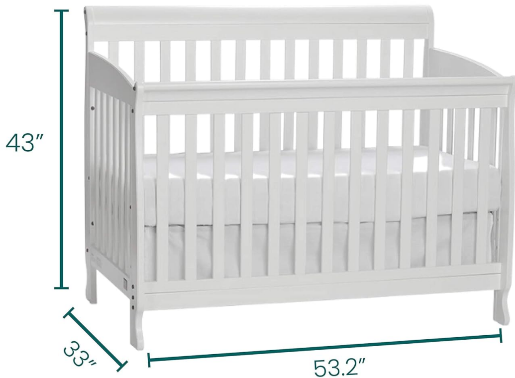
Key dimensions of the Suite Bebe Riley crib.