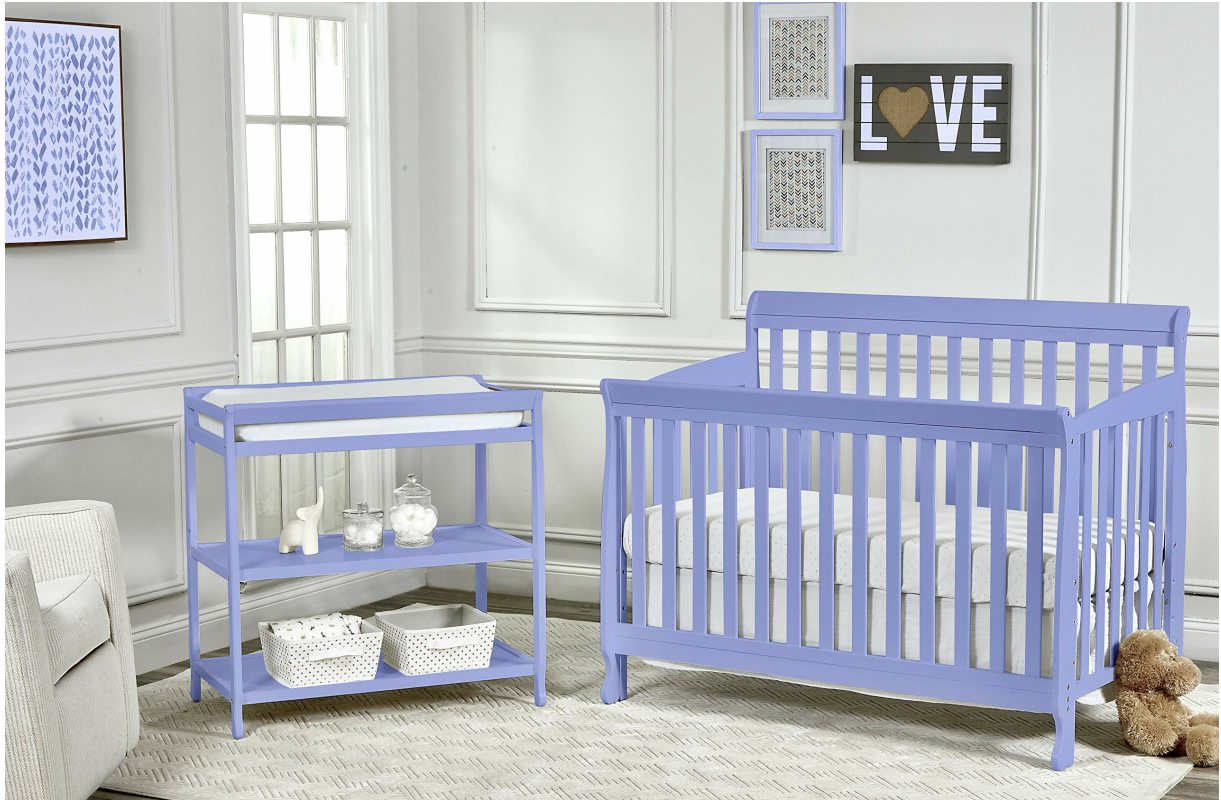
The Suite Bebe Riley crib, shown here in its crib configuration.