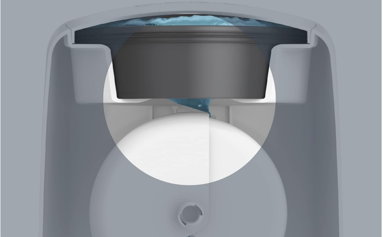
Image: Internal view of the Double Air-Tite clamps, a key feature for odor prevention.