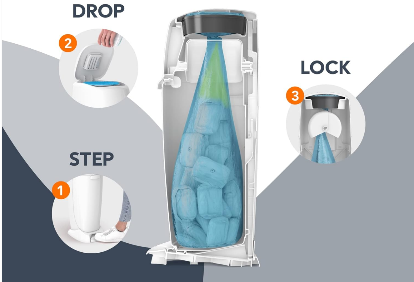
Image: Diaper Genie multi-layer refill film with odor-locking technology.