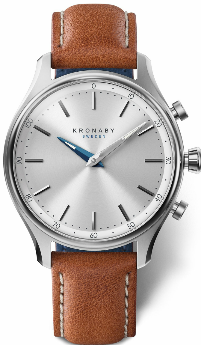
Figure 1: Front view of the Kronaby S0658/1 Hybrid Smartwatch, showcasing its silver dial, blue hands, and brown leather strap.