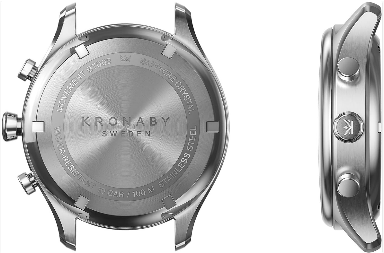
Figure 3: Back and side view of the Kronaby S0658/1 Hybrid Smartwatch, showing the engraved case back with 'KRONABY SWEDEN', 'SAPPHIRE CRYSTAL', 'WATER-RESISTANT 10 BAR / 100 M', and the watch's pushers.