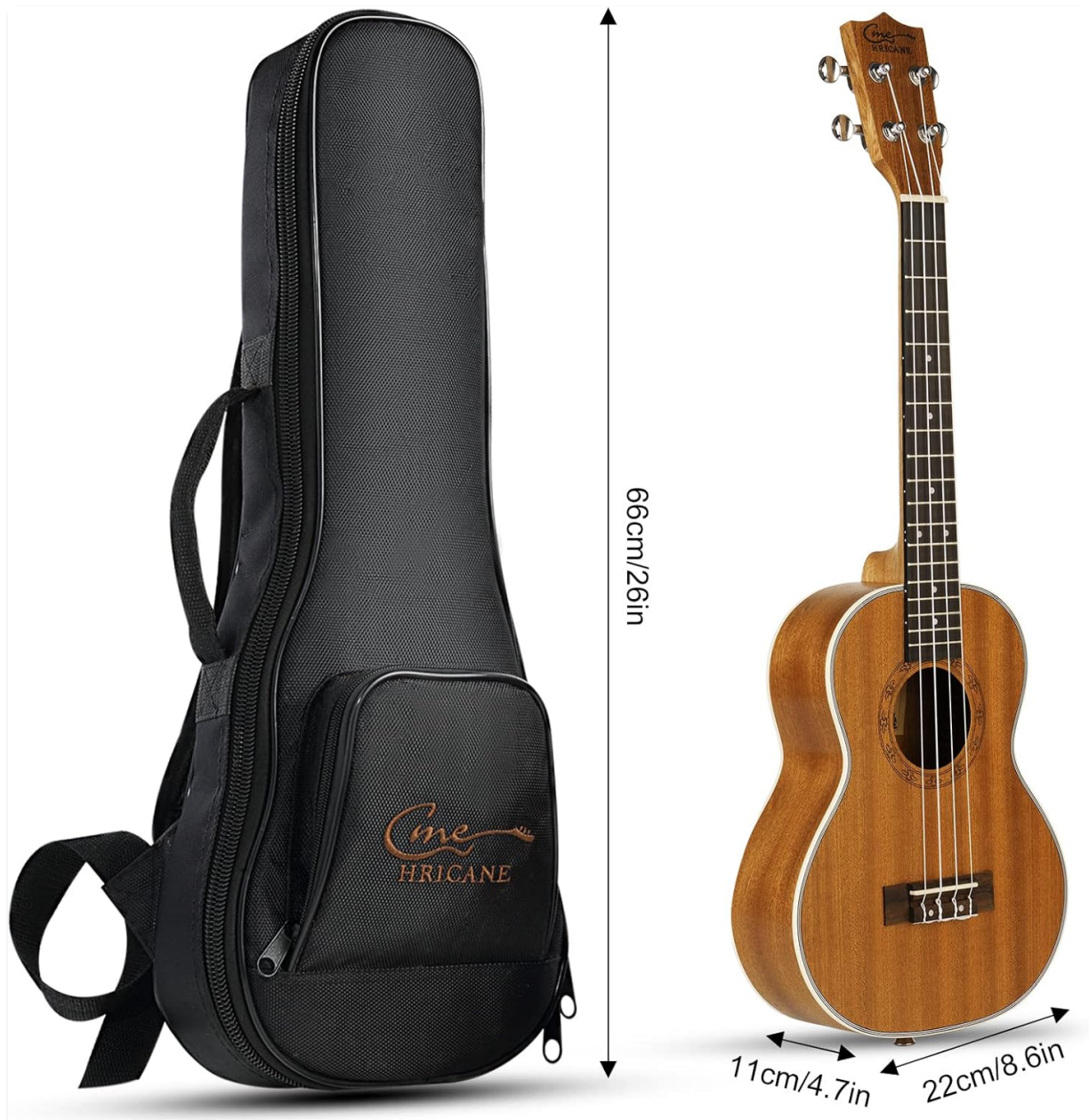
Figure 4: Dimensions of the Hricane Tenor Ukulele.