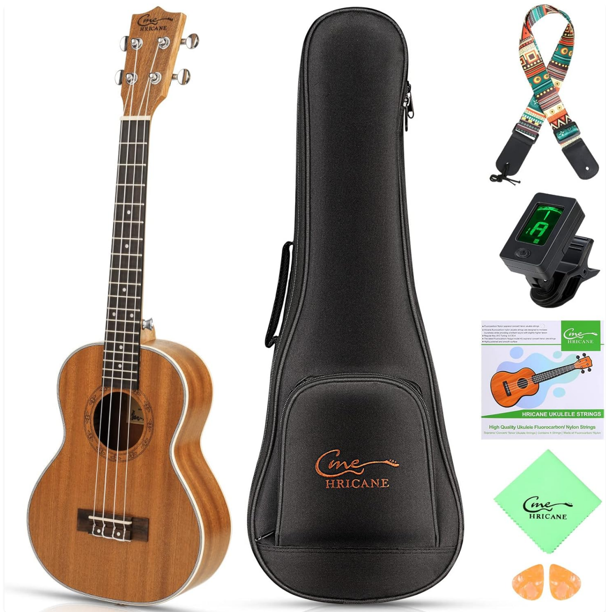
Figure 1: Hricane Tenor Ukulele (UKS-3) and included accessories.