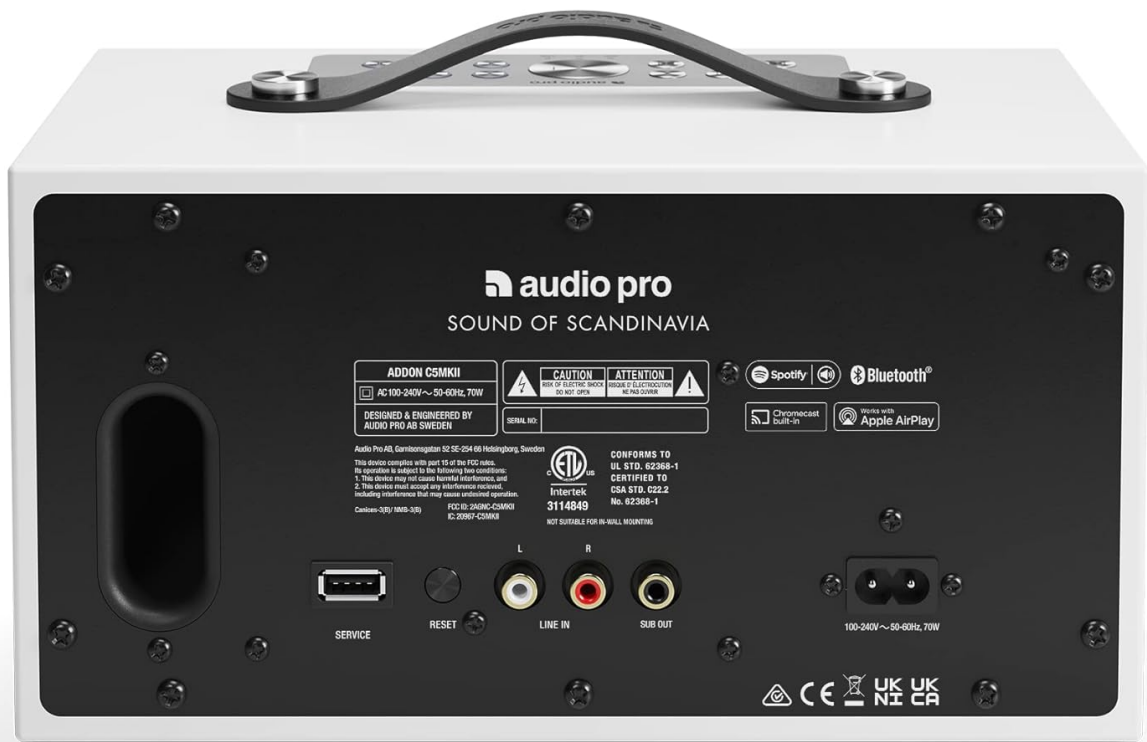
Figure 3: Rear view of the speaker, showing the power input, USB charging port, RCA Line In, and Sub Out connections.