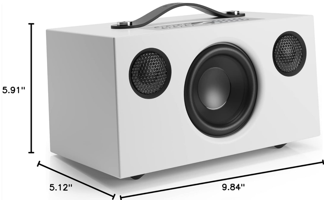
Figure 6: Dimensions of the Audio Pro C5 MK II speaker.