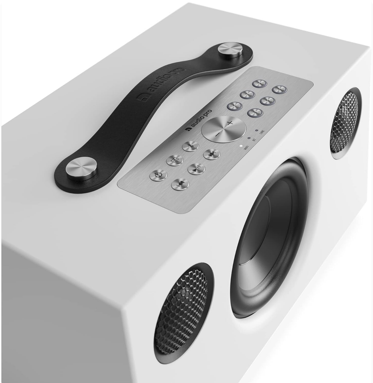
Figure 2: Top view of the speaker, highlighting the control panel with power, source selection, volume, and preset buttons.