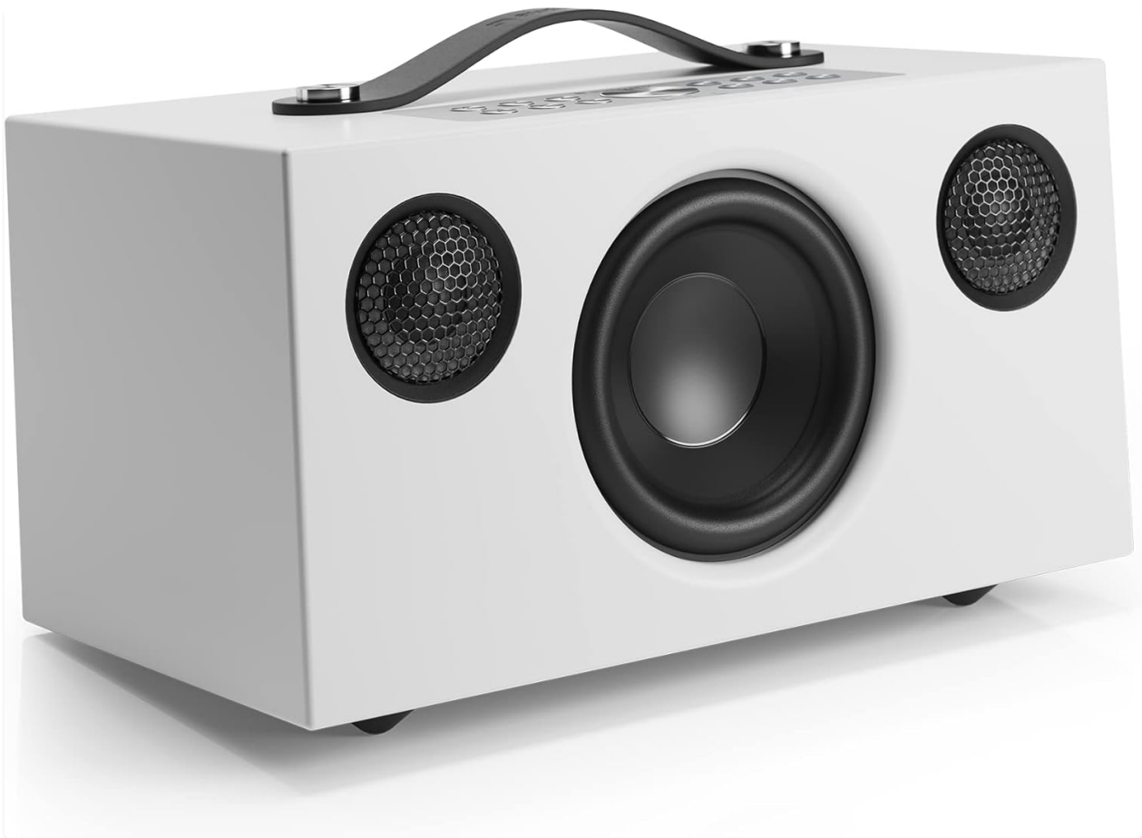
Figure 1: Front view of the Audio Pro C5 MK II speaker, showcasing the main woofer and two tweeters.