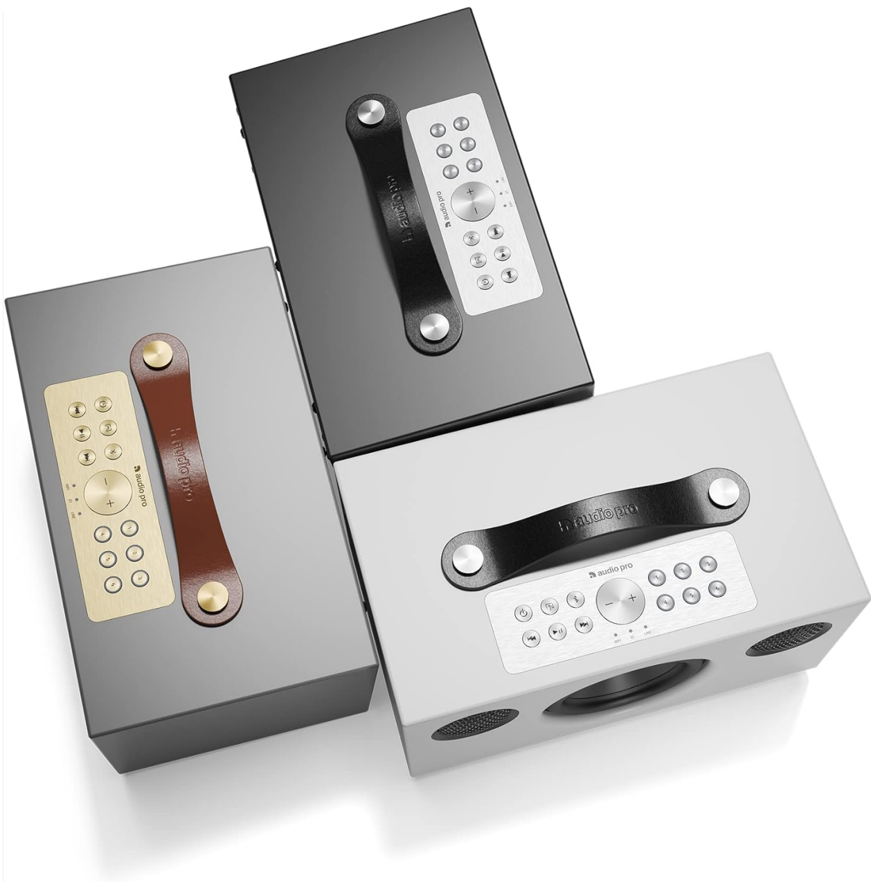
Figure 5: Multiple Audio Pro C5 MK II speakers, illustrating a multiroom setup.