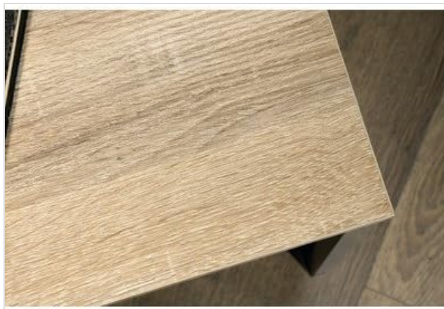
Figure 5.1: The table top displaying decorative items, highlighting its functional use.