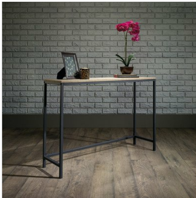
Figure 1.1: Full view of the Ermont Console Table, showcasing its charter oak top and black metal frame.

The Ermont Console Table is a versatile furniture piece designed to enhance your living space. It features a durable black metal frame and a manufactured wood top with a charter oak finish, offering a blend of modern and farmhouse aesthetics. This table is suitable for various uses, including displaying decorative items, organizing entryway essentials, or serving as an accent piece in a dining area.