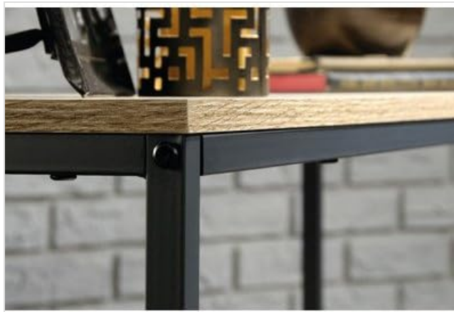
Figure 3.1: Detail of the connection between the metal frame and the manufactured wood top.