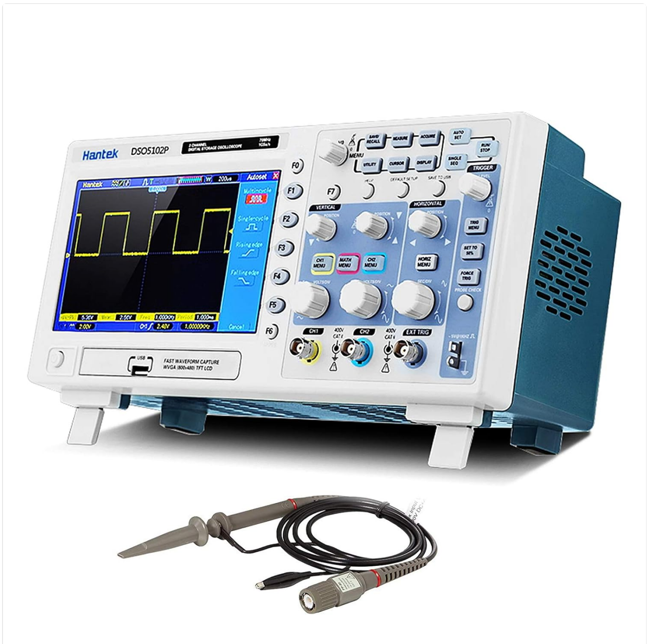
Image: The Hantek DSO5102P oscilloscope with a single probe connected to the probe compensation output, ready for adjustment.