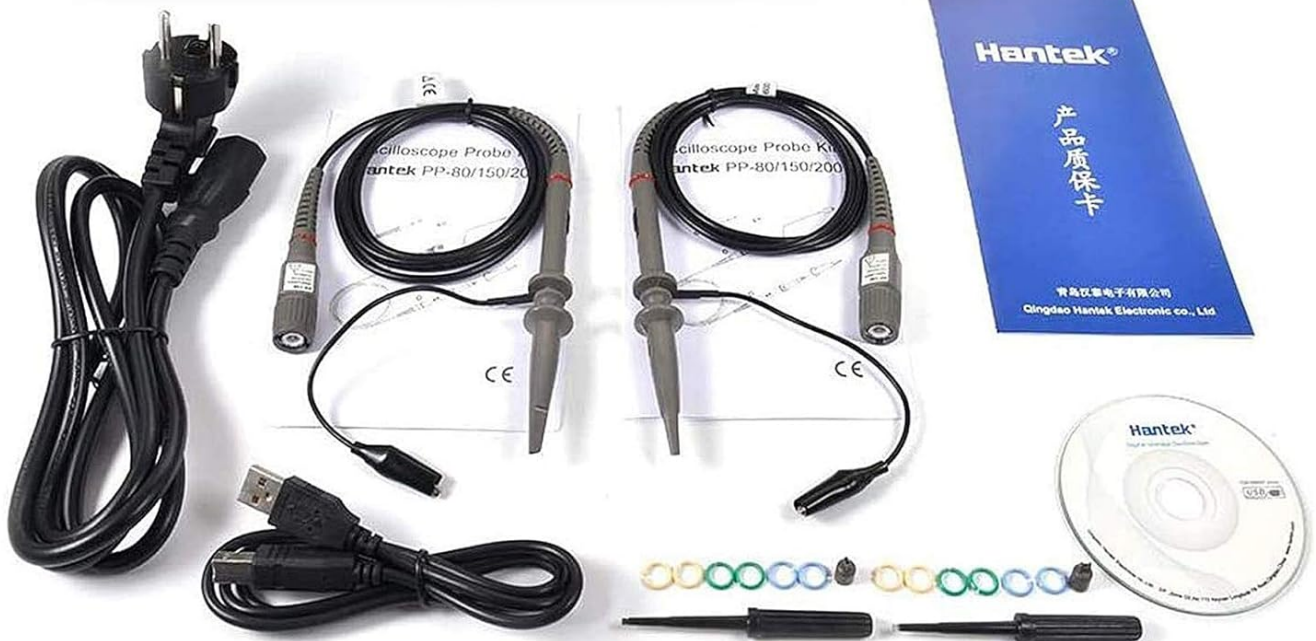
Image: The Hantek DSO5102P oscilloscope shown with its complete set of accessories, including probes, USB cable, power cable, and a CD.