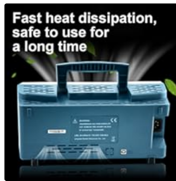
Image: Rear view of the Hantek DSO5102P oscilloscope, illustrating the ventilation grilles designed for fast heat dissipation, ensuring safe operation over extended periods.

airflow and heat dissipation. Adequate ventilation is crucial for long-term stable operation.