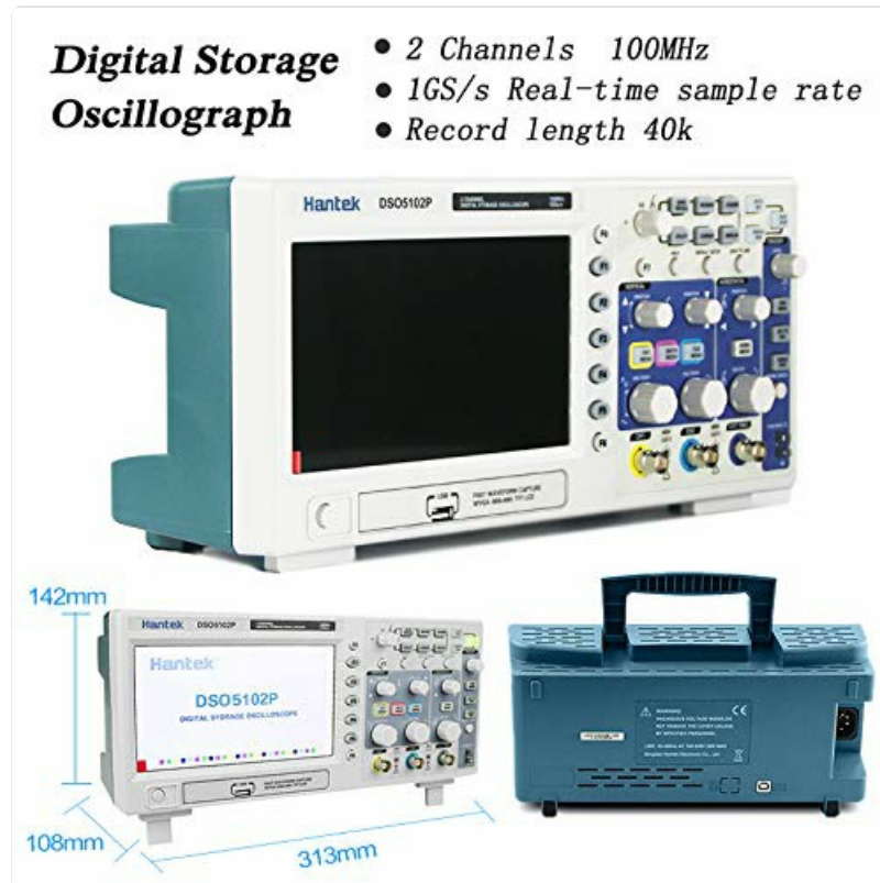
Image: The Hantek DSO5102P oscilloscope with its physical dimensions (length, width, height) clearly marked.