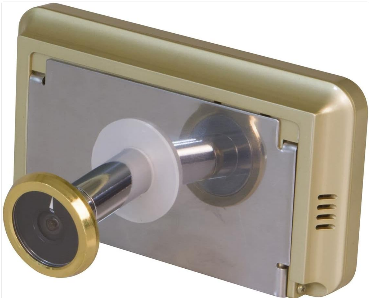
Figure 1: Rear view of the indoor unit and outdoor peephole camera, illustrating the connection and mounting points.