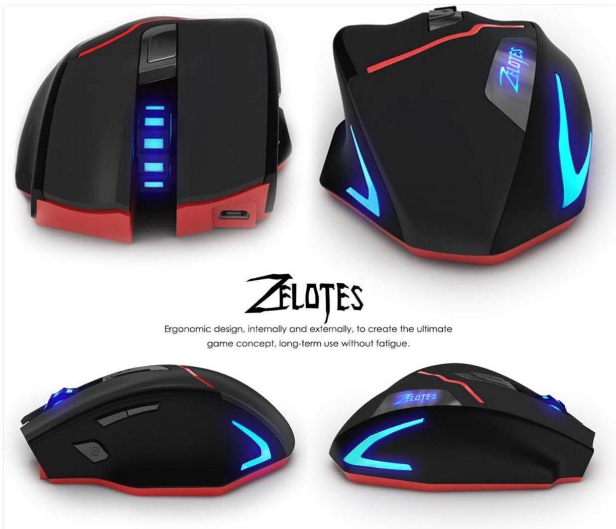
Figure 5: Physical dimensions of the Zelotes F18 Gaming Mouse.