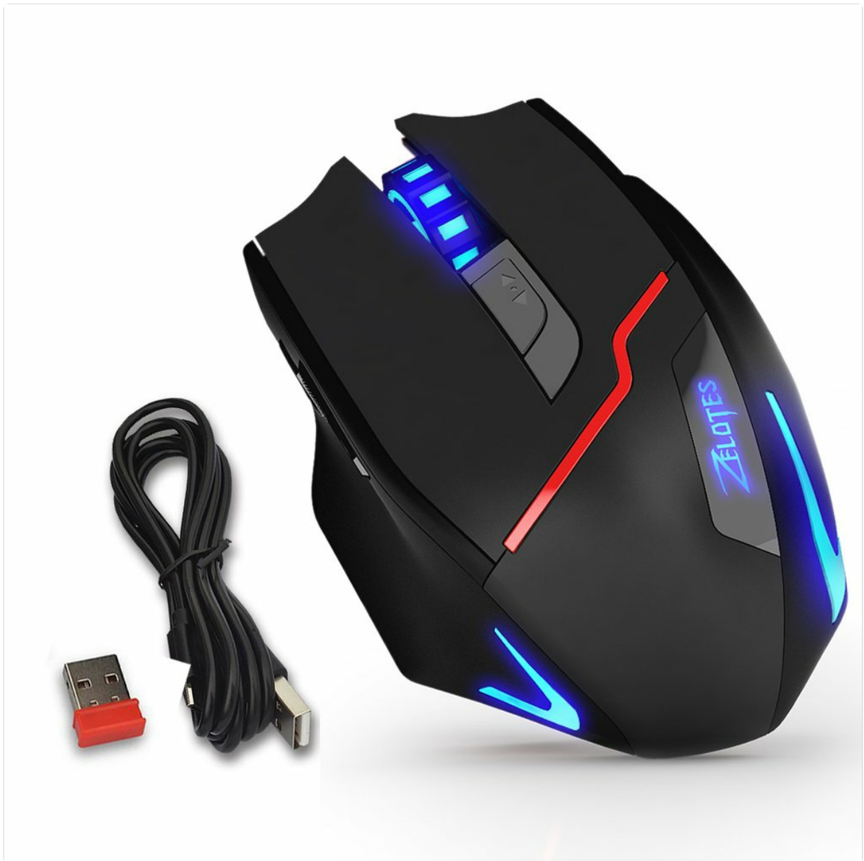
Figure 1: Zelotes F18 Gaming Mouse showcasing different LED lighting options and DPI levels.

The mouse is constructed with durable ABS material and features a braided USB cable for enhanced longevity. Its ergonomic shape is designed for comfortable long-term use.