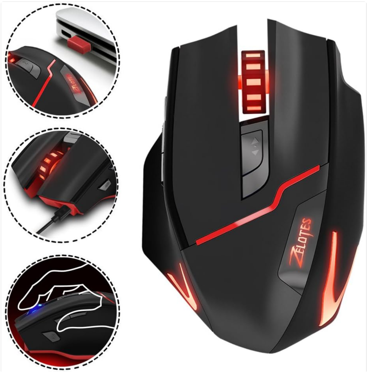
Figure 3: The Zelotes F18 mouse connected via its USB cable, also illustrating comfortable grip.