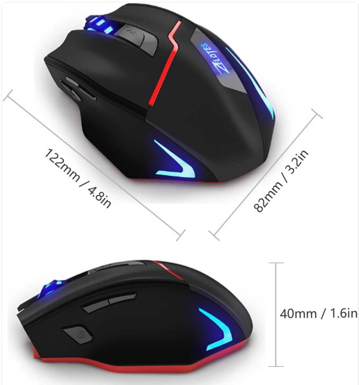
Figure 6: The ergonomic design of the Zelotes F18 mouse, crafted for comfort during extended use.