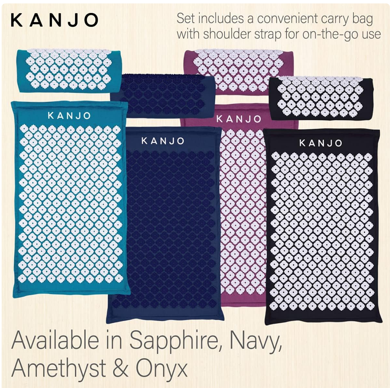
Figure 2: Mat and Pillow with Carry Bag