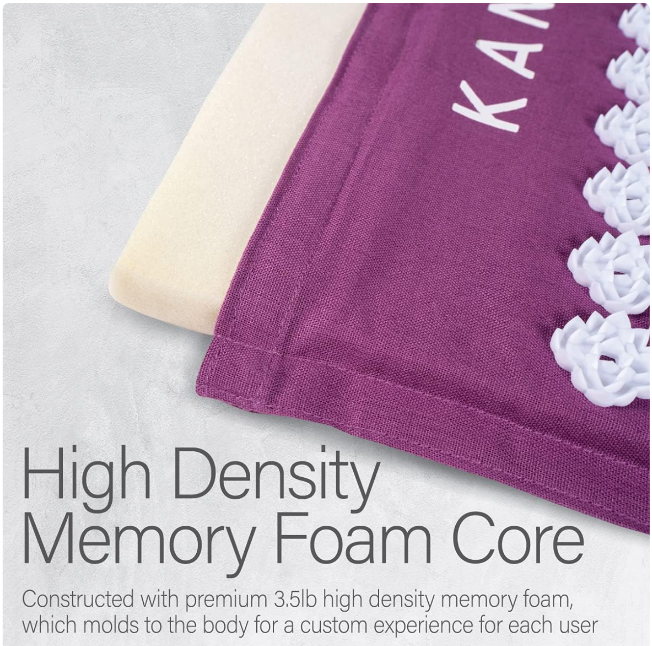
Figure 4: High Density Memory Foam Core