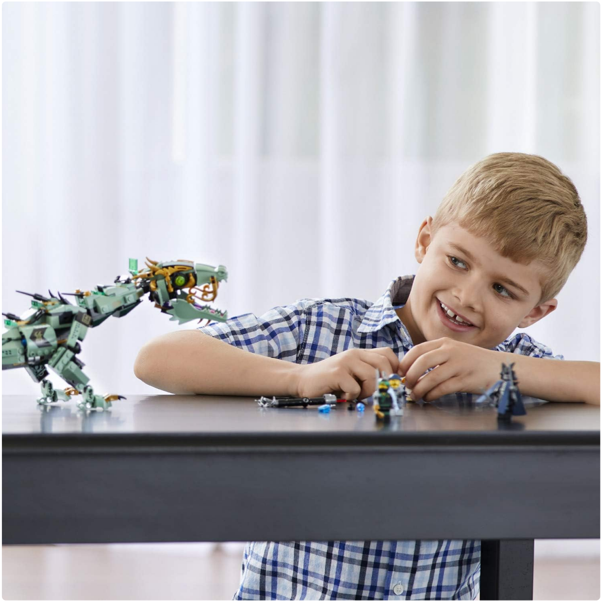
A child happily building the LEGO Green Ninja Mech Dragon on a table, demonstrating the assembly process.