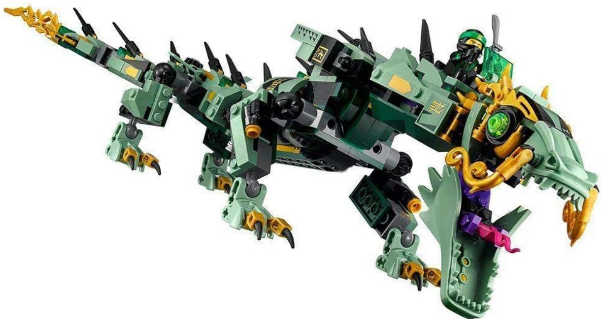
The complete LEGO Green Ninja Mech Dragon, showcasing its detailed design and articulated body.