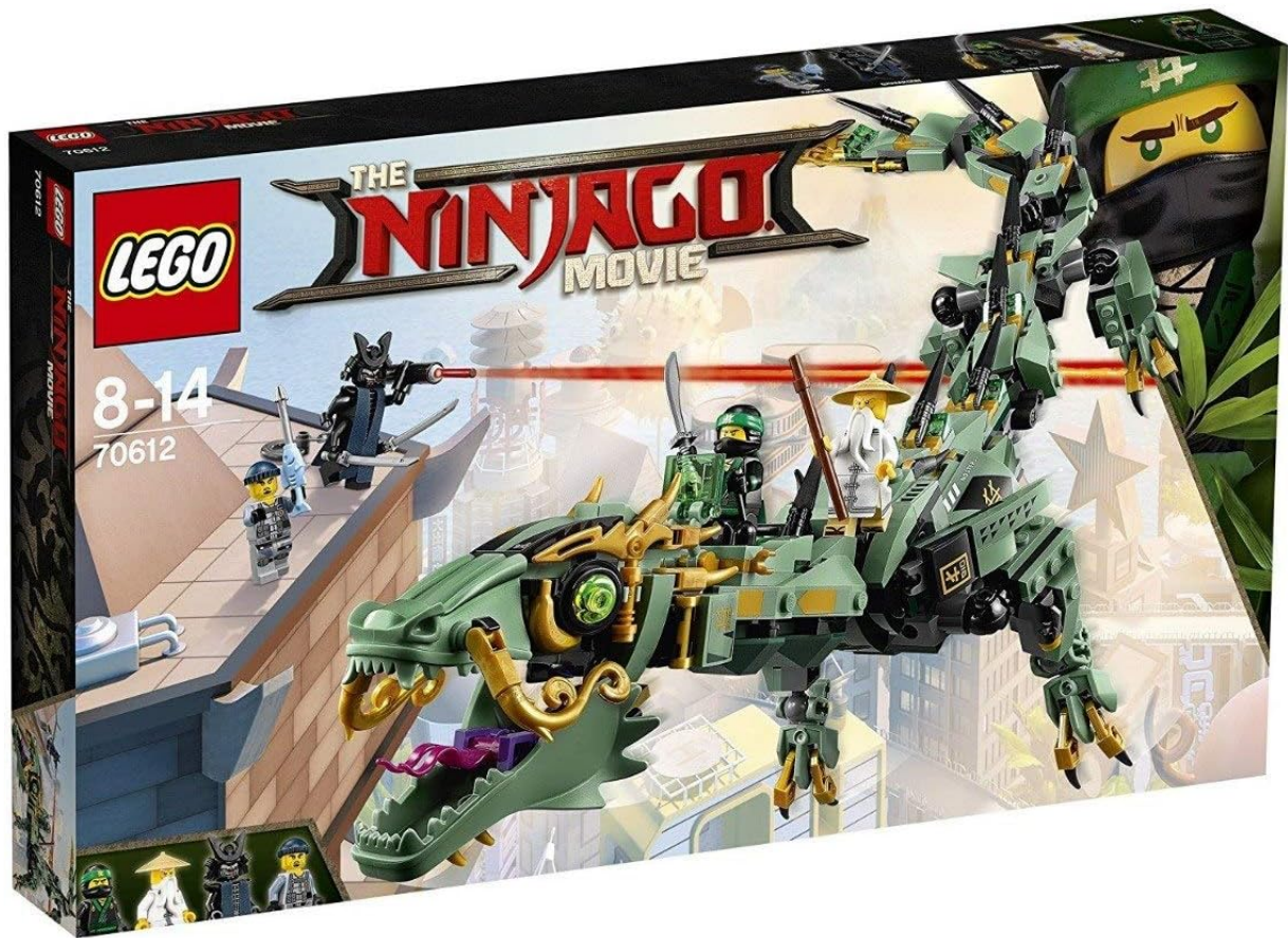
The product box for the LEGO NINJAGO Movie Green Ninja Mech Dragon 70612, showing the assembled dragon and minifigures.