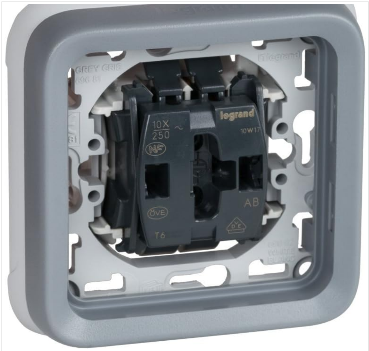
Figure 4: Internal mechanism of the switch.