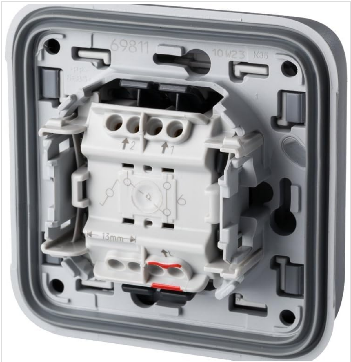
Figure 3: Detailed view of the wiring terminals.