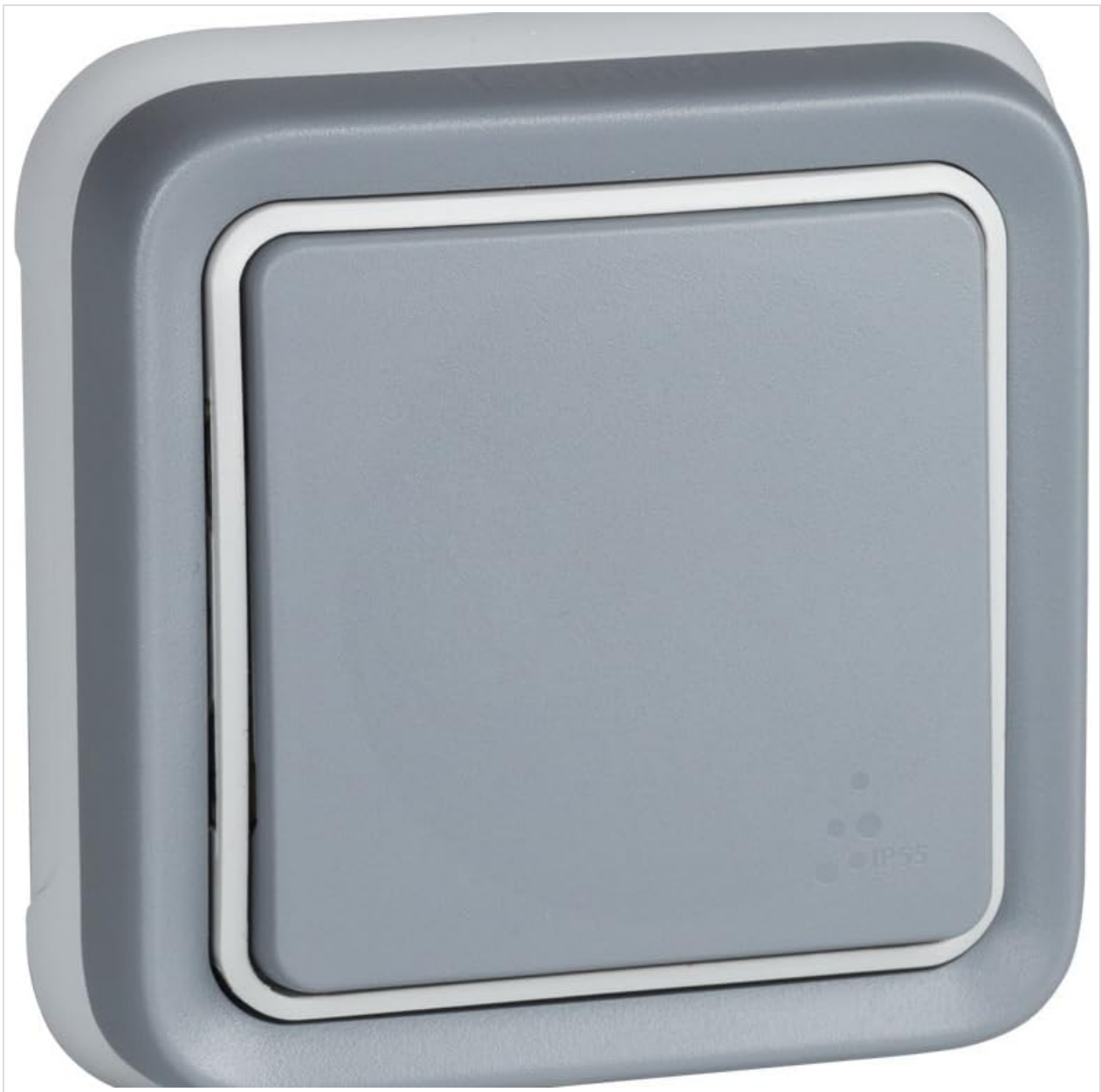
Figure 1: Front view of the Legrand 191510 Plexo Recessed Switch.