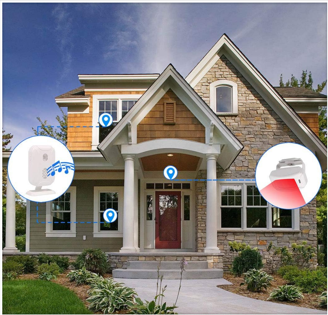
Image: Example of receiver and sensor placement for comprehensive home coverage.