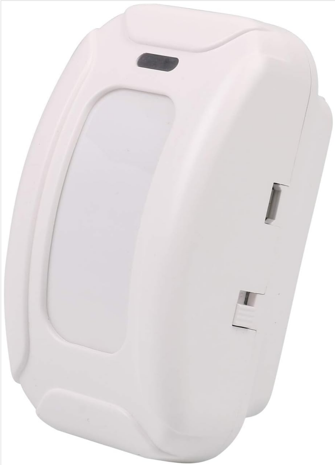
Image: The alarm system activating upon detecting an unauthorized entry, illustrating the Alarm Mode.