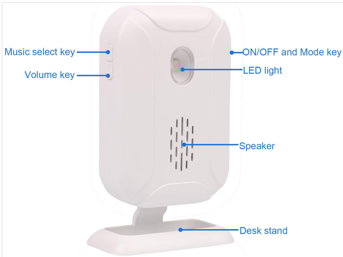
Image: Detailed view of the motion sensor with its key components labeled.