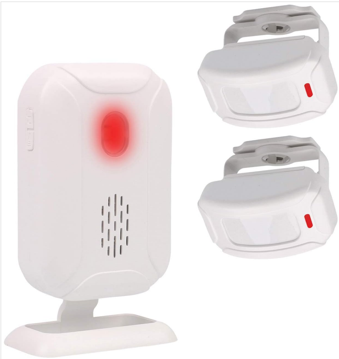
Image: The complete Mengshen Wireless Infrared Motion Sensor Alarm System, including the receiver unit and two motion sensors.