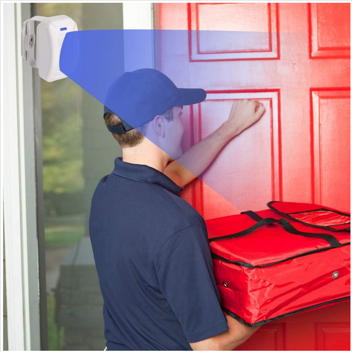
Image: A motion sensor strategically placed above a doorway to detect incoming individuals.