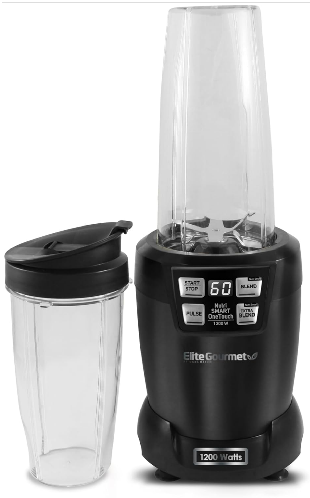
Image: The Elite Gourmet EPB-5455 Nutri-Blender fully assembled with a blending cup and travel lid, showcasing its compact design.