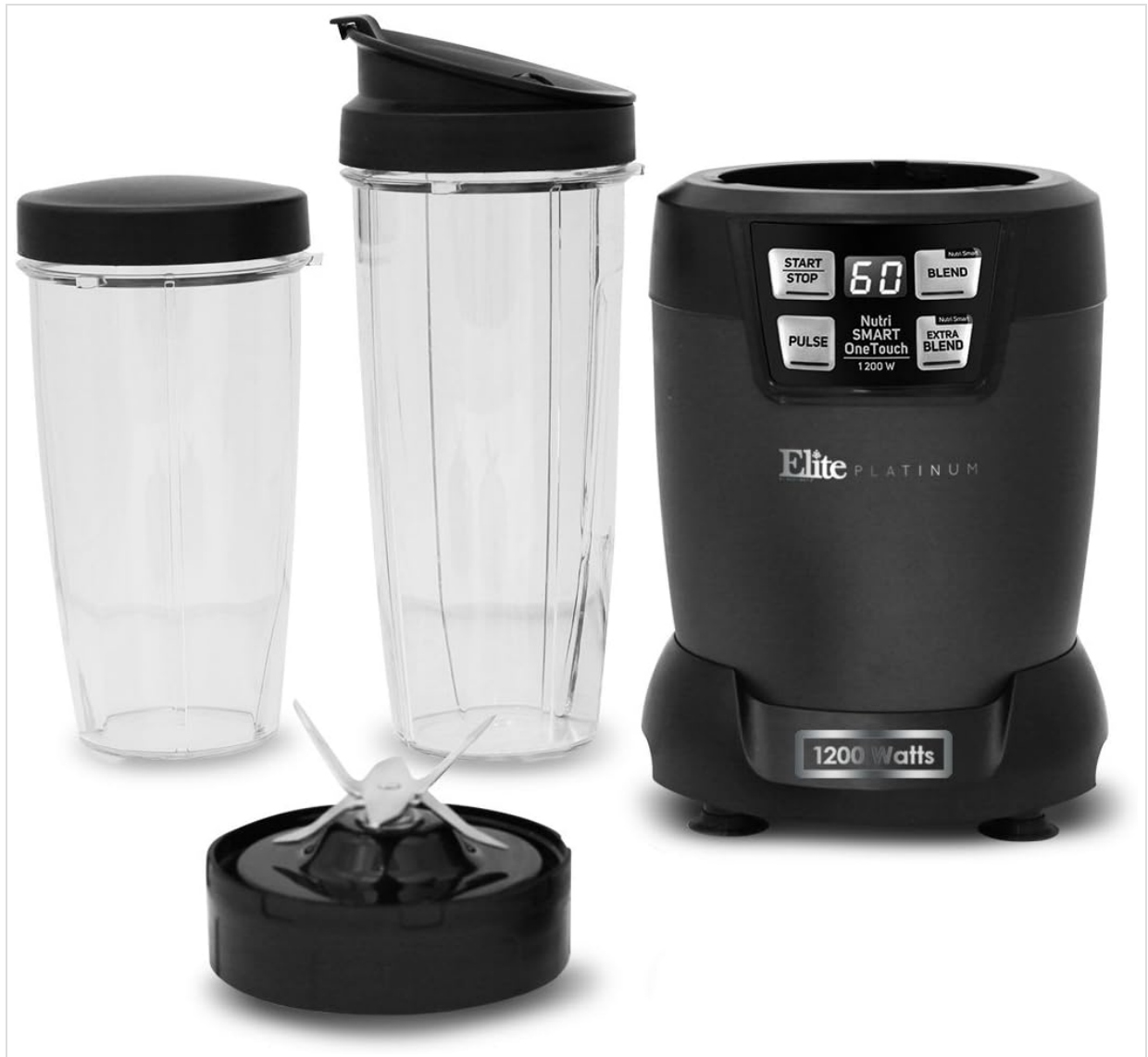
Image: All components of the Elite Gourmet EPB-5455 Nutri-Blender, including the motor base, two blending cups of different sizes, the blade assembly, and two types of lids.