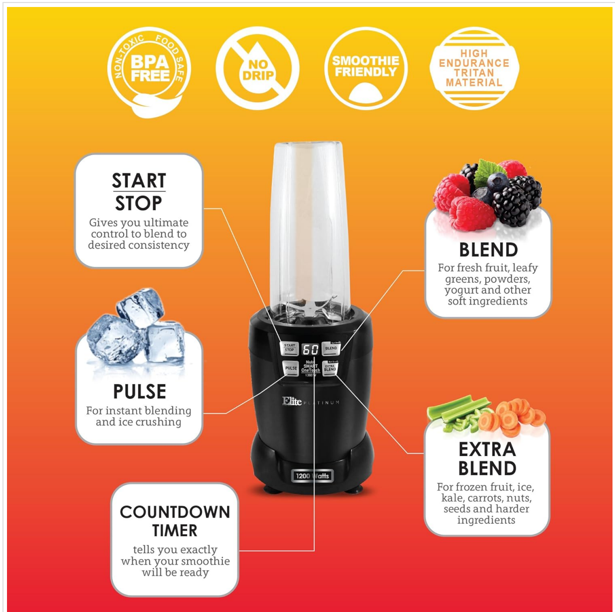
Image: Detailed view of the Elite Gourmet EPB-5455 Nutri-Blender's control panel, highlighting the START/STOP, PULSE, BLEND, and EXTRA BLEND buttons, along with the digital countdown timer.