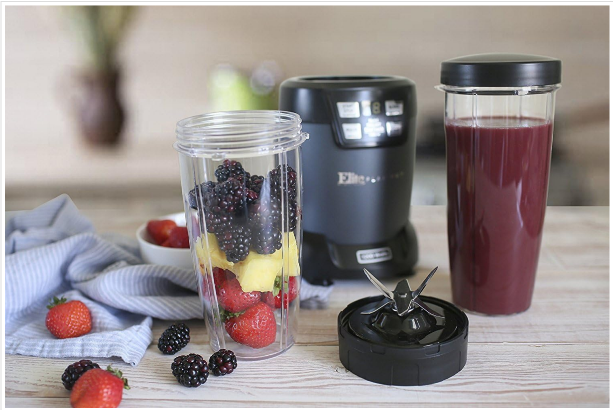
Image: A blending cup filled with fresh ingredients, positioned next to the Elite Gourmet EPB-5455 Nutri-Blender base, illustrating preparation for blending.