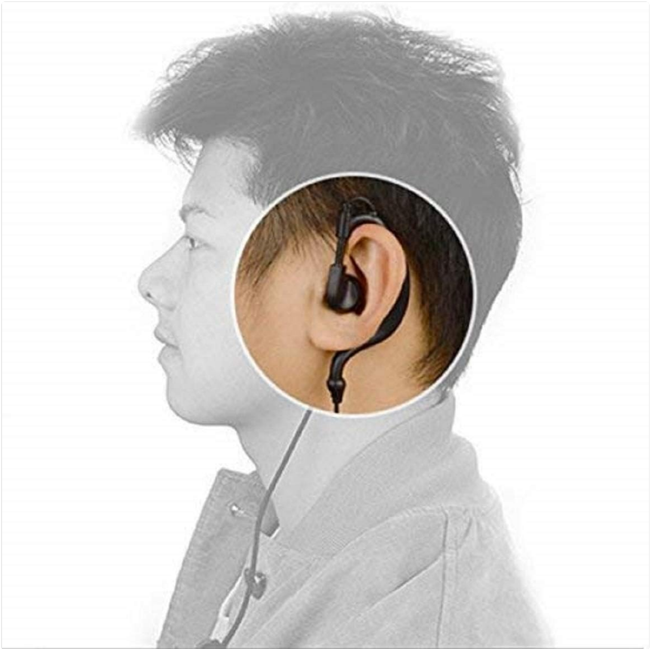
Image: A person wearing the earhook earpiece, demonstrating how it fits securely on the ear.