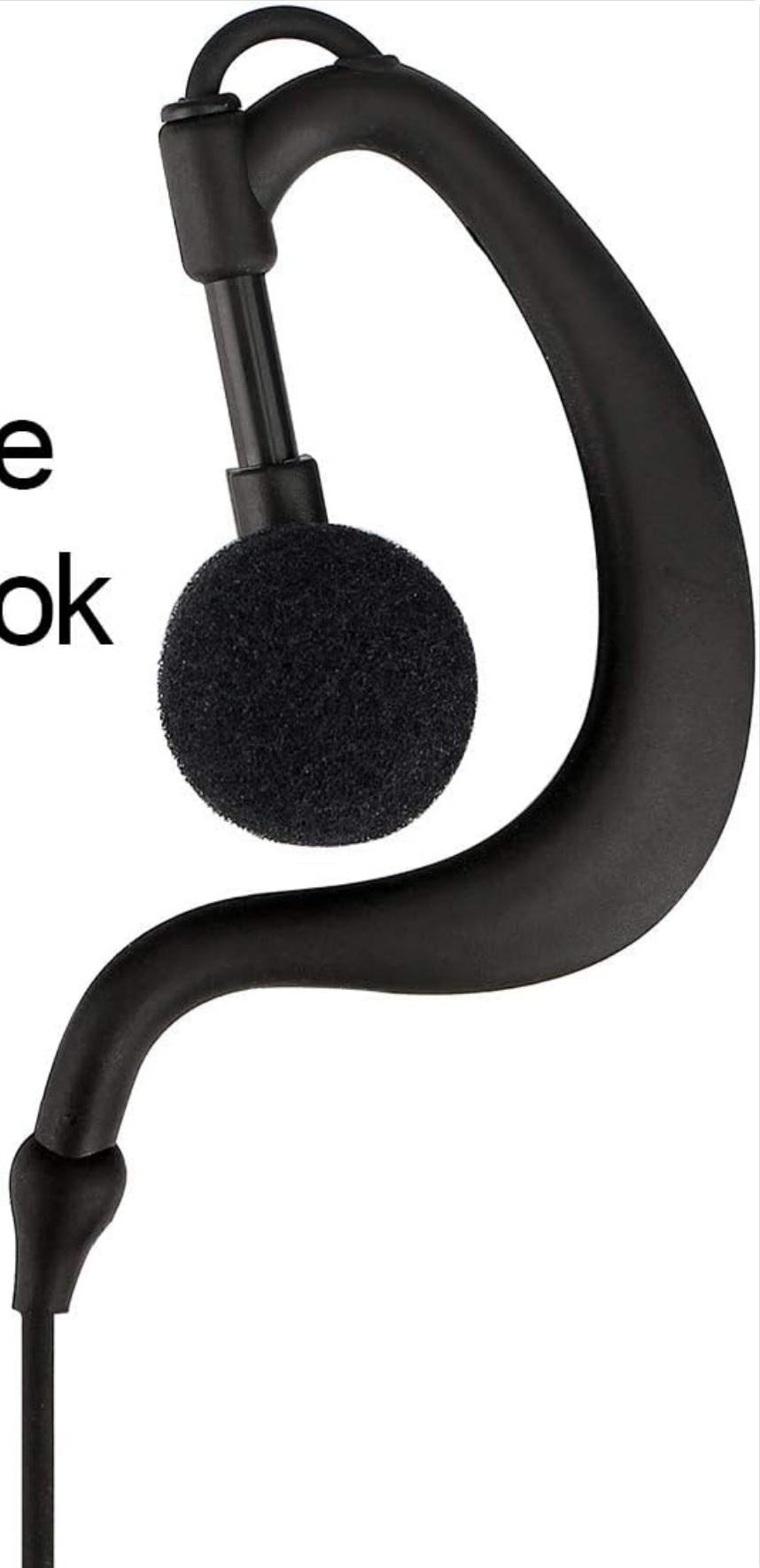
Image: A close-up of the C-type earhook, illustrating its ergonomic shape for comfortable wear.