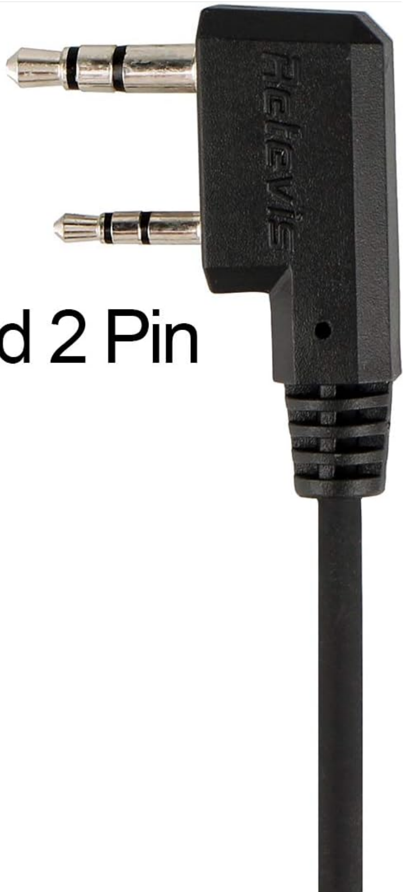
Image: A detailed view of the K-head 2-pin connector, highlighting its design for compatibility.