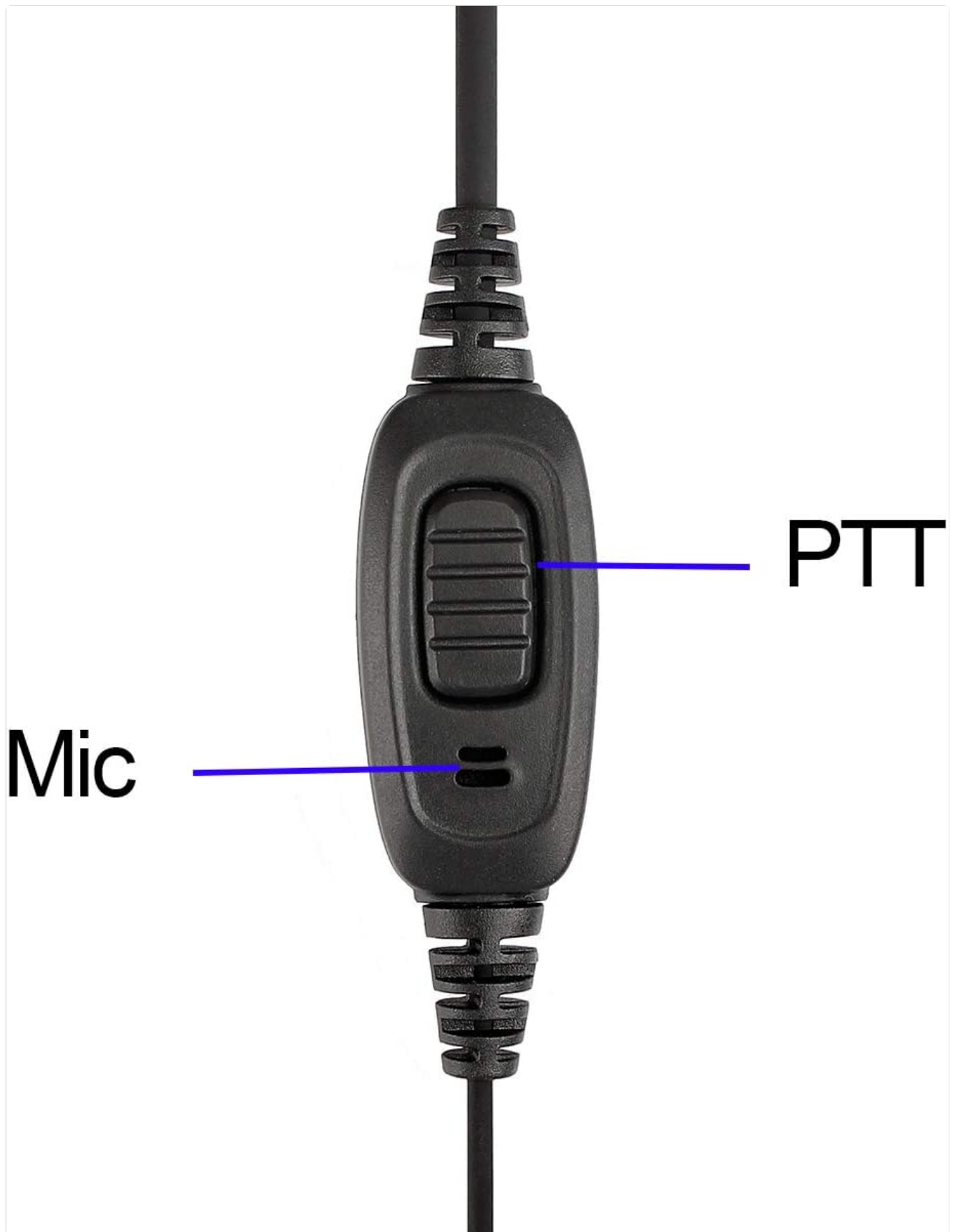
Image: A detailed view of the inline PTT button and microphone, indicating their functions.