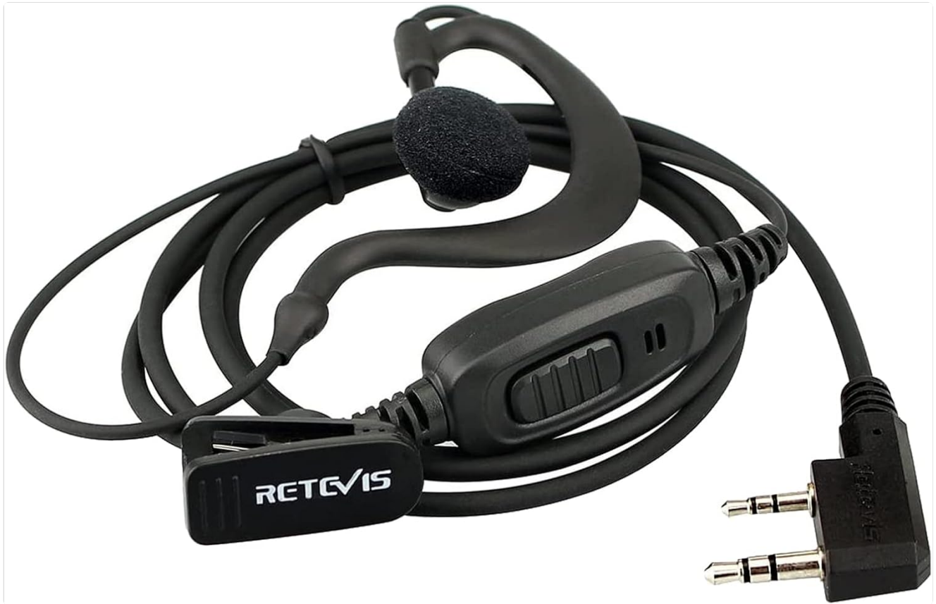
Image: The Retevis earhook earpiece connected to a two-way radio, demonstrating proper attachment.