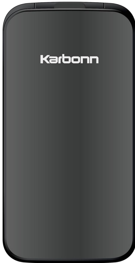
Figure 3.2: Front view of the Karbonn K-Flip phone in the closed position, featuring the Karbonn brand logo on the exterior.