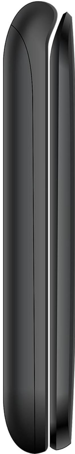
Figure 3.4: Side view of the Karbonn K-Flip phone in the closed position, illustrating its compact and slim profile.