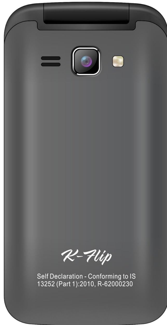
Figure 3.3: Rear view of the Karbonn K-Flip phone in the closed position, highlighting the rear camera and the 'K-Flip' model designation.