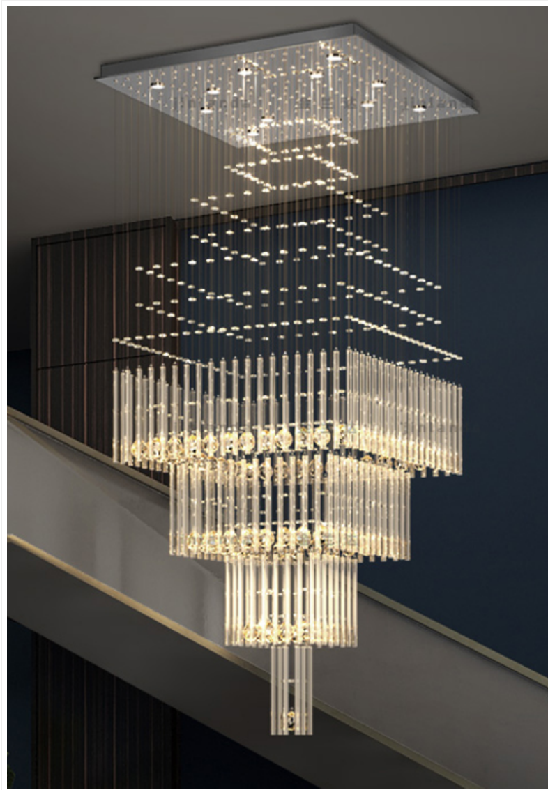
Image: Chandelier dimensions and recommended installation height for optimal clearance.

Your browser does not support the video tag.