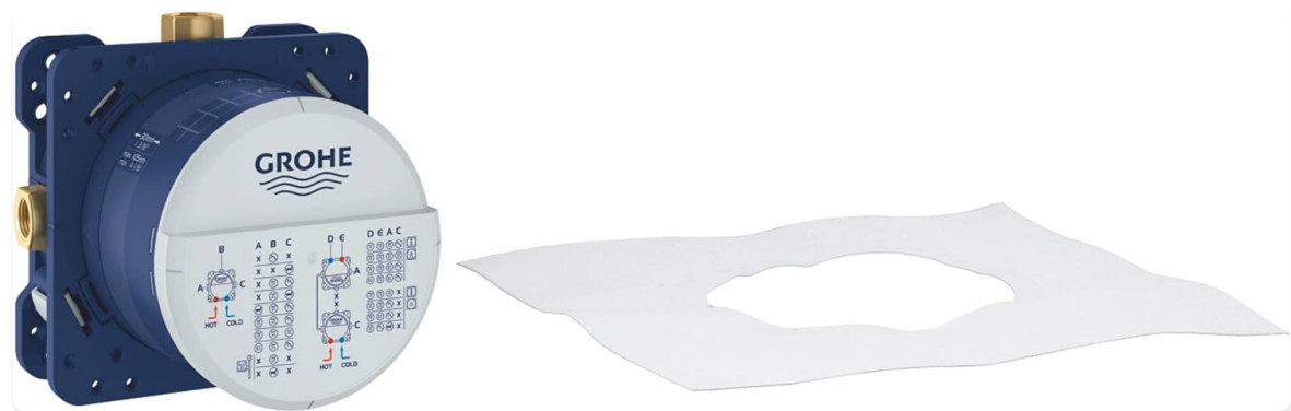
Figure 2: The GROHE Rapido Smartbox unit with its protective cover and mounting plate.