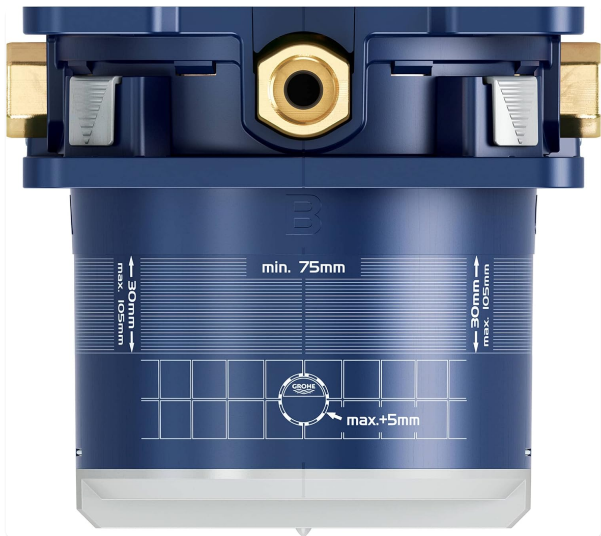
Figure 3: Rough-in depth markings on the Smartbox, indicating minimum 75mm and maximum 105mm.

The installation depth for the Smartbox is between 75mm and 105mm (approximately 3 to 4.1 inches). Ensure your wall cavity accommodates these dimensions. The unit features a pretensioning stopper for secure mounting.