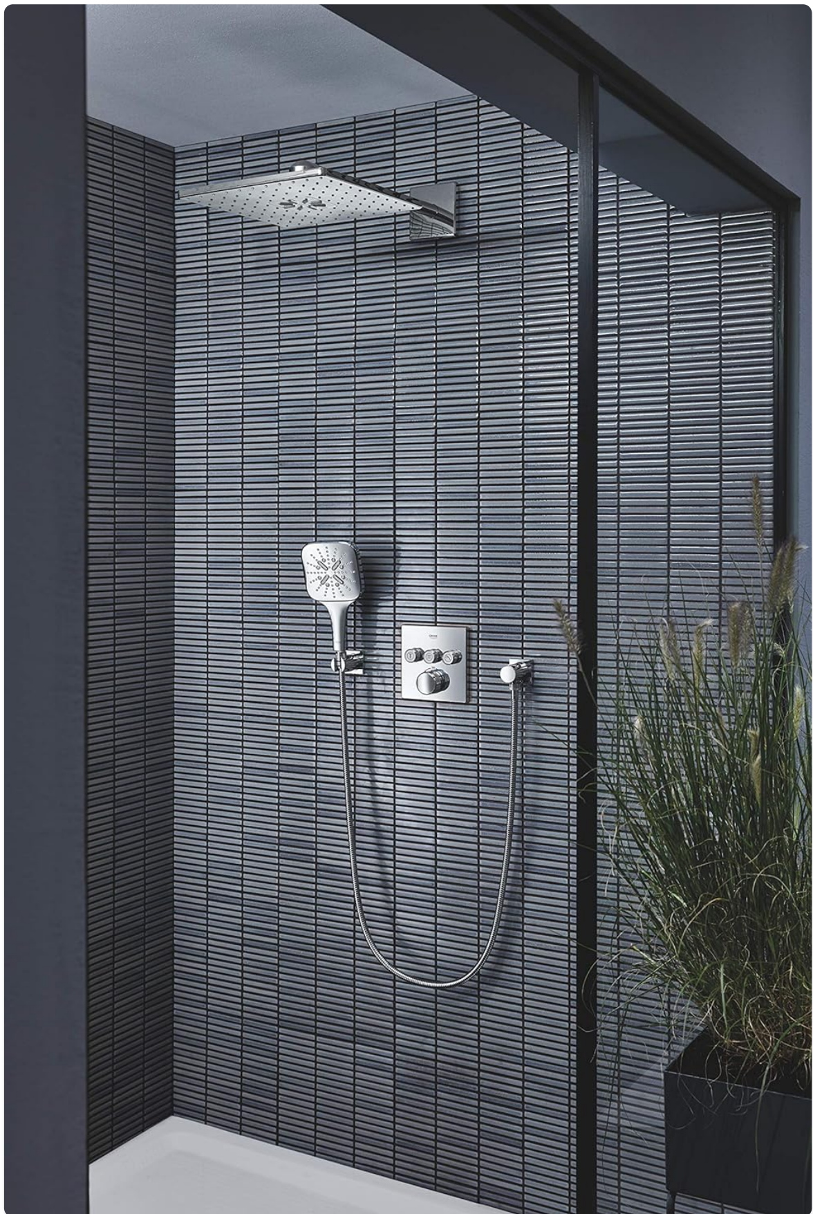
Figure 1: Example of a GROHE shower system installed with the Rapido Smartbox.