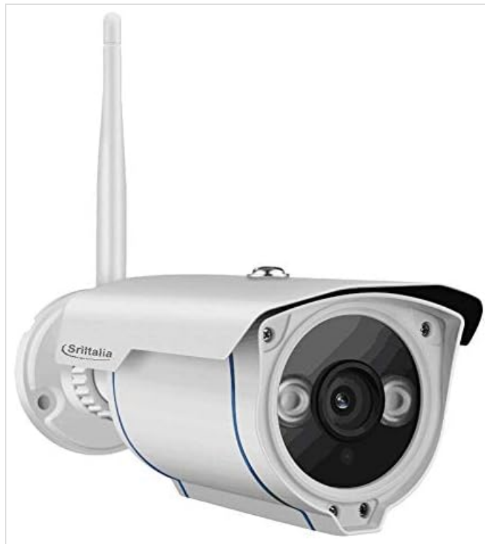
Figure 1: Front view of the Sricam SP007-SH IP Camera, showing the lens, infrared LEDs, and antenna.