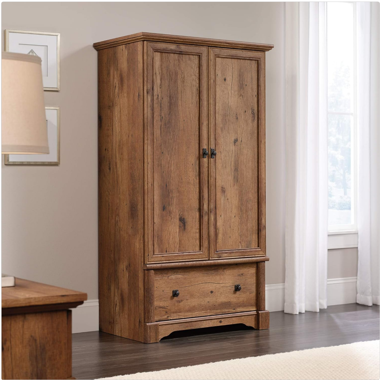
Figure 5: The Sauder Palladia Armoire in a bedroom setting, showcasing its Vintage Oak finish.