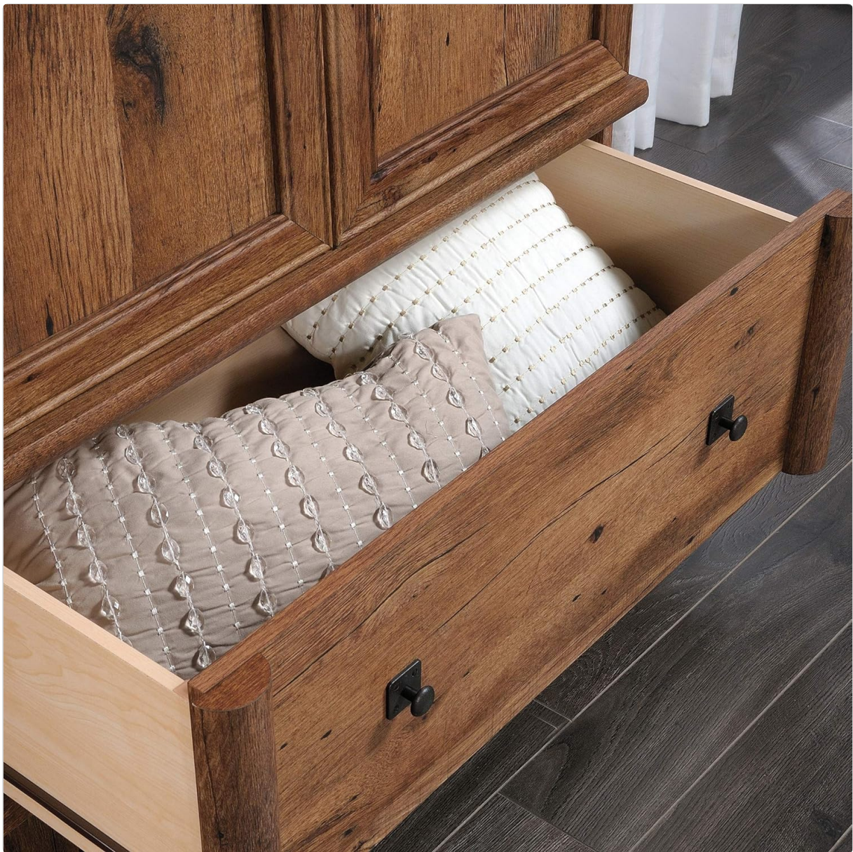
Figure 4: A close-up view of the armoire's drawer, shown open and containing soft items.