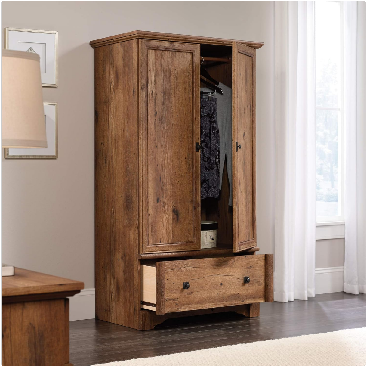
Figure 3: The armoire with its doors open, revealing the garment rod and an open drawer below.