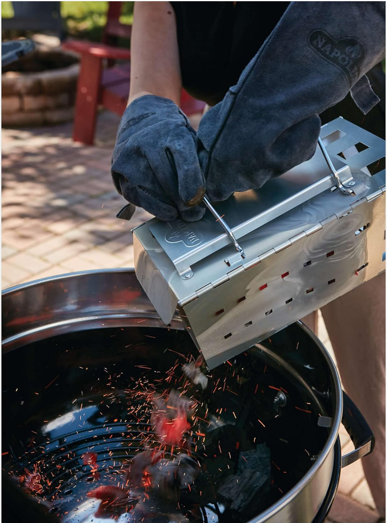
Image: Lit charcoal being carefully poured from a chimney starter into the grill's charcoal bowl.