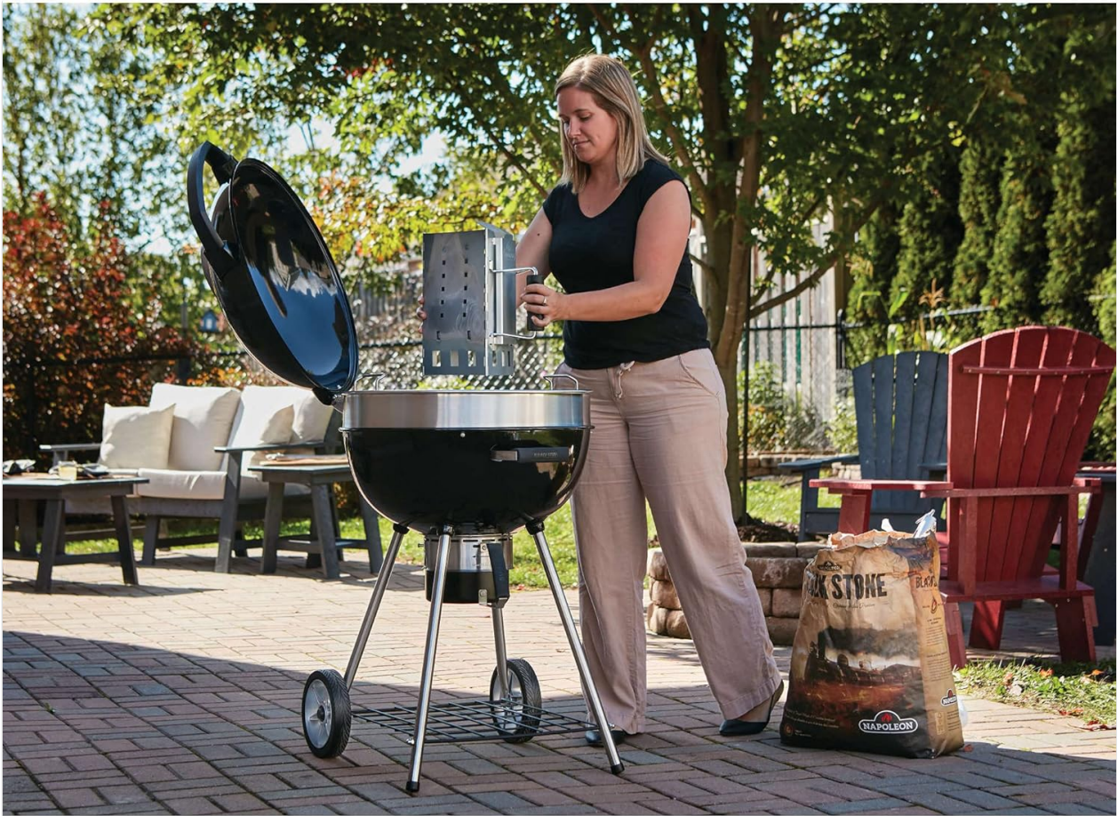
Image: The Napoleon Rodeo Pro Charcoal Kettle Grill with an overlay indicating a 10 Year Limited Warranty.

This Napoleon PRO22K-LEG-2 Rodeo Pro Charcoal Kettle Grill comes with a 10 Year Limited Warranty . Please refer to the warranty documentation included with your product for full terms and conditions.