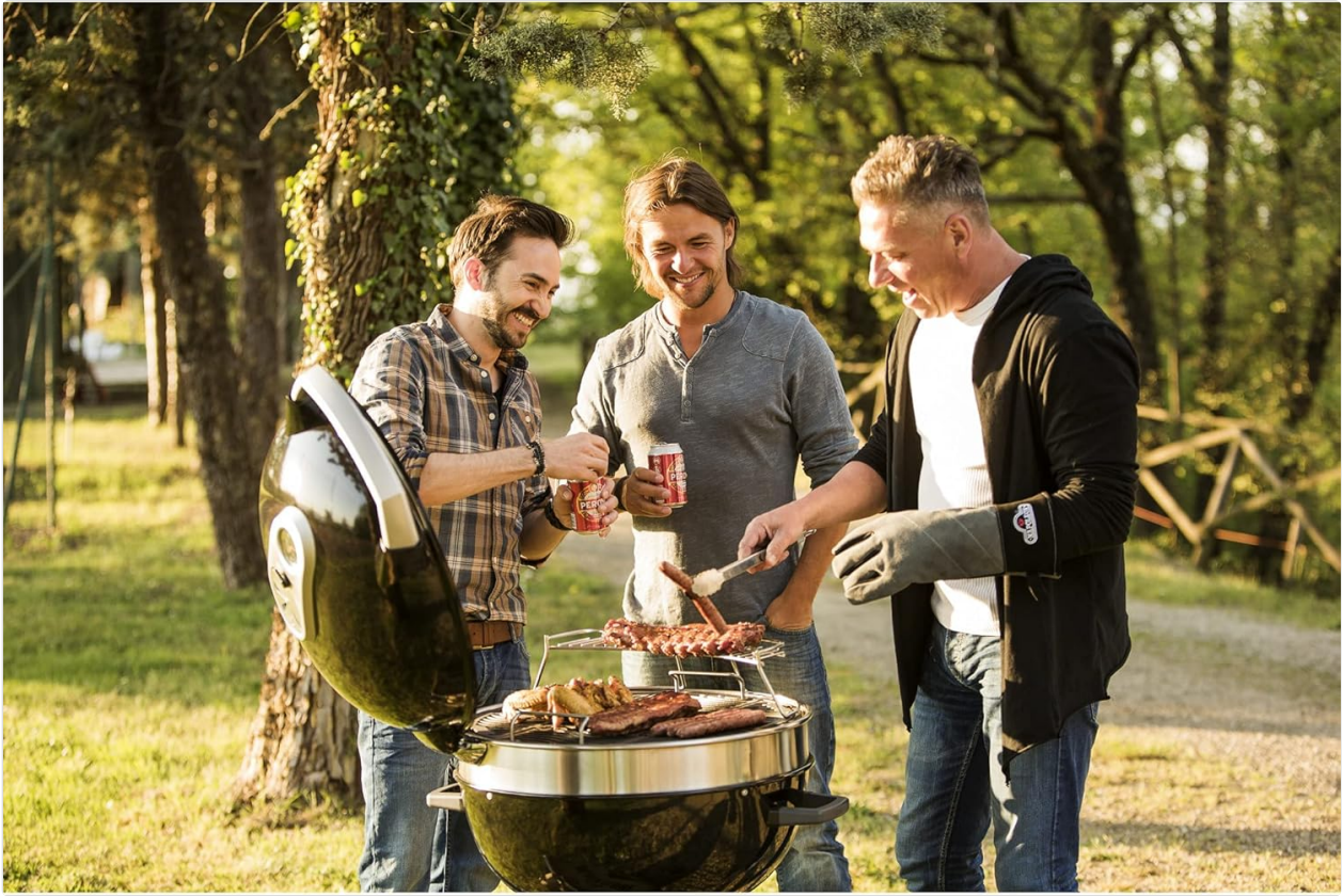
Image: The grill with its lid open, showing the hinged cast iron cooking grids in an open position for easy charcoal access.