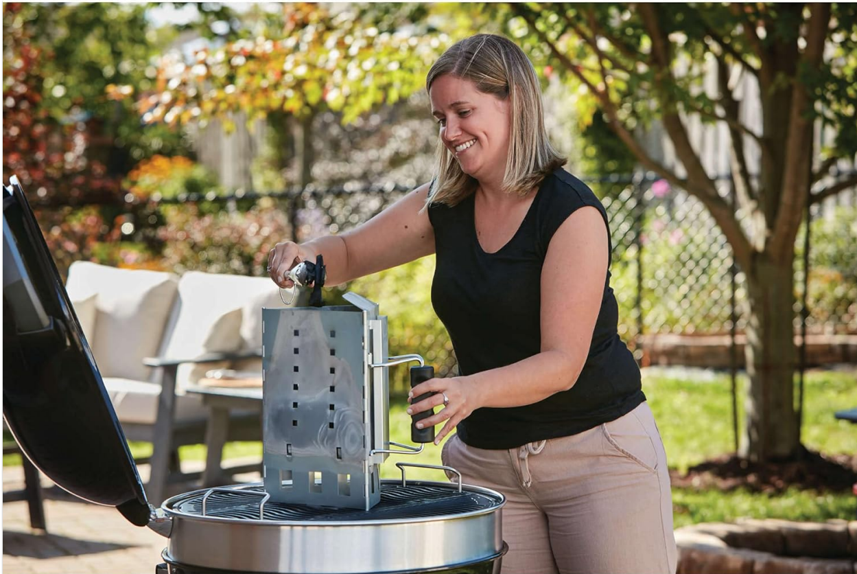
Image: A person preparing charcoal using a chimney starter next to the grill.

To light your charcoal, we recommend using a charcoal chimney starter for efficiency and safety. Place the chimney starter on the charcoal grate, fill it with charcoal, and ignite a fire starter beneath it. Once the charcoal is fully ashed over, carefully transfer it to the grill.