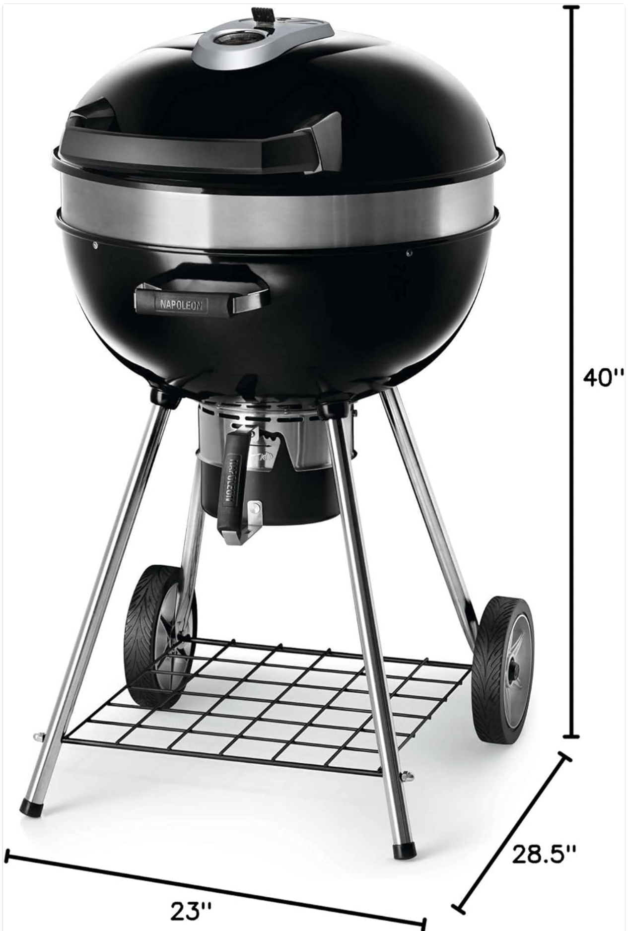
Image: Diagram showing the dimensions of the Napoleon Rodeo Pro Charcoal Kettle Grill: 28.5"D x 23"W x 40"H.