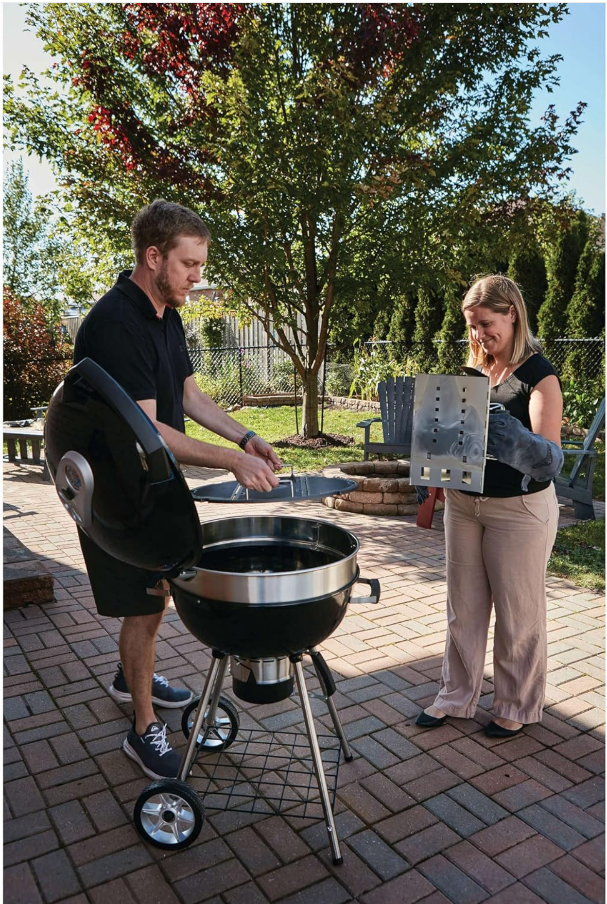
Image: The Napoleon Rodeo Pro Charcoal Kettle Grill positioned on a patio, ready for use. For a visual overview of the product's features, please watch the official video:

Video: Official product features video for the Napoleon PRO22K-LEG-2 Charcoal Kettle Grill, demonstrating its design and functionalities.